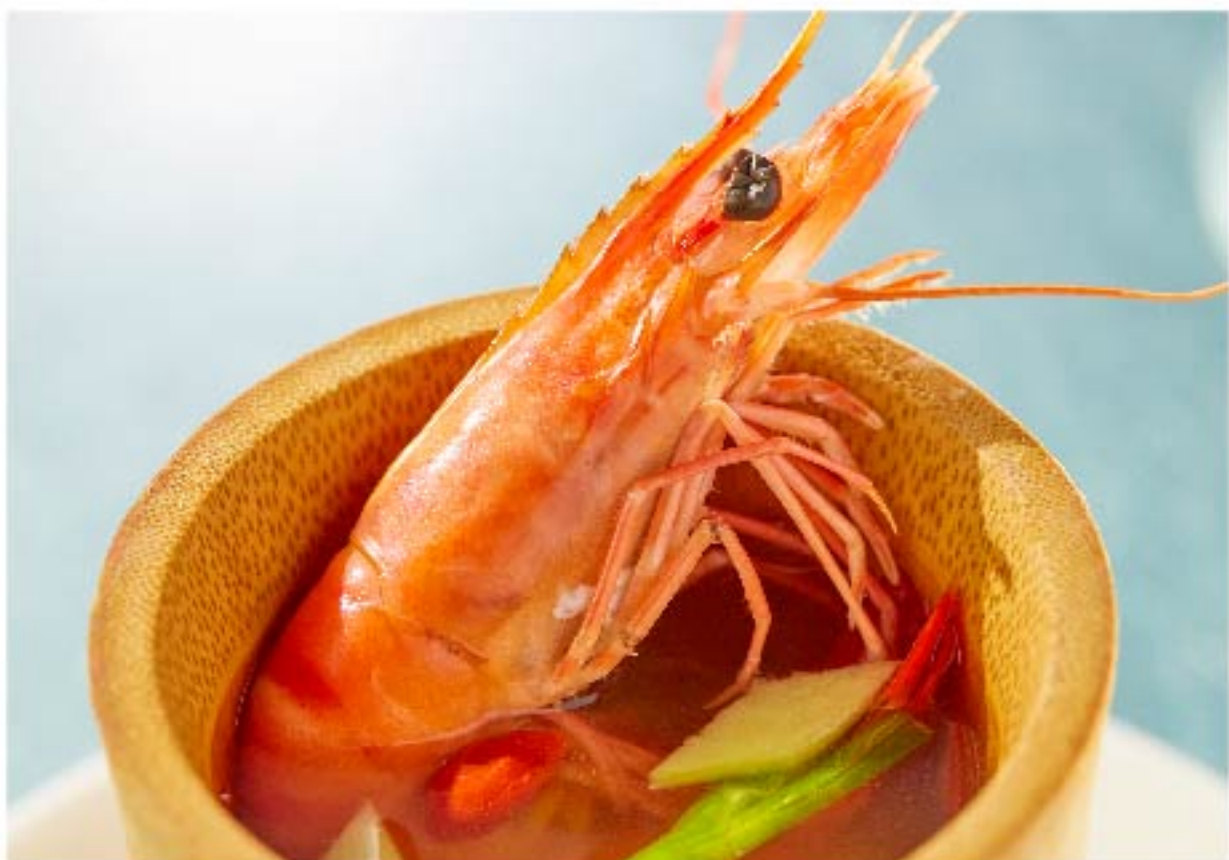
酒香竹筒虾 Herbal Prawn