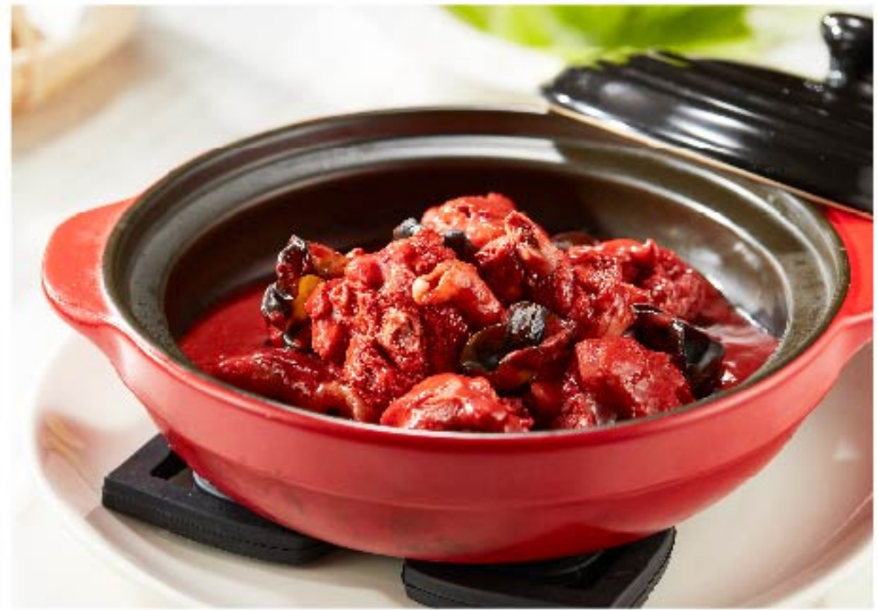
福州风味红糟鸡 Claypot Chicken in Fermented Red Rice Wine