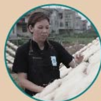
5 莆田黄石镇 兴化米粉 Huang Shi Town in Putian City Heng Hwa Bee Hoon