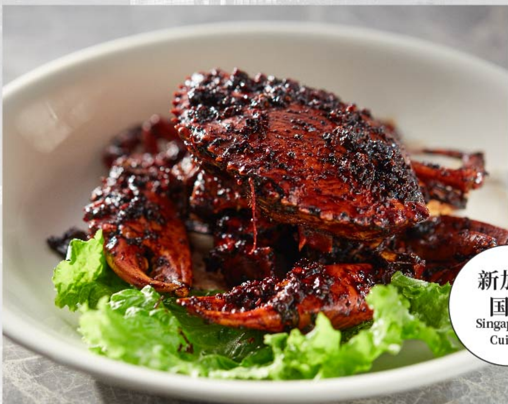
黑胡椒螃蟹 Black Pepper Crab