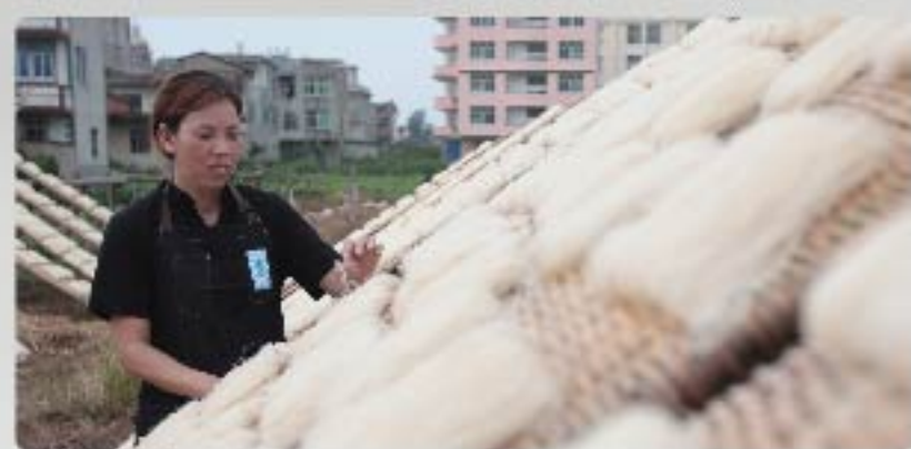
兴化米粉产地:莆田黄石镇 Origin of Heng Hwa Bee Hoon: Huangshi Town, Putian.