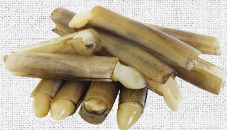
苏格兰蛭子皇 Razar Clam 时价 Market Price