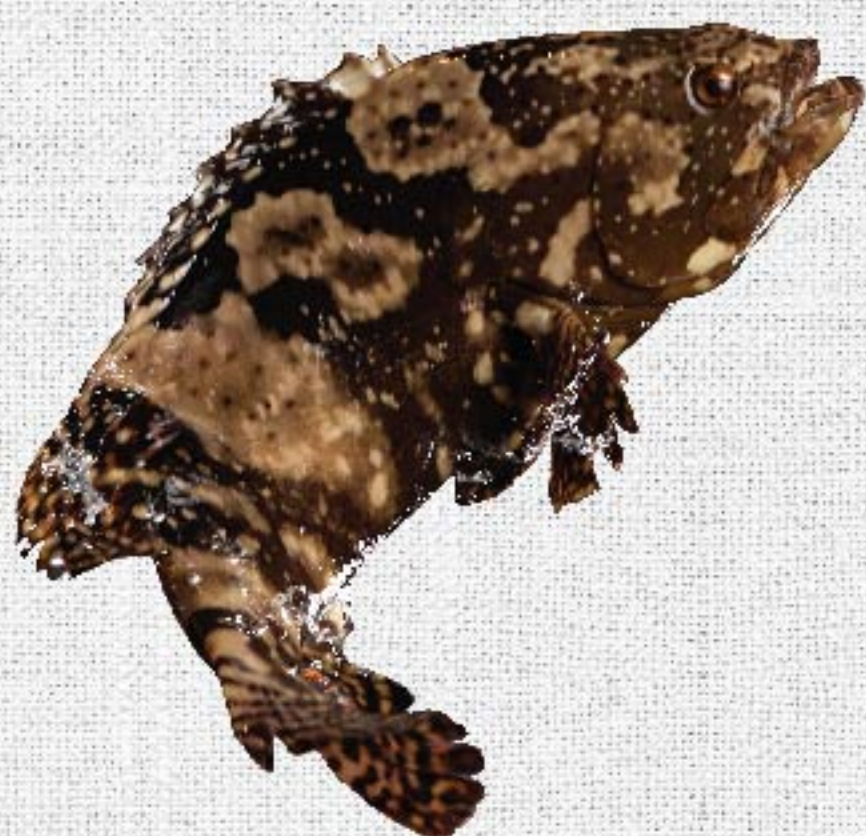
花尾趸 Giant Grouper 时价 Market Price