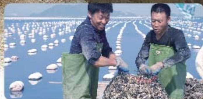
海蛎产地: 福建兴化湾江口港 Origin of oysters: Jiangkou Port, Xinghua Bay, Fujian.