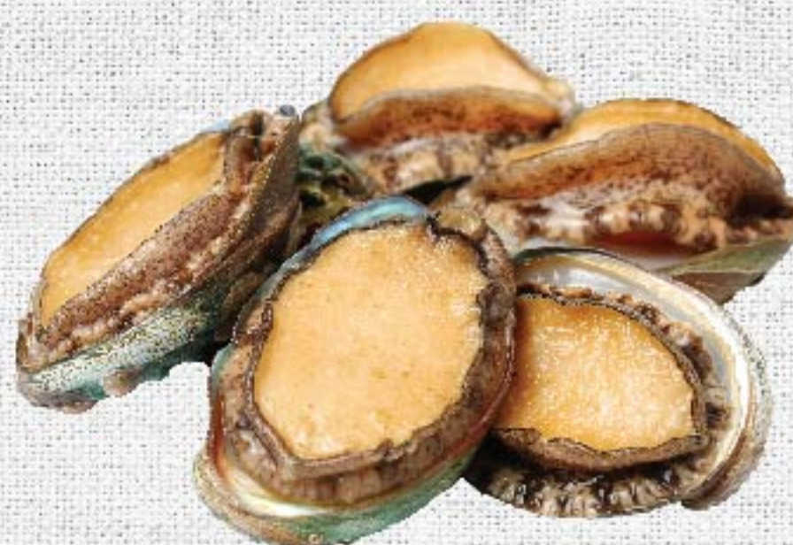
大连活鲍鱼5头 Fresh Dalian Abalone (5-head) 时价 Market Price

图片只供参考。所有价格均以澳门元计算，并附加10%服务费。如对任何食物有过敏反应，请于点餐前通知服务团队。 Photos for reference only. All prices are in MOP and subject to a 10% service charge. Please inform the service team of any food allergy or dietary requirements prior to ordering.