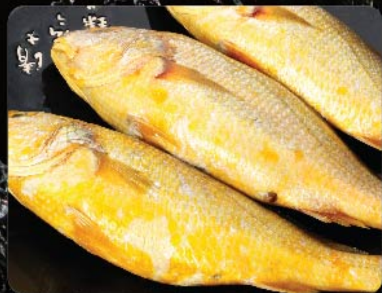
只有深夜捕捞的黄花鱼, 鱼肚才是金黄色 Only yellow croakers caught at midnight have golden maws.