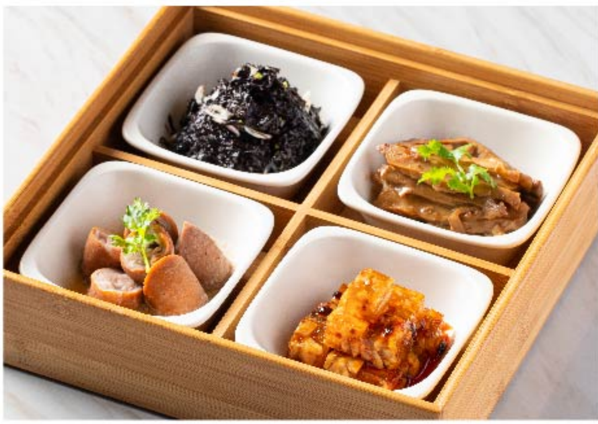
精美四小拼 Starters Platter