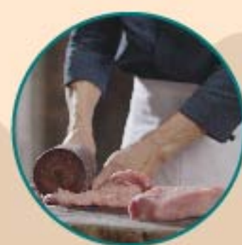
4 莆田涵江厚峰村 手打扁肉 Han Jiang District Hou Feng Village in Putian City Handmade Bian Rou