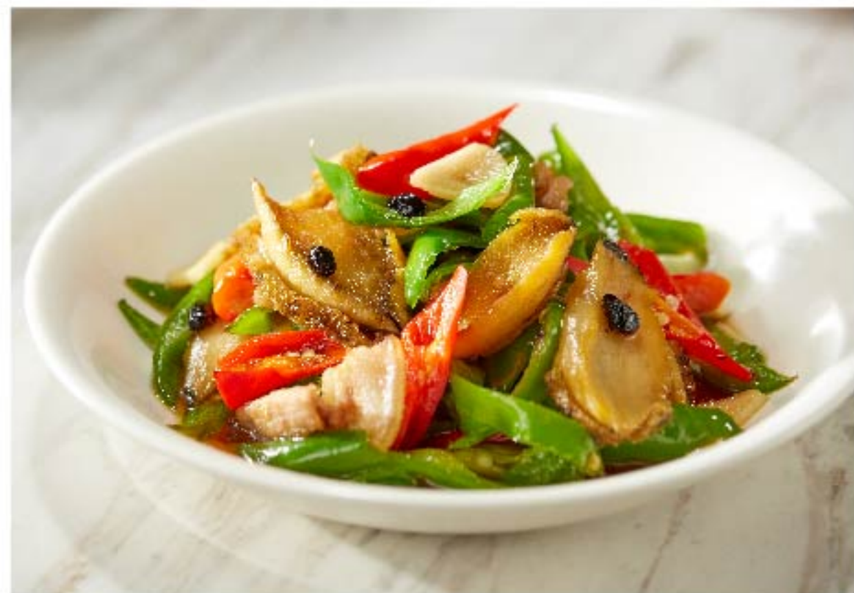
鲍鱼辣椒小炒肉 Stir-fried Spicy Abalone and Pork