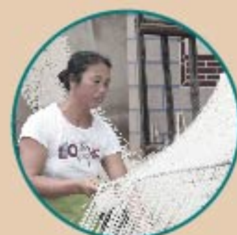
6 莆田黄石镇 妈祖面线 Huang Shi Town in Putian City Mazu Mee Sua