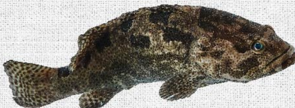
老虎斑 Grouper 时价 Market Price