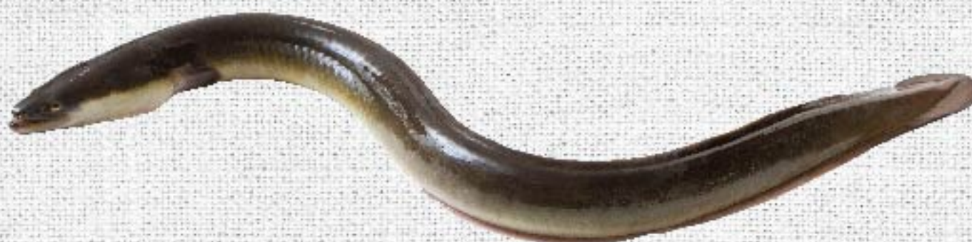
河鳗 Eel 时价 Market Price