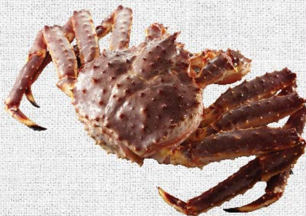
阿拉斯加蟹 Alaskan King Crab 时价 Market Price