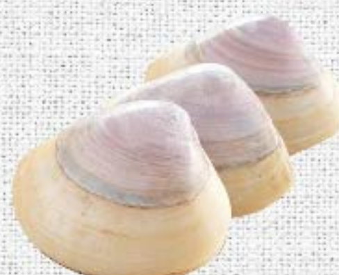
贵妃蚌 Royal Mussels 时价 Market Price

图片只供参考。所有价格均以澳门元计算，并附加10%服务费。如对任何食物有过敏反应，请于点餐前通知服务团队。 Photos for reference only. All prices are in MOP and subject to a 10% service charge. Please inform the service team of any food allergy or dietary requirements prior to ordering.