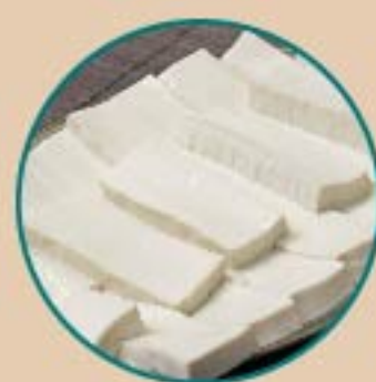
3 莆田市 盐卤豆腐 Putian City Bittern Bean Curd