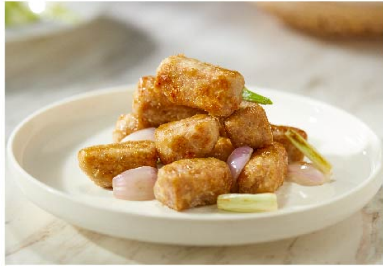
酥炒芋芯 Stir-fried Yam

澳门元 MOP 58 件(pc) 2件起售 (Minimum order 2 pcs)