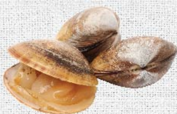
花甲王 Clams 时价 Market Price