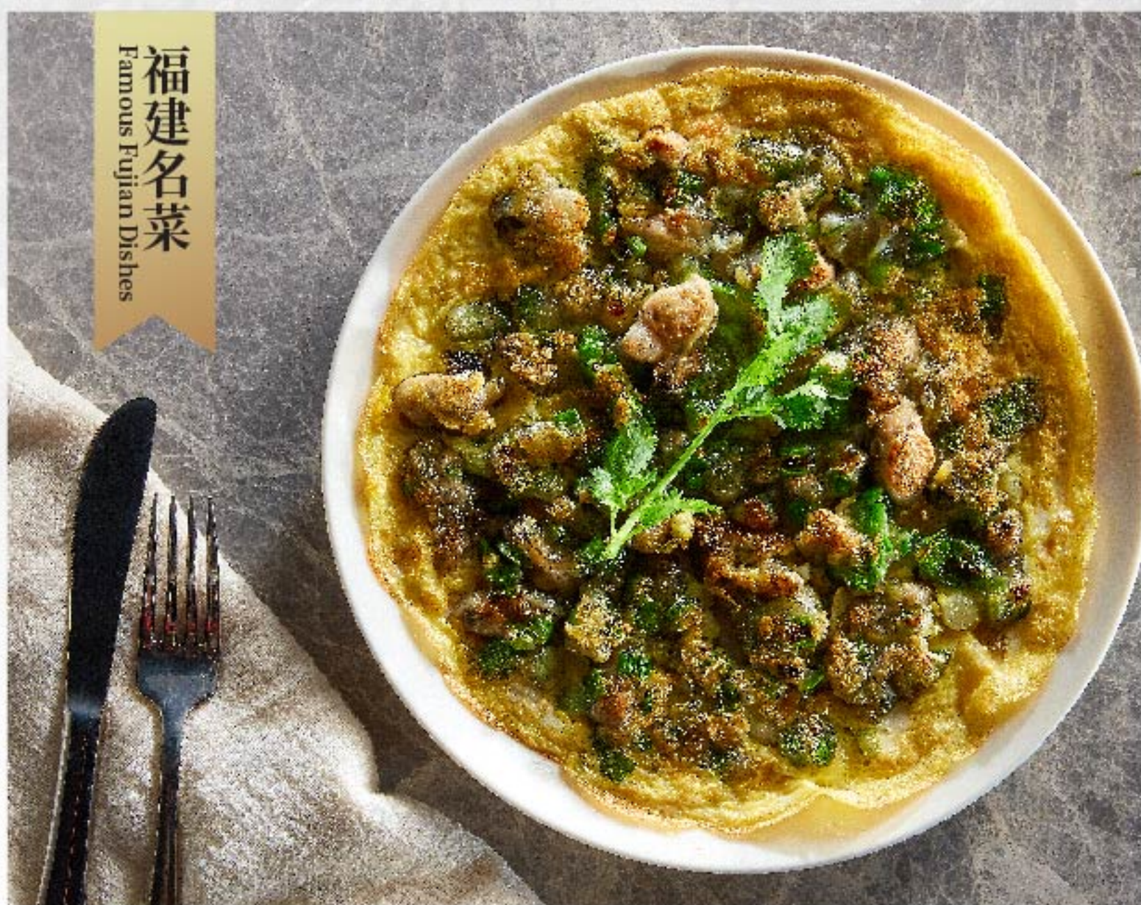
福建特色海蛎煎 Fujian Fried Oyster Omelette