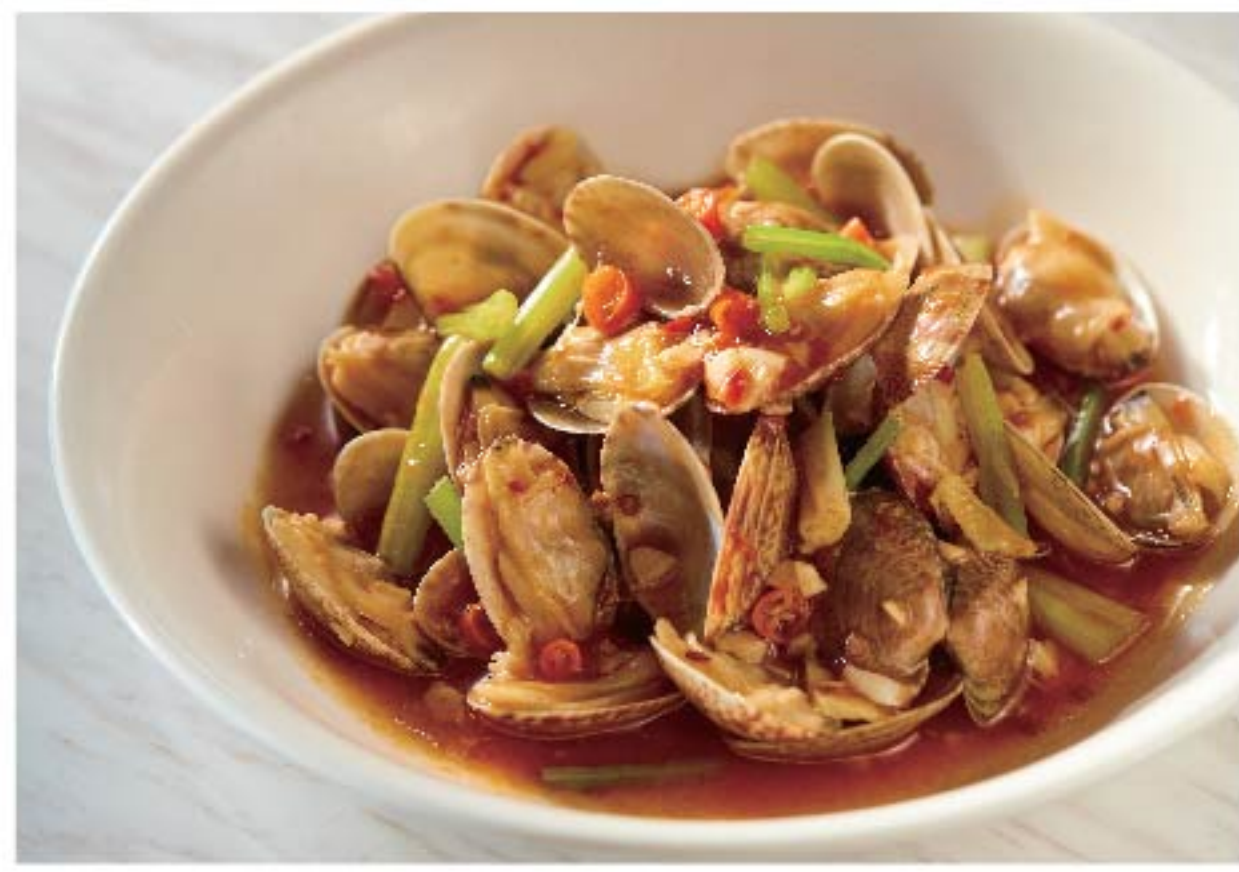
辣汁花蛤 Stir-fried Chilli Clams