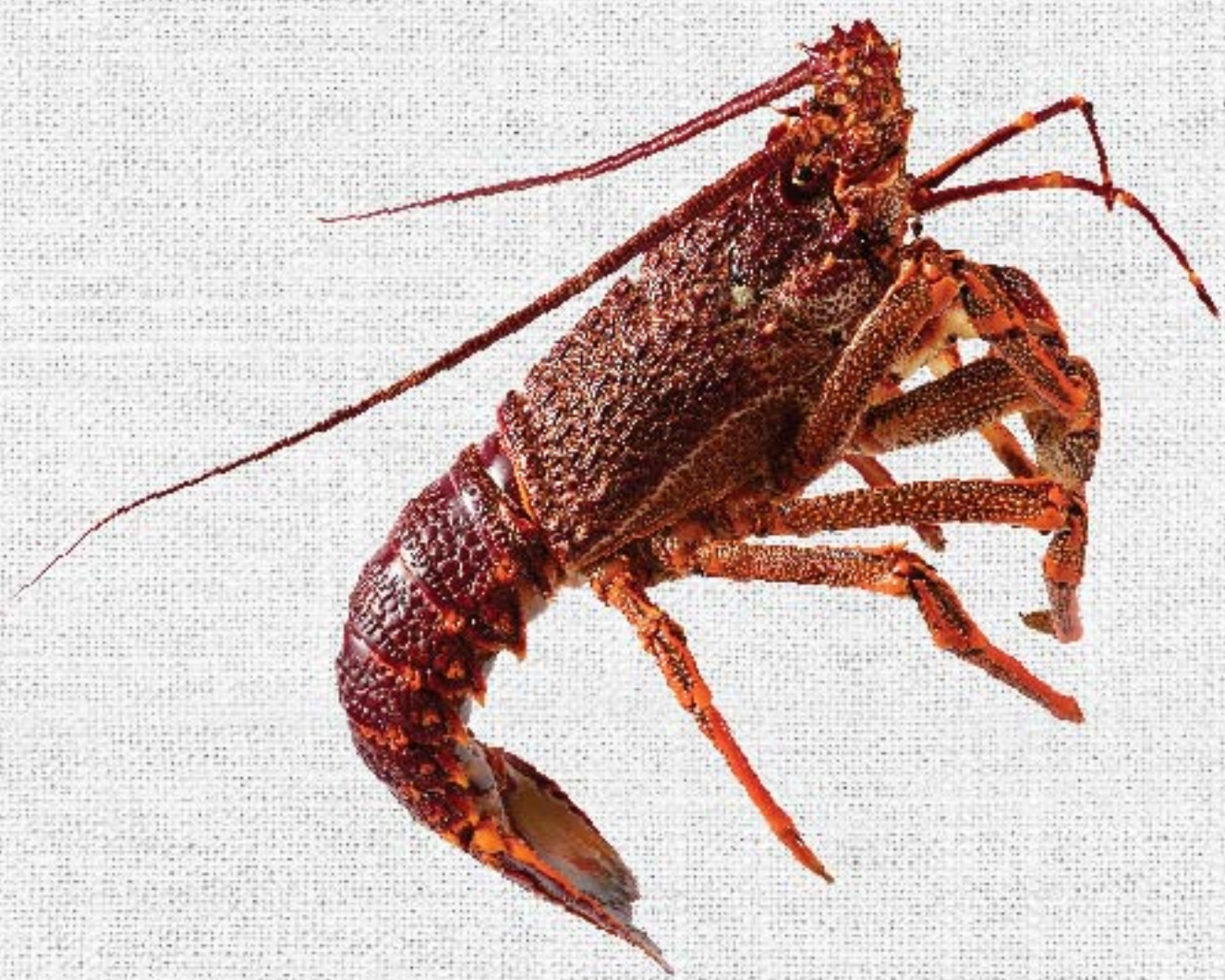
澳洲龙虾 Australian Lobster 时价 Market Price