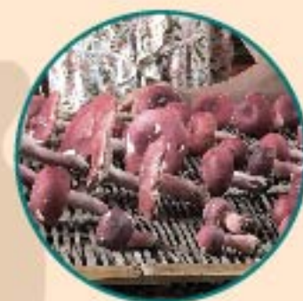
2 福建偏远山区，长汀 红菇 Changting-A Faraway Mountainous District in Fujian Red Mushroom