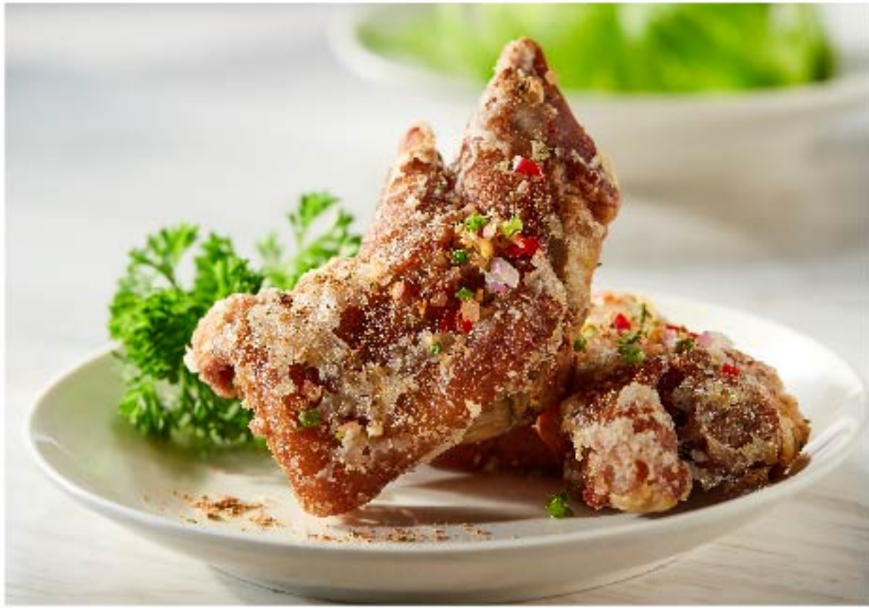
椒盐猪手 Deep-fried Pork Trotters with Salt & Pepper

澳门元 MOP 58 件(pc) 2件起售 (Minimum order 2 pcs)