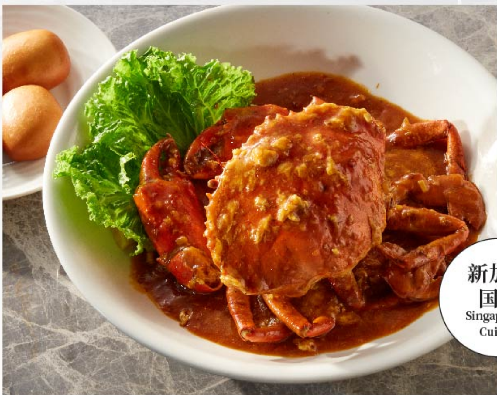
辣椒螃蟹 Chilli Crab