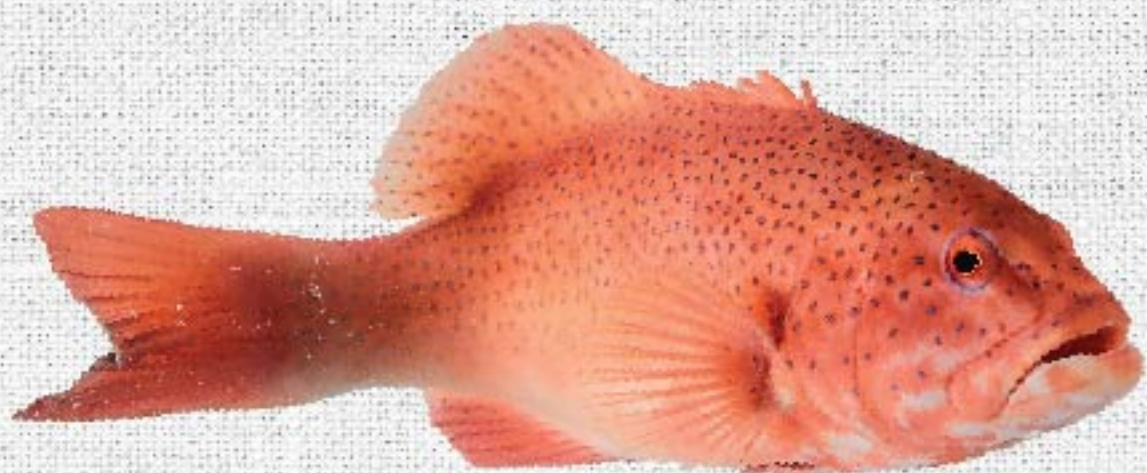
东星斑 Spotted Grouper 时价 Market Price