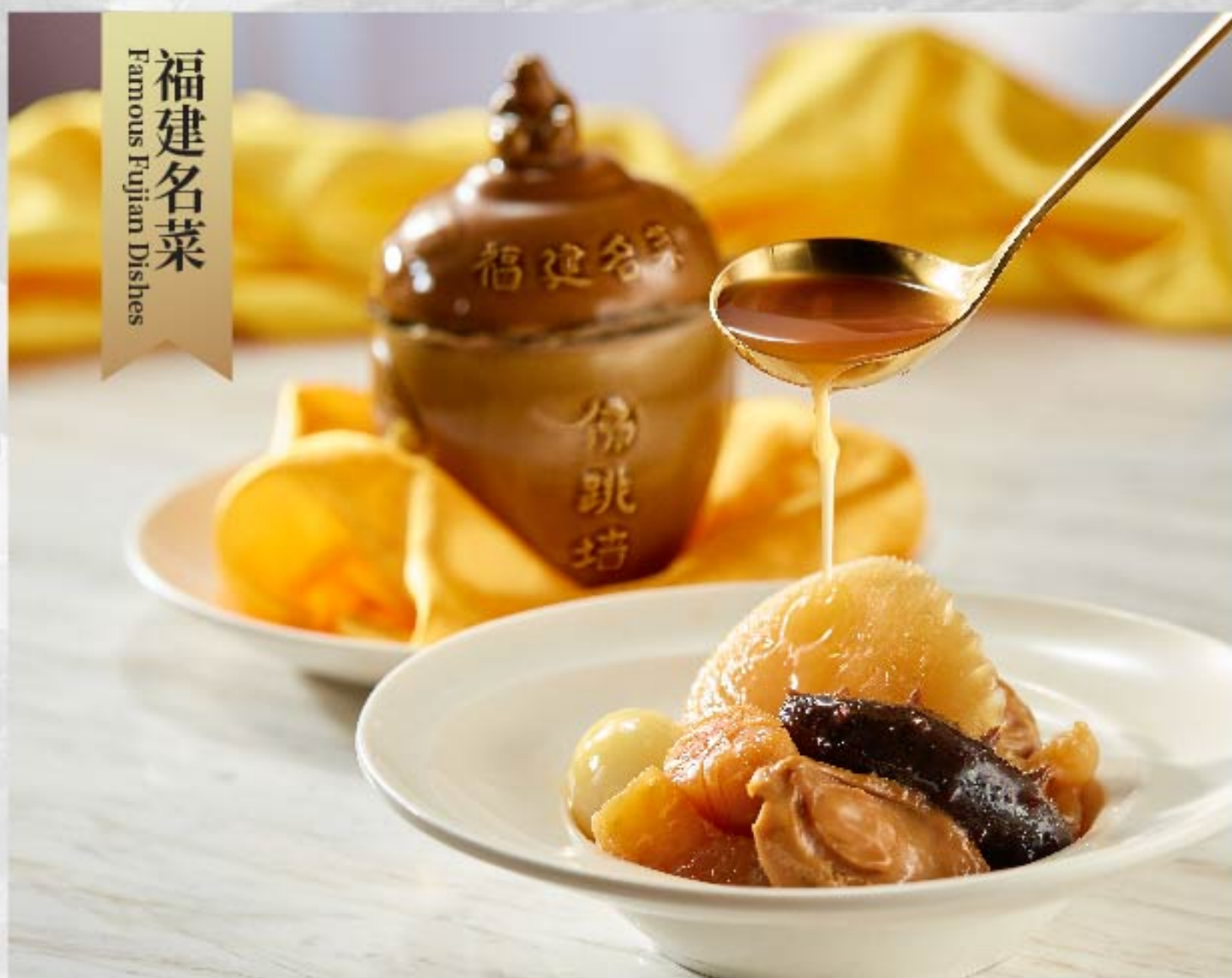
经典佛跳墙 Traditional Buddha Jumps Over the Wall