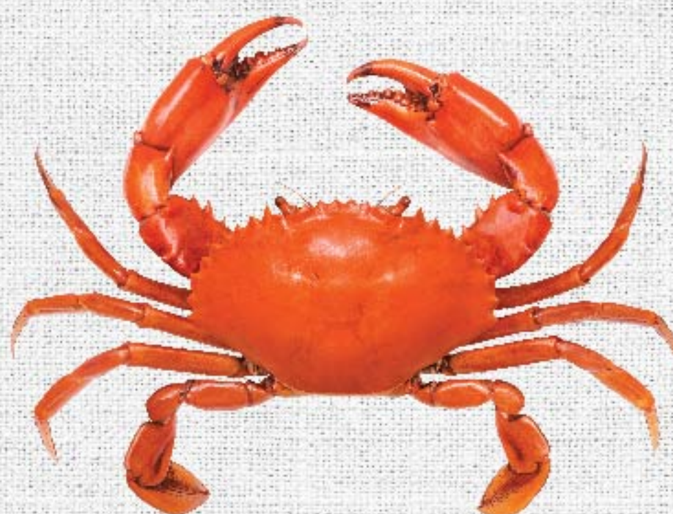
肉蟹 Mud Crab 时价 Market Price