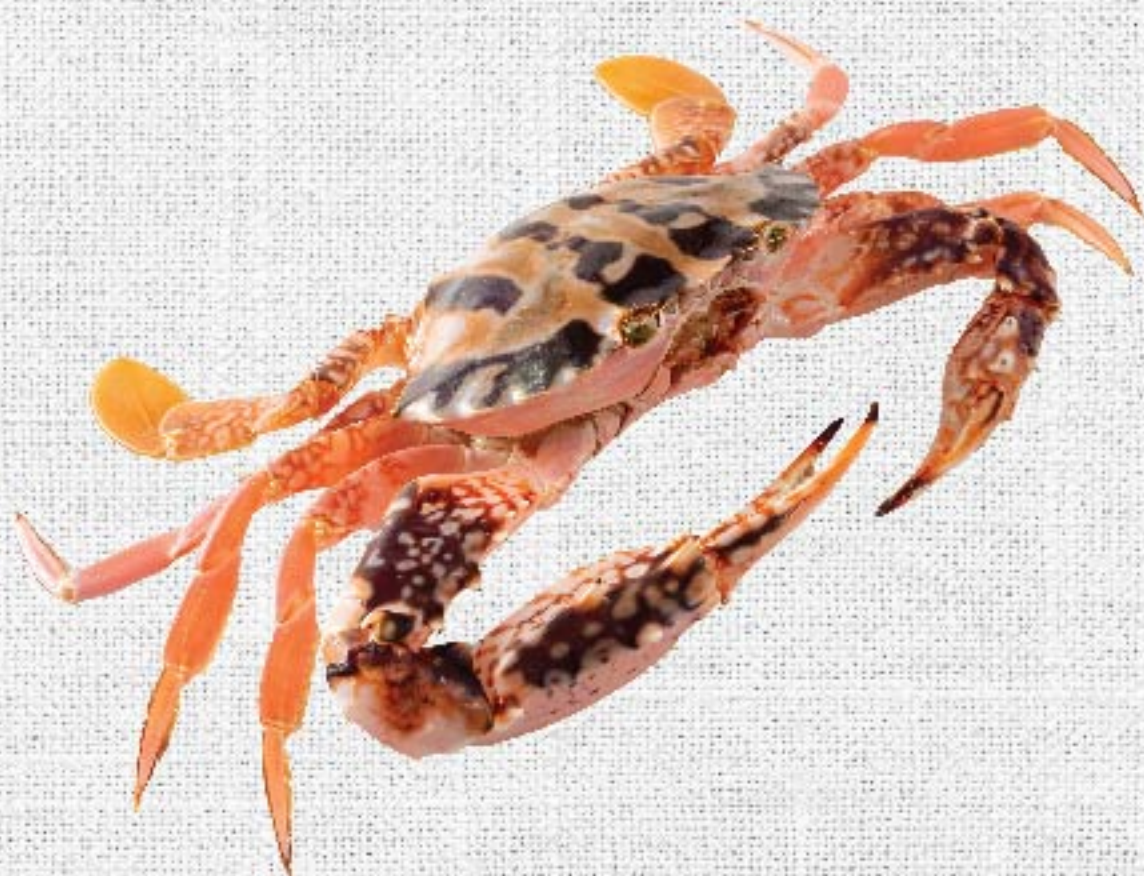
花膏蟹 Flower Crab 时价 Market Price