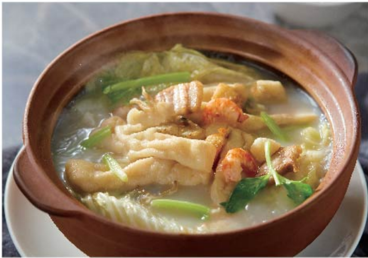
大白菜炖软豆腐 Braised Bean Curd with Chinese Cabbage