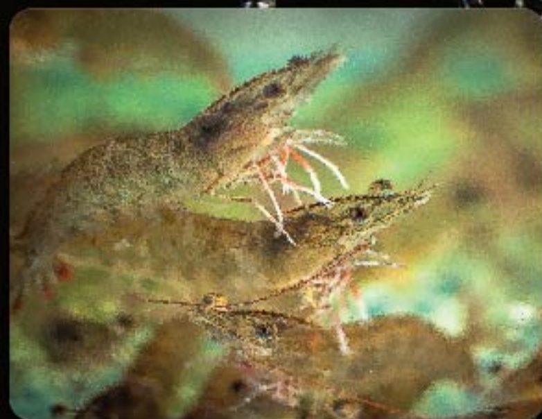
只吃天然海捕小鱼虾长大 Fed only on small fishes and shrimps caught from the sea.