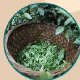
1 武夷山 大红袍 Wu Yi Mountain Da Hong Pao Tea