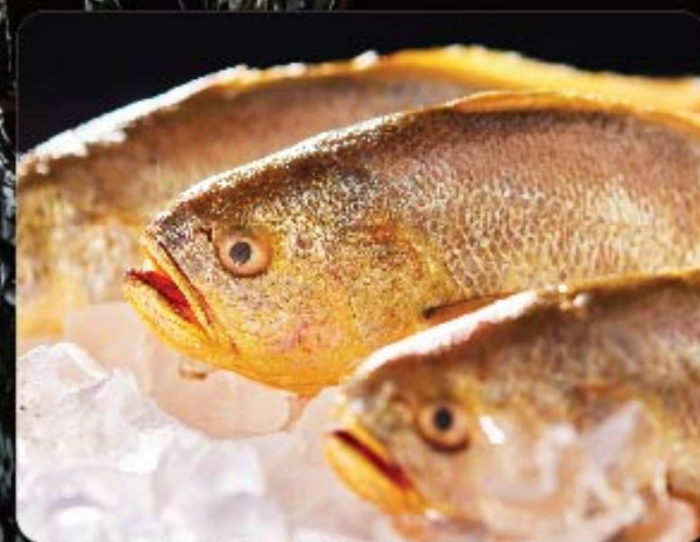
冰鲜到店, 从原产地到餐厅 Chilled and delivered from source to restaurant.