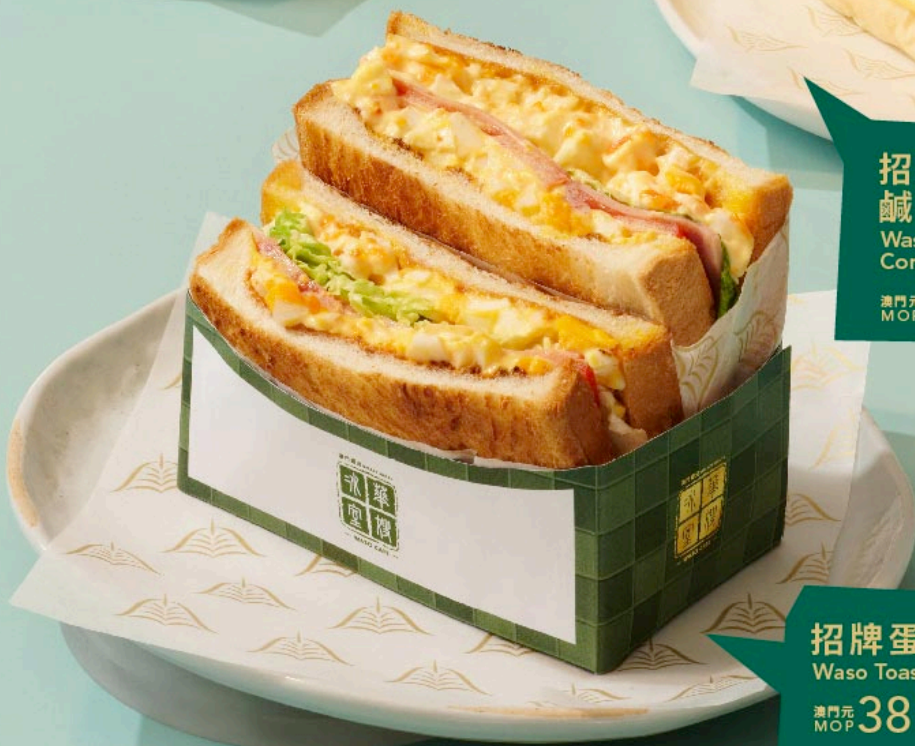
招牌蛋沙律多士 Waso Toast with Egg Salad 澳門元 38 MOP