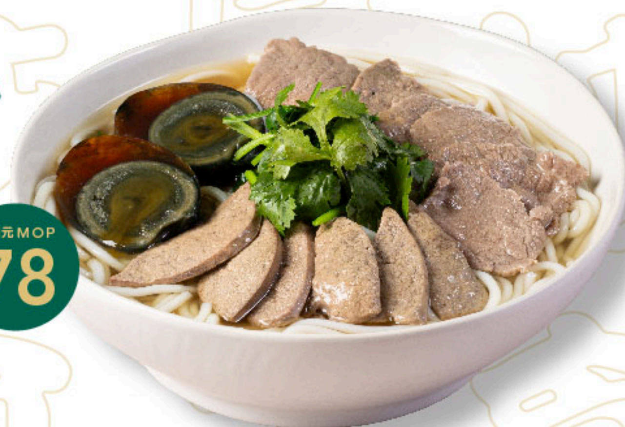
👍 豬潤牛肉皮蛋芫茜米線 Pork Liver and Beef with Rice Noodles in Century Egg and Coriander Soup