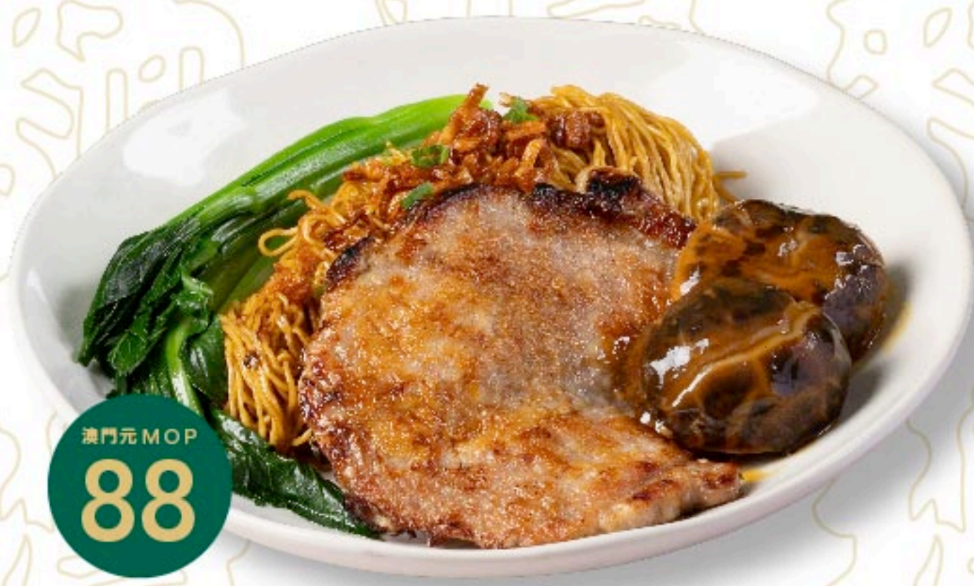
北菇豬扒蔥油撈麵 Tossed Noodles with Pork Chop and Mushroom in Spring Onion Dressing