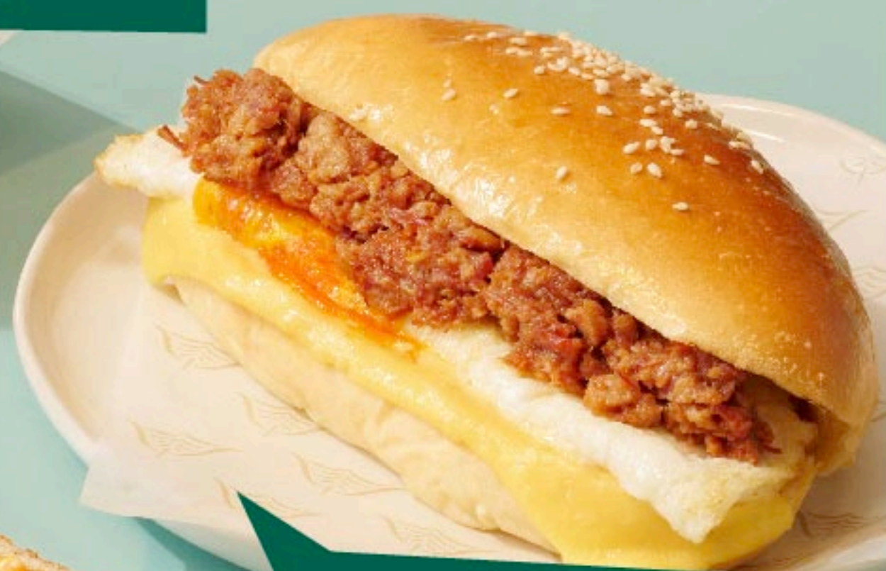
招牌芝士 鹹牛肉蛋軟豬 Waso Soft Bun with Cheese, Corned Beef and Egg 澳門元 38 MOP