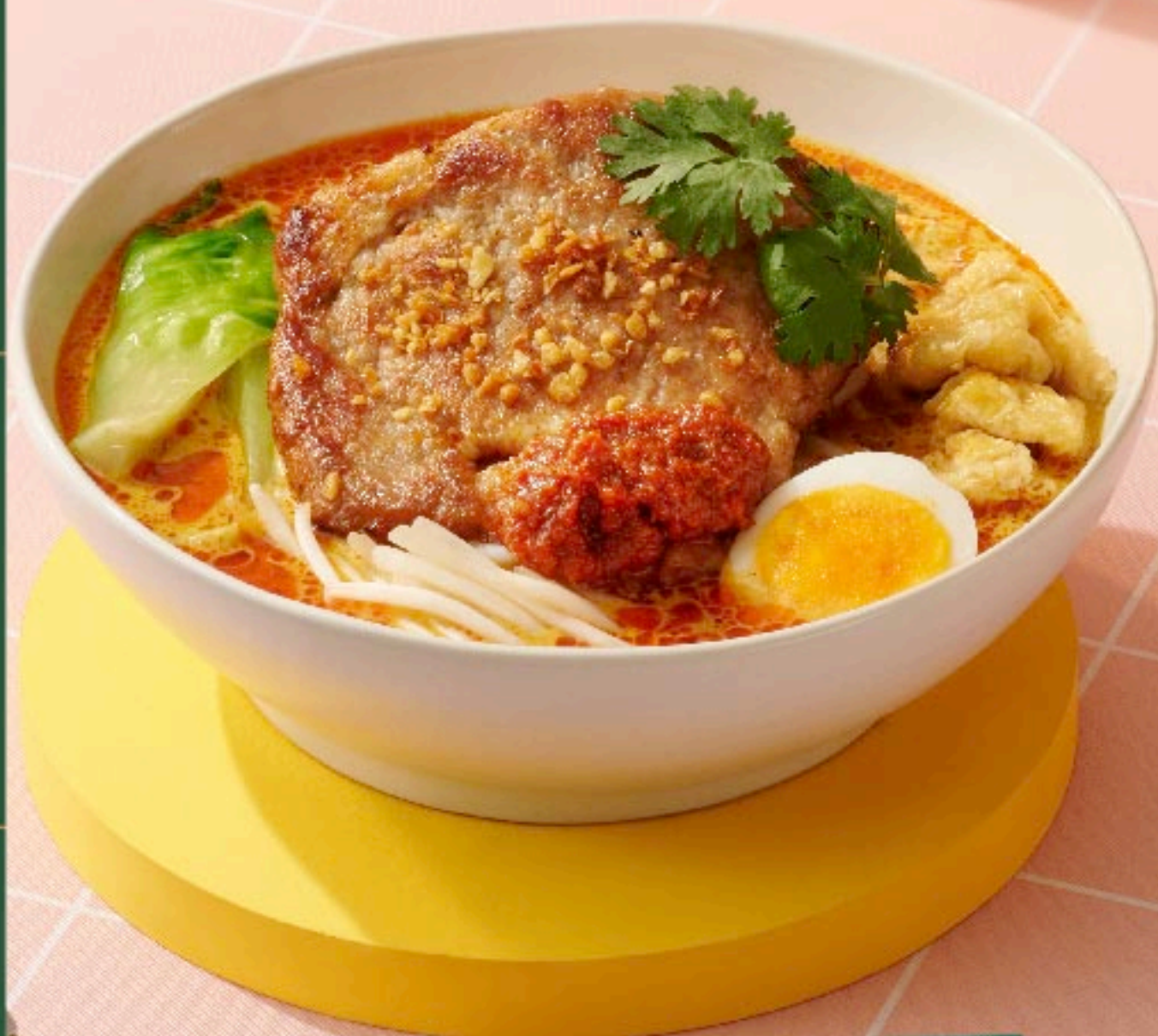
檳城喇沙豬扒米線 Penang Laksa with Pork Chop and Rice Noodles