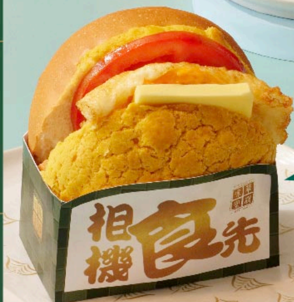
招牌菠蘿包 Waso Pineapple Bun 澳門元 32 MOP