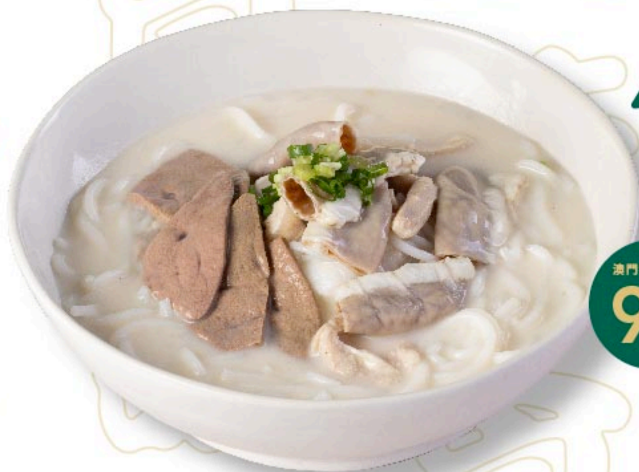
白胡椒豬雜湯麵 Noodles in White Pepper Soup with Pork Offal