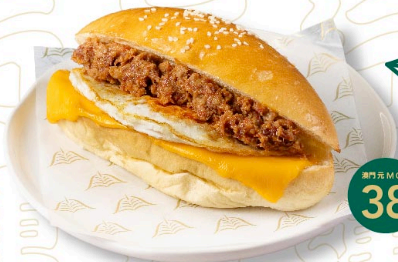
👍 招牌芝士鹹牛肉蛋軟豬 Waso Soft Bun with Cheese, Corned Beef and Egg