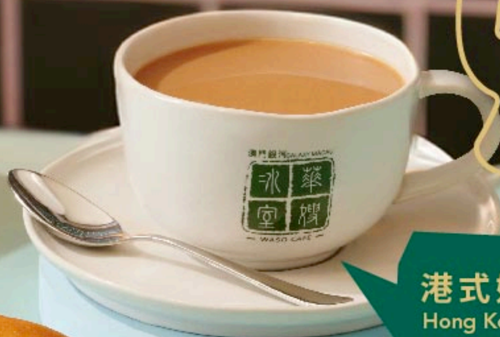
港式奶茶 Hong Kong Style Milk Tea 熱 | 澳門元 25 Hot | MOP 凍 | 澳門元 28 Cold | MOP