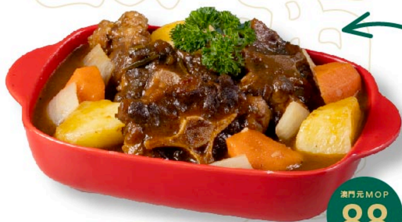
紅酒燴牛尾 Stewed Ox Tail (意粉/白飯) (Spaghetti / Rice)