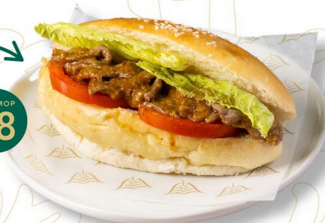
沙嗲牛肉軟豬 Soft Bun with Satay Beef