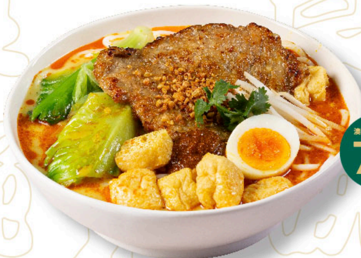
👍 檳城喇沙豬扒米線 Penang Laksa with Pork Chop and Rice Noodles