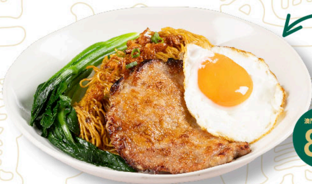
招牌豬扒煎蛋蔥油撈麵 Tossed Noodles with Pork Chop and Egg in Spring Onion Dressing