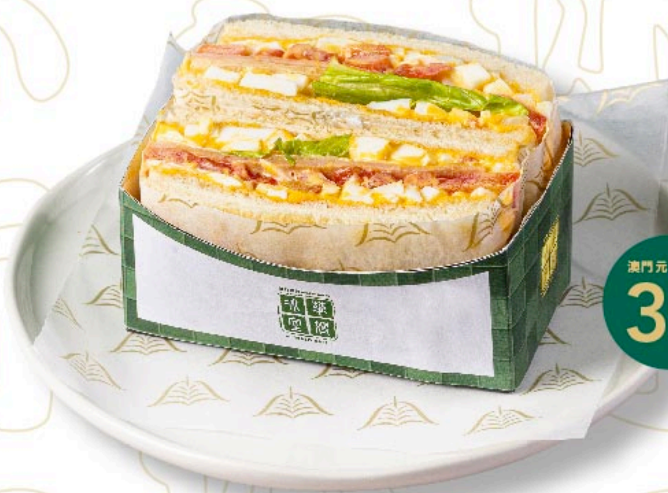
👍 招牌蛋沙律多士 Waso Toast with Egg Salad