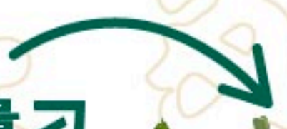
泰式炒貴刁 Pad Thai