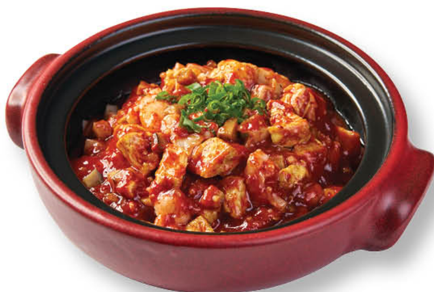
顺德小炒皇 Shunde Style Stir-fried Dried Squid and Chives