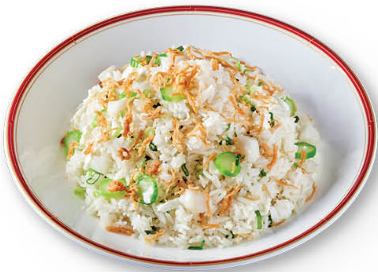
彭庆记炒饭 Pang's Signature Fried Rice