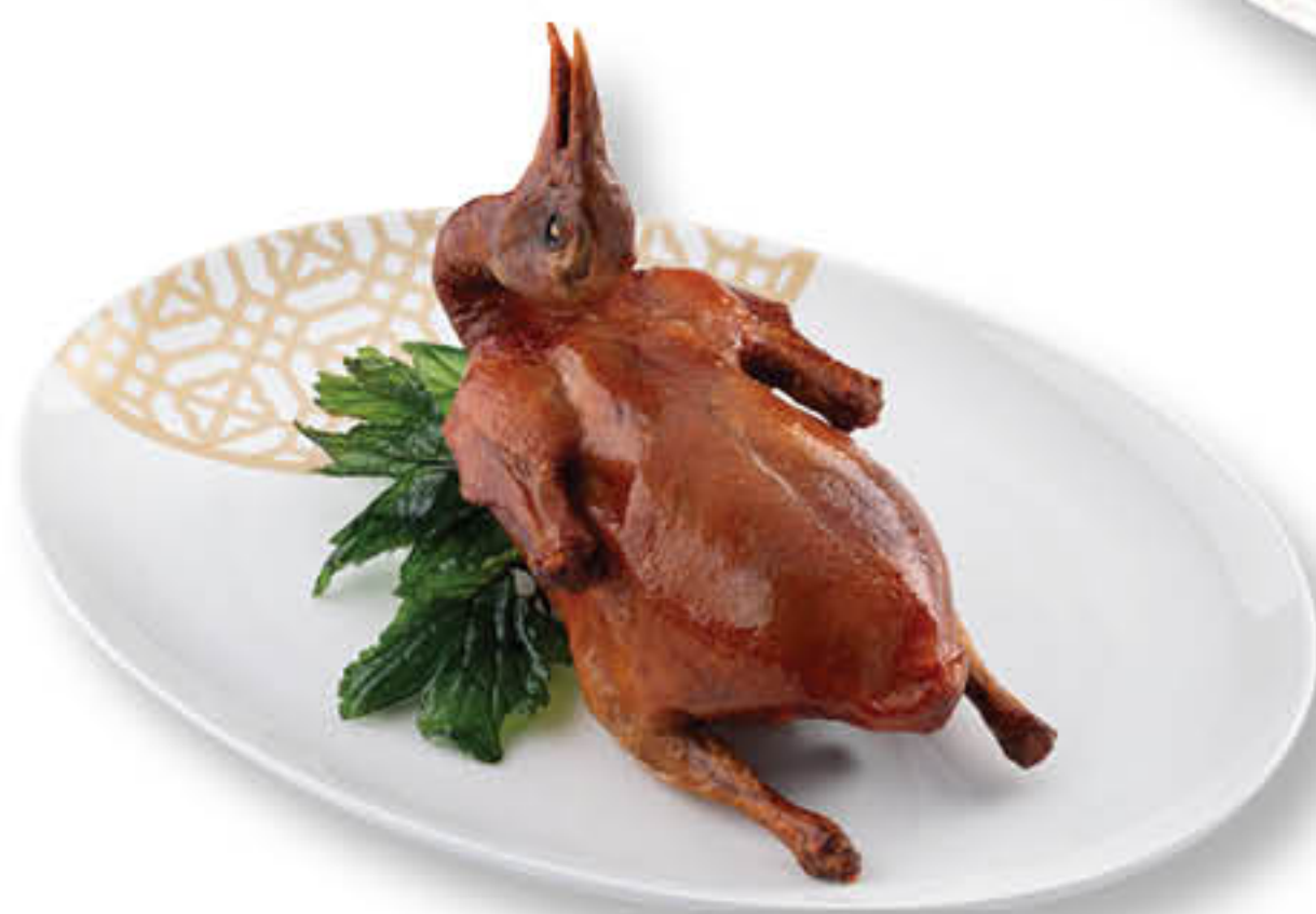
均安头菜猪肚蒸骗鸡 Steamed Chicken with Jun'an Preserved Vegetables