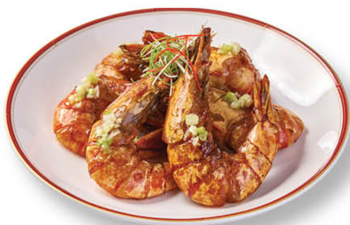
👑 豉油王干煎6头大虎虾 Fried Prawns with Soy Sauce