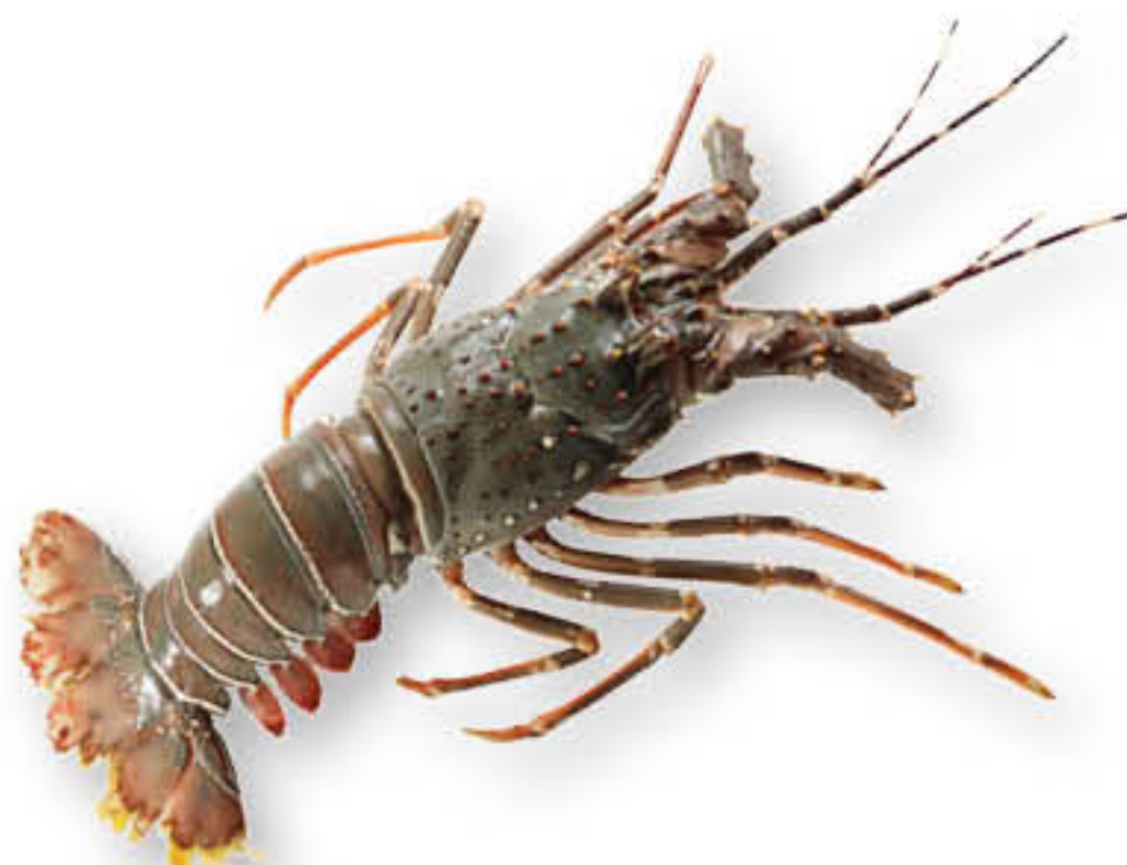
青龙虾 Green Lobster 时价 Market Price