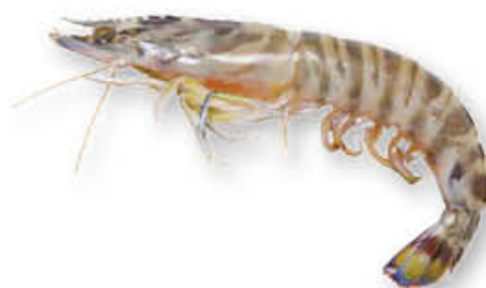
花竹虾 Kuruma Prawn 时价 Market Price

(清蒸 / 枝竹烩 / 芝士焗 / 姜葱炒 / 豉汁凉瓜烩 / 西兰花或菜心炒球 / 川麻 / 水煮 / 酸菜) (Steamed / Braised with Bean Curd Sticks / Baked with Cheese / Fried with Ginger and Spring Onion / Braised with Bitter Melon / Fried with Broccoli or Choy Sum / Fried with Sichuan Spices / Poached in Sichuan Chili Broth / Braised with Pickled Vegetables)