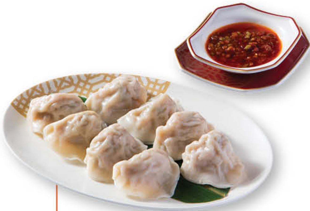
北方饺子 Poached Pork Dumplings