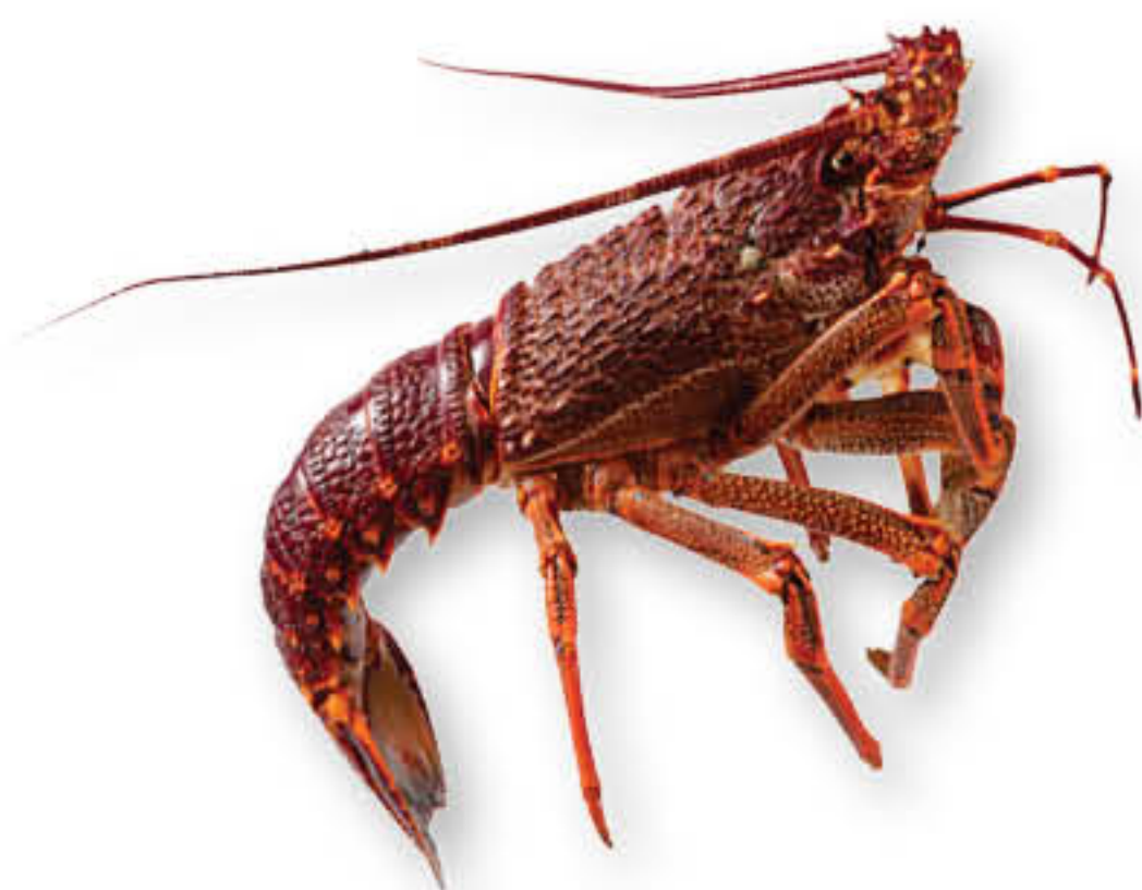
澳洲龙虾 Australian Lobster 时价 Market Price