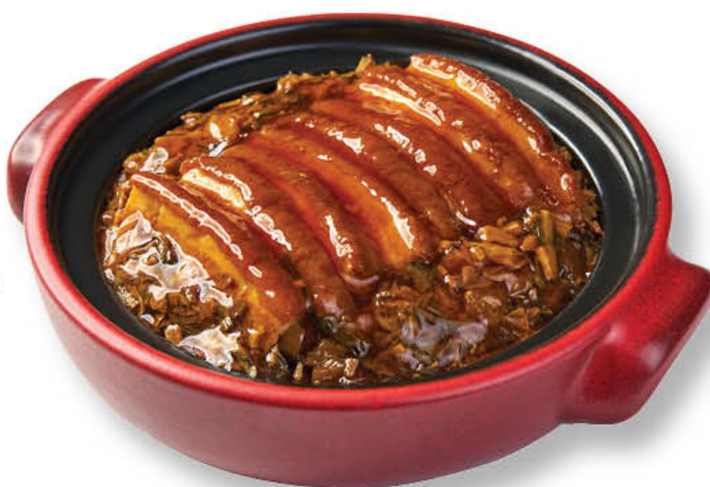
梅菜扣肉煲 Braised Pork Belly with Preserved Vegetables in Clay Pot