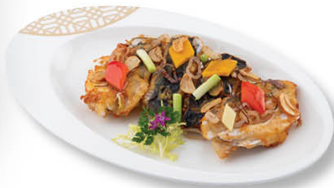
煎焗鱼嘴 Wok-fried Fish Jaw