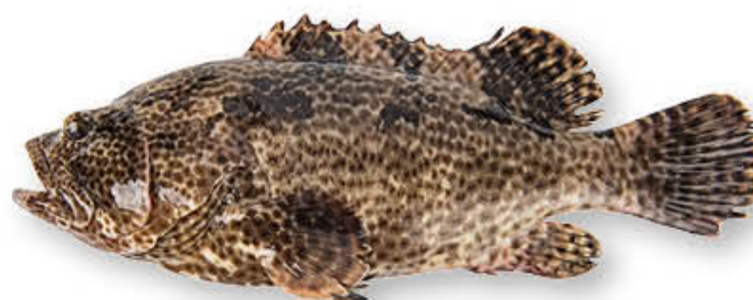
老虎斑 Spotted Tiger Grouper 时价 Market Price