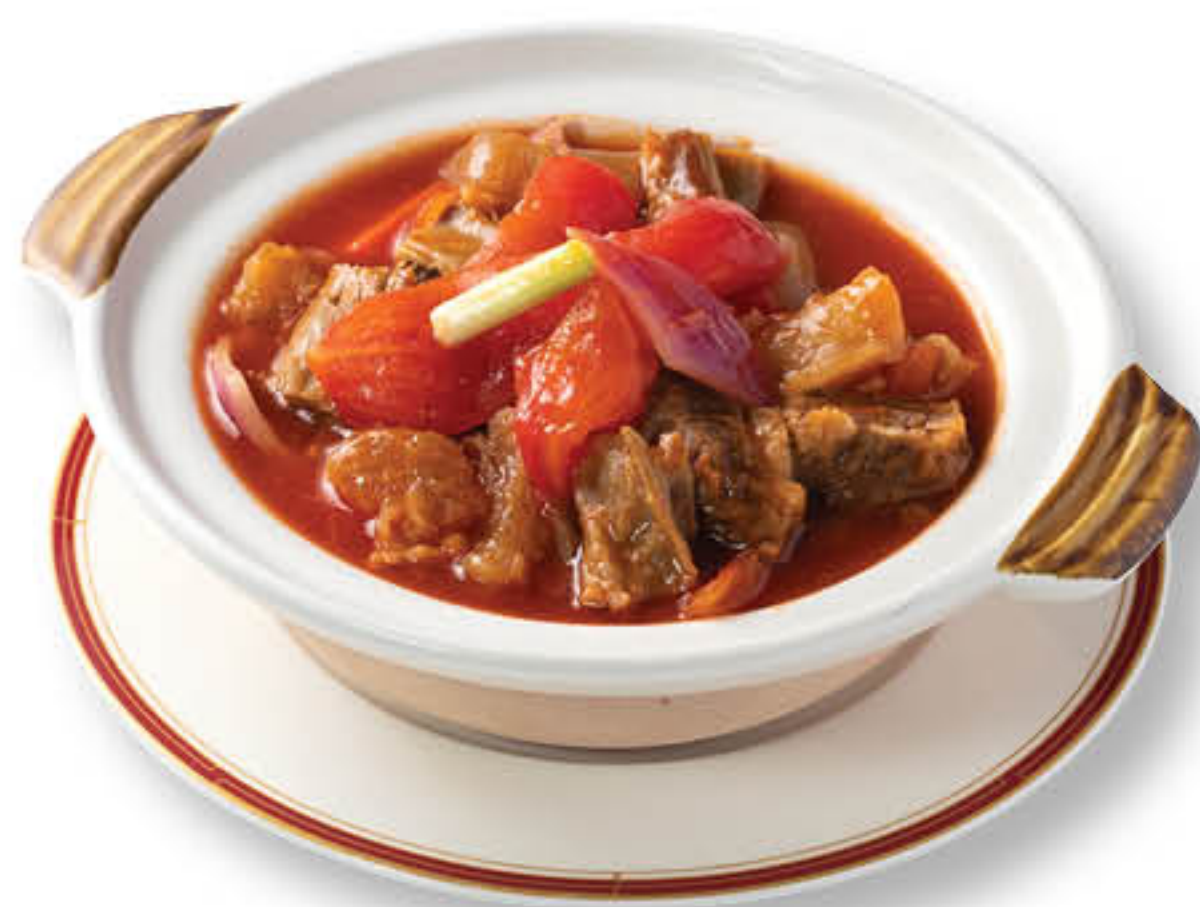
番茄炆牛筋腩 Braised Beef Brisket in Tomato Sauce