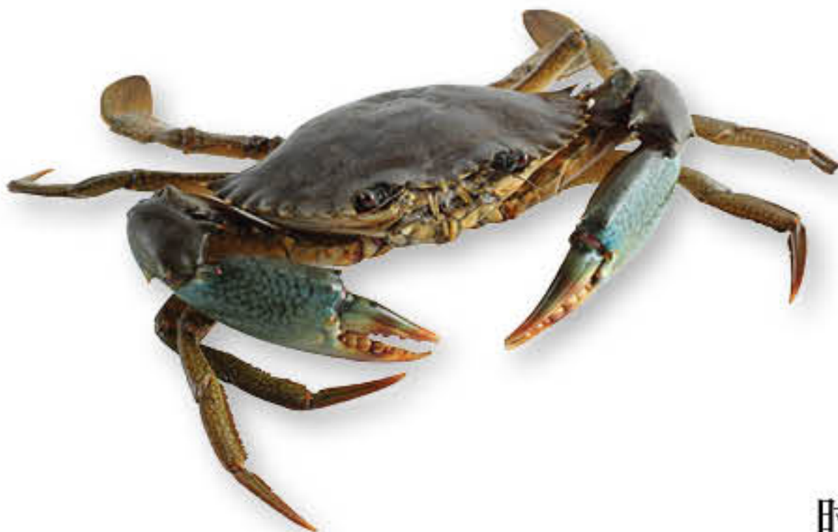
膏蟹 Green Crab (姜葱炒 / 豉椒炒 / 陈皮蒸 / 蛋白蒸) (Fried with Ginger and Spring Onion / Fried with Chili / Steamed with Aged Mandarin Peel / Steamed with Egg Whites)