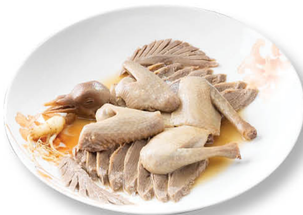
红烧妙龄乳鸽 Deep-fried Baby Pigeon