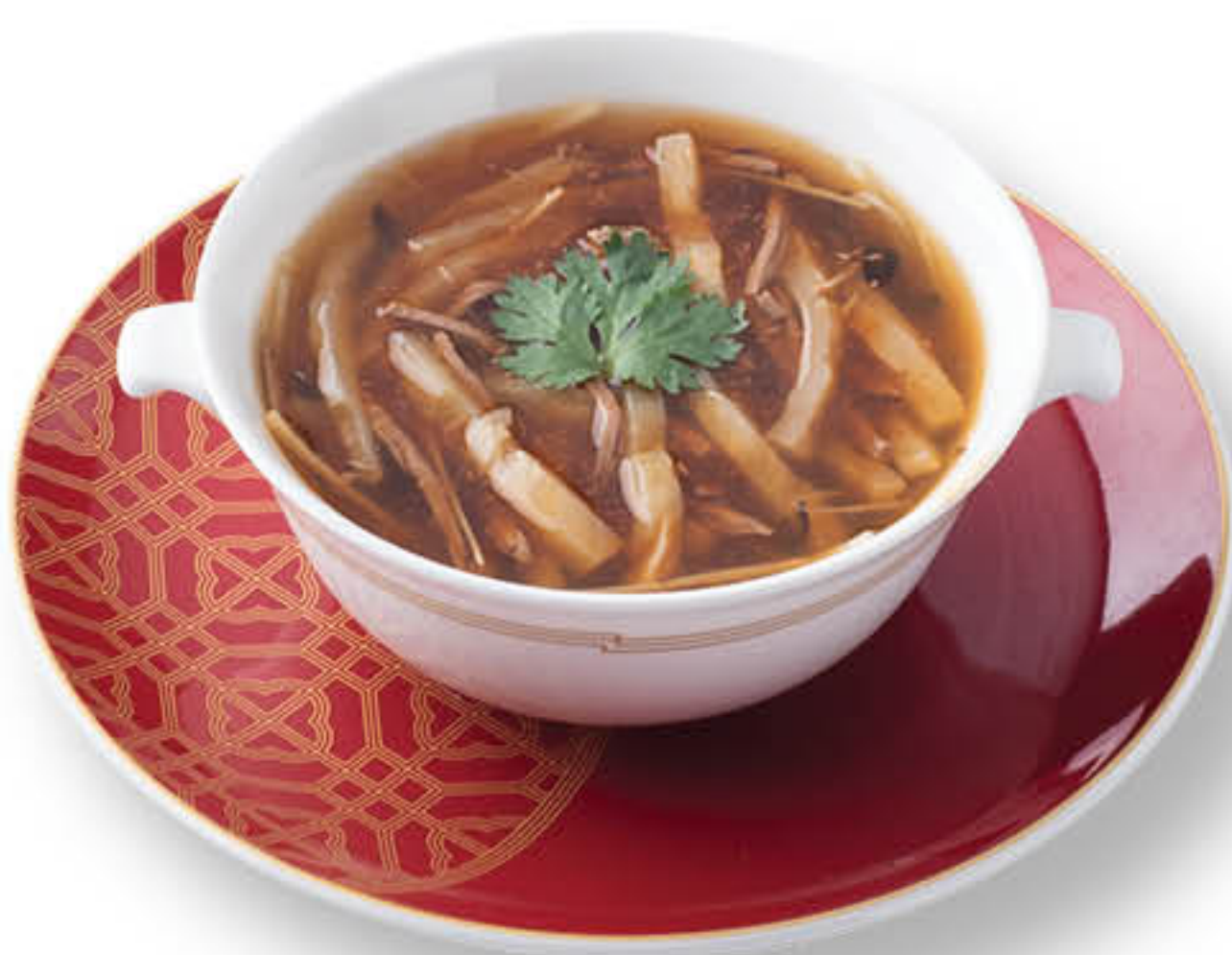
花胶鹧鸪羹 Partridge and Fish Maw Soup