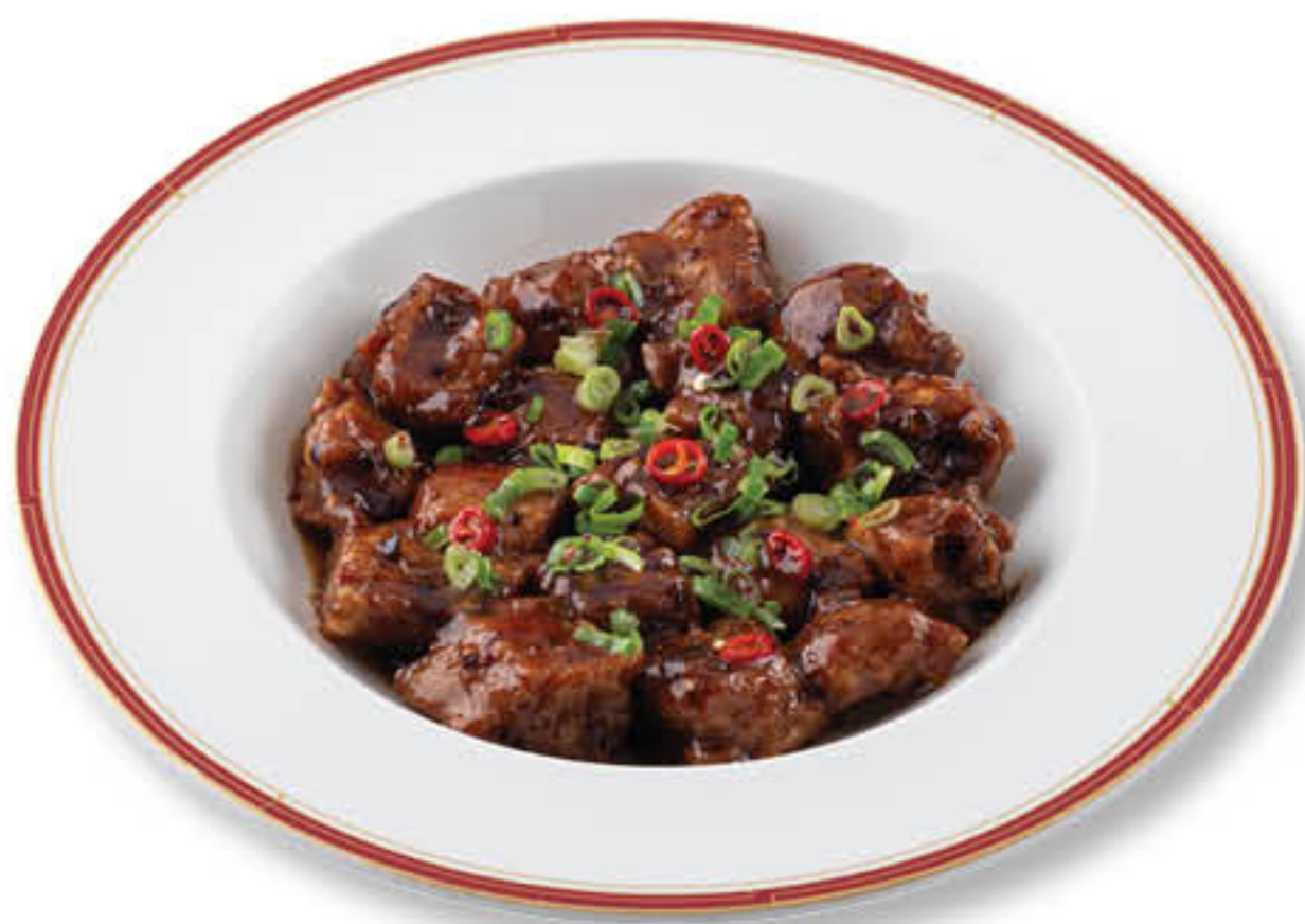
顺德辣椒饼蒸肉排 Steamed Pork Spare Ribs with Shunde Chili and Black Bean Cake