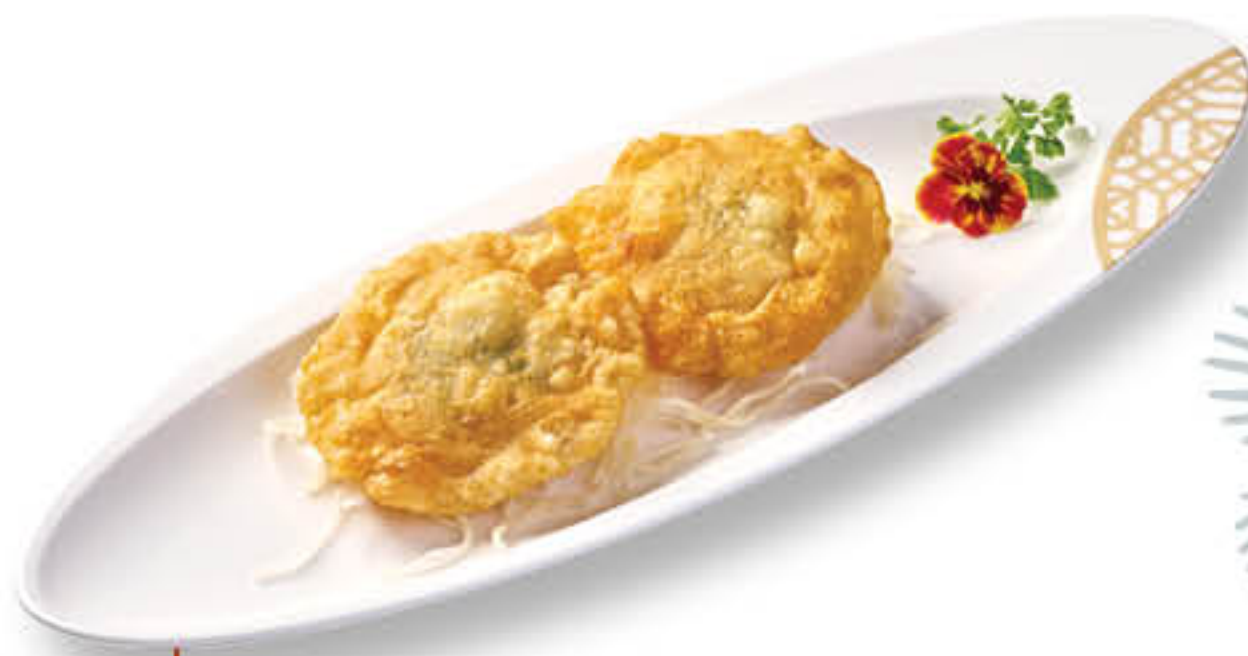
顺德金錢蟹盒 (兩件起) Deep-fried Crispy Crab Puffs Minced Pork and Crab Meat in Shunde Style (min. 2 pcs)