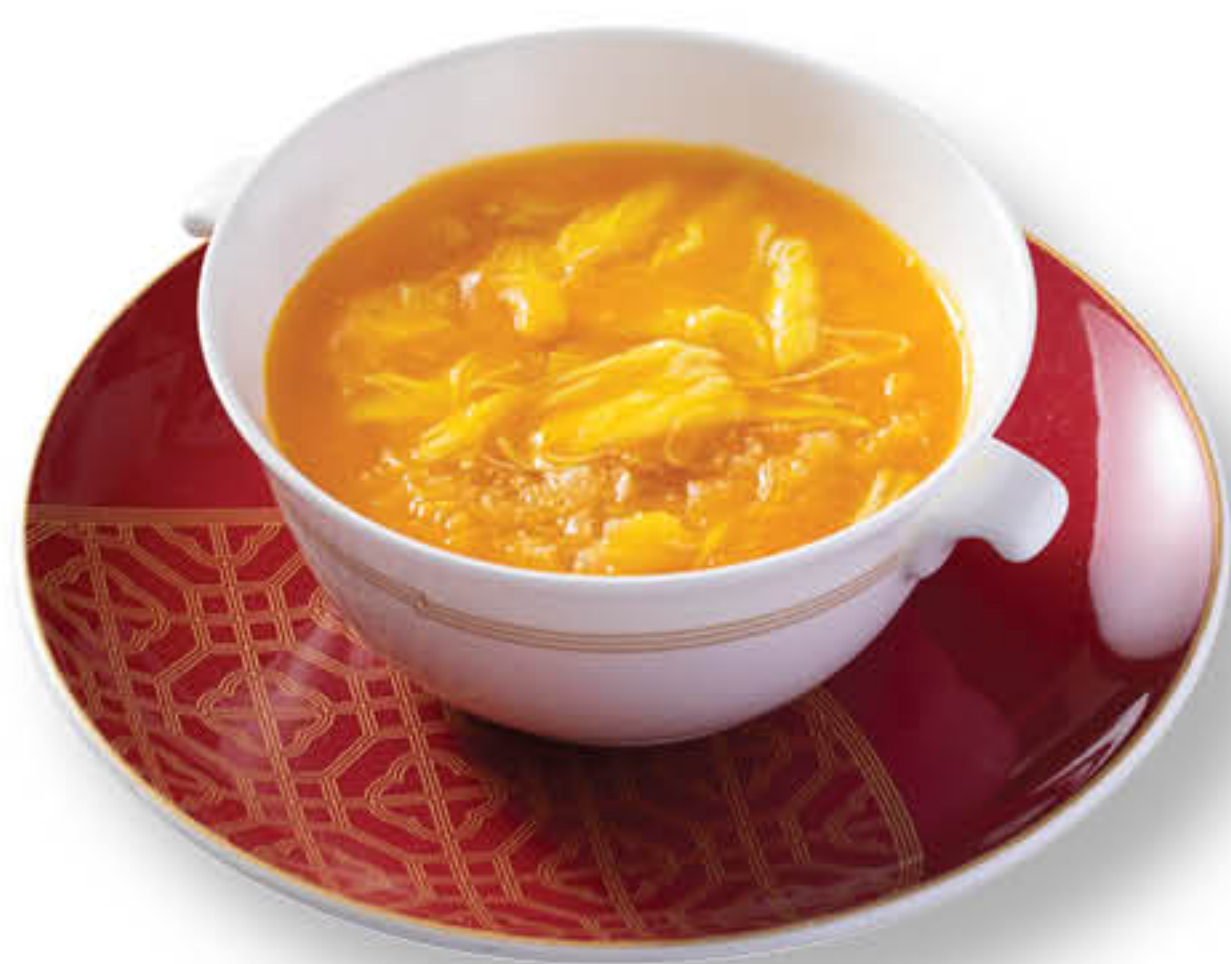
蟹肉南瓜羹 Crab Meat and Pumpkin Soup