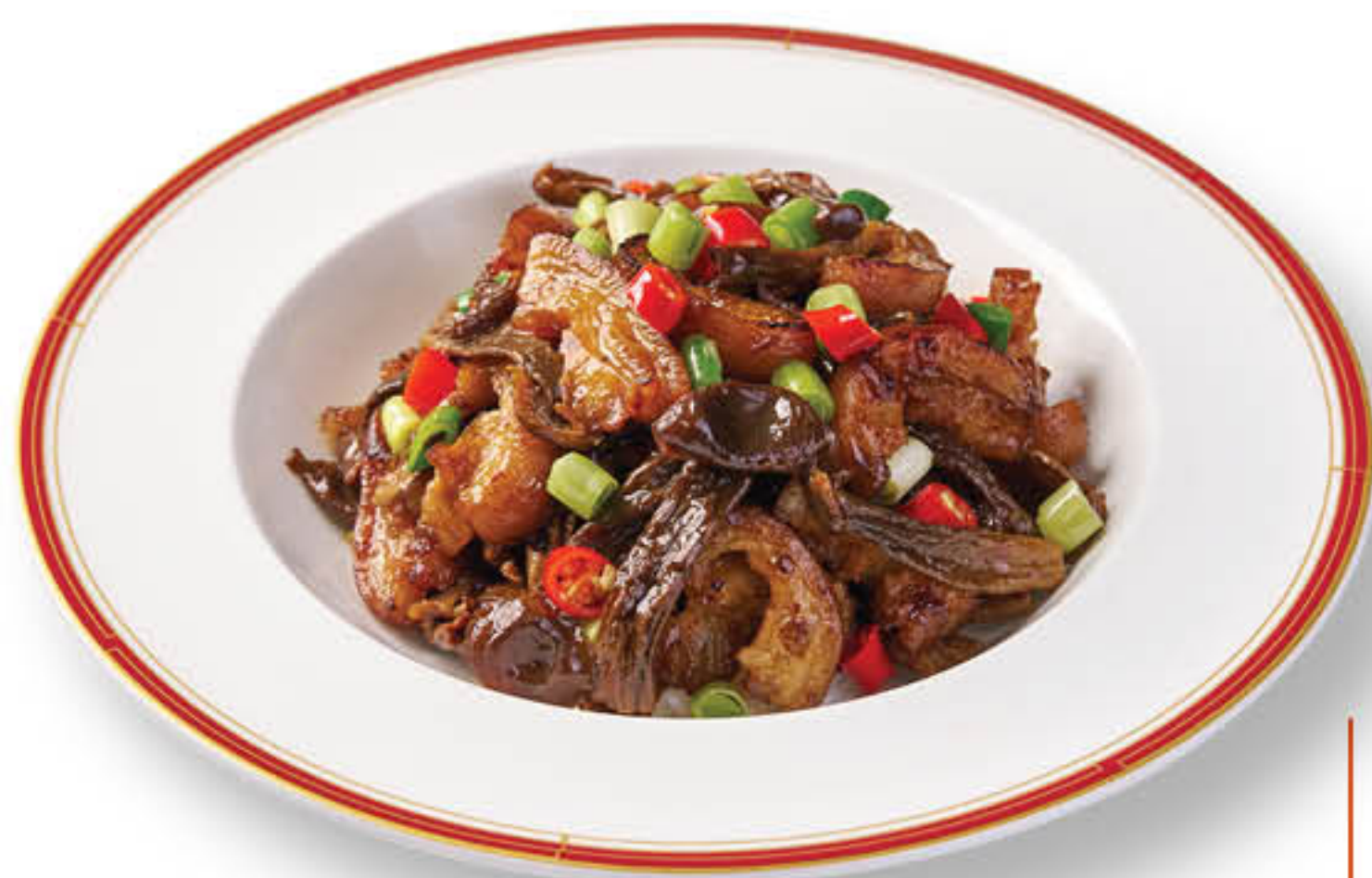
鹿茸菌炒去骨蹄花肉 Stir-Fried Pork Knuckle meat with Cumin