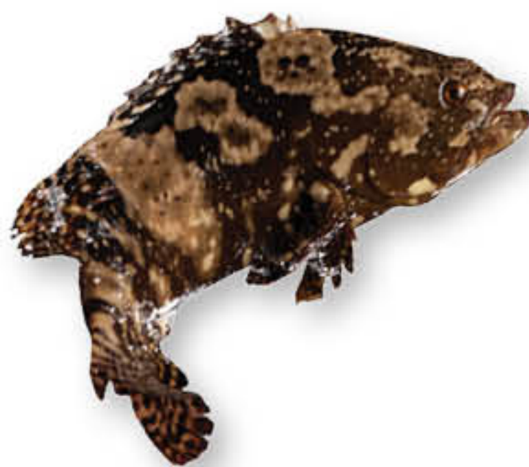
沙巴龙趸(细条 / 大条) Sabah Giant Grouper (Small / Large) 时价 Market Price