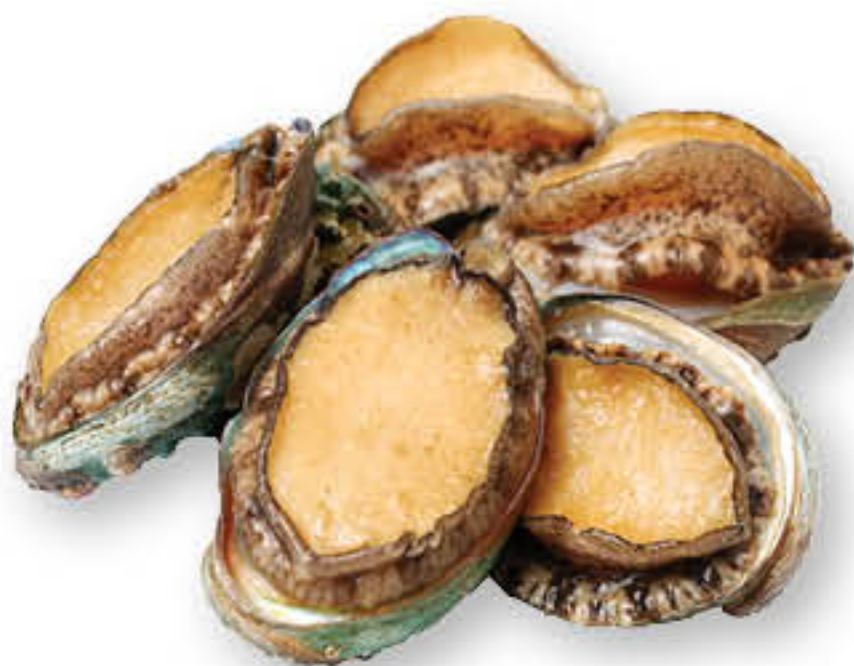
鲜鲍鱼(2只起) Fresh Abalone (min. 2 pcs per order) (蒜蓉粉丝蒸 / 豉汁粉丝蒸 / 辣蒜蒸) (Steamed with Garlic and Vermicelli / Steamed with Black Bean Sauce and Vermicelli / Steamed with Garlic and Chili Sauce)