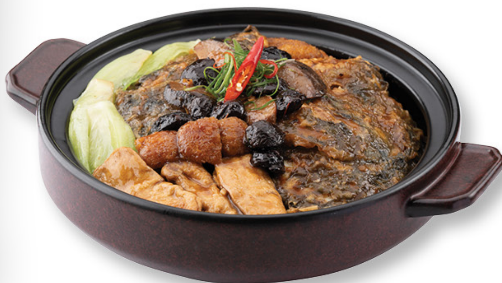
红烧黑蒜水库鱼头煲 Clay Pot Braised Fish Head with Black Garlic