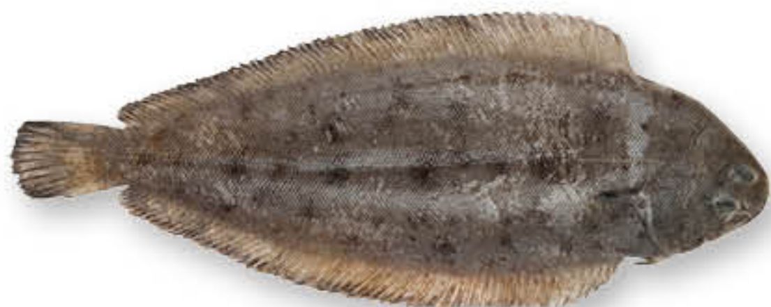
金边方利 Fresh Sole (清蒸 Steamed)