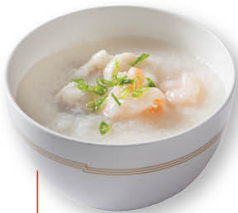
海皇靚粥 Seafood Congee