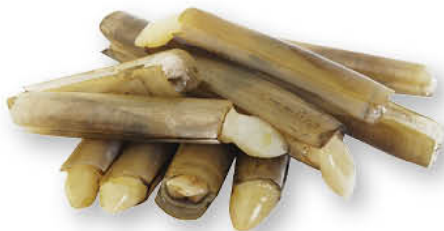
苏格兰大蛏子皇(2只起) Giant Scottish Razor Clam (min. 2 pcs per order) (蒜蓉粉丝蒸 / 豉汁粉丝蒸 / XO酱) (Steamed with Garlic and Vermicelli / Steamed with Black Bean Sauce and Vermicelli / Sautéed in XO Sauce)