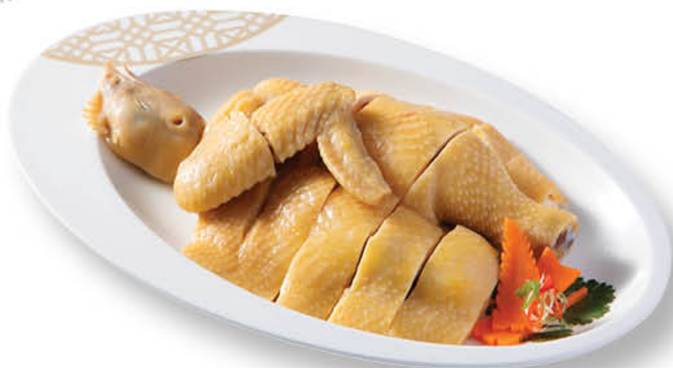
瑶柱贵妃鸡 Poached Chicken with Dried Scallop

半只 Half 澳门元 MOP 198 一只 Whole 澳门元 MOP 388