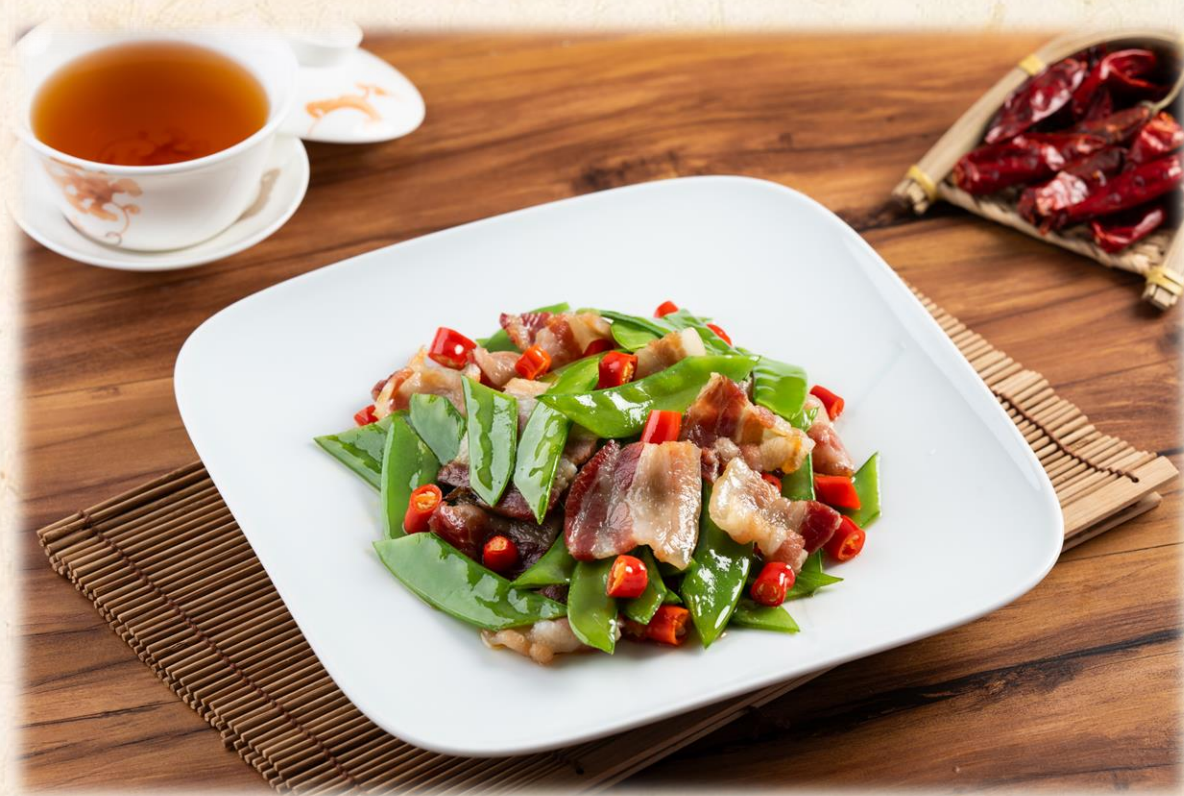
荷兰豆炒四川腊肉 澳门元 MOP 168 Stir-fried Sichuan Preserved Meat with Snow Pea