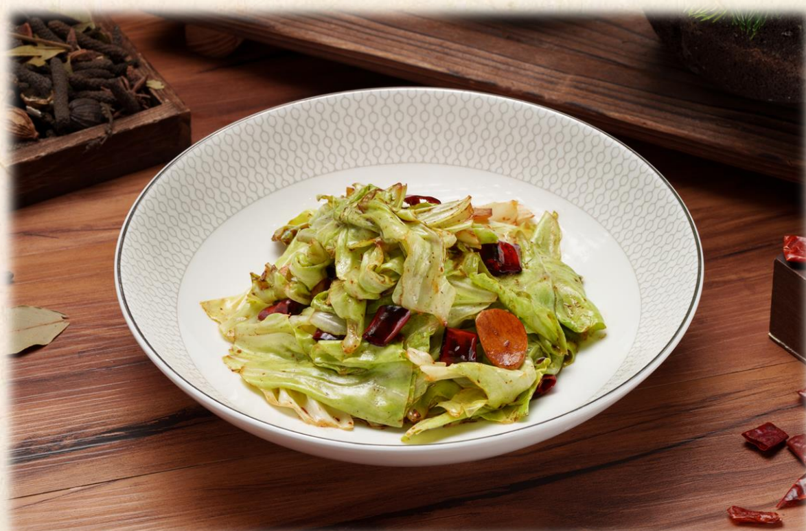
炆炒牛心包菜 Wok-fried Cabbage with Dried Chili 澳门元 88 MOP