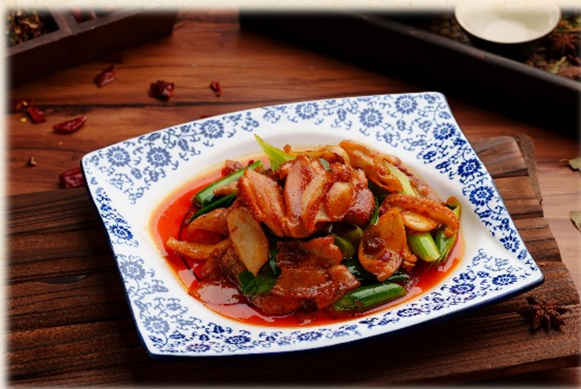
四川鲍鱼回锅肉 澳门元 MOP 168 Stir-fried Sliced Pork with Abalone and Chili Paste