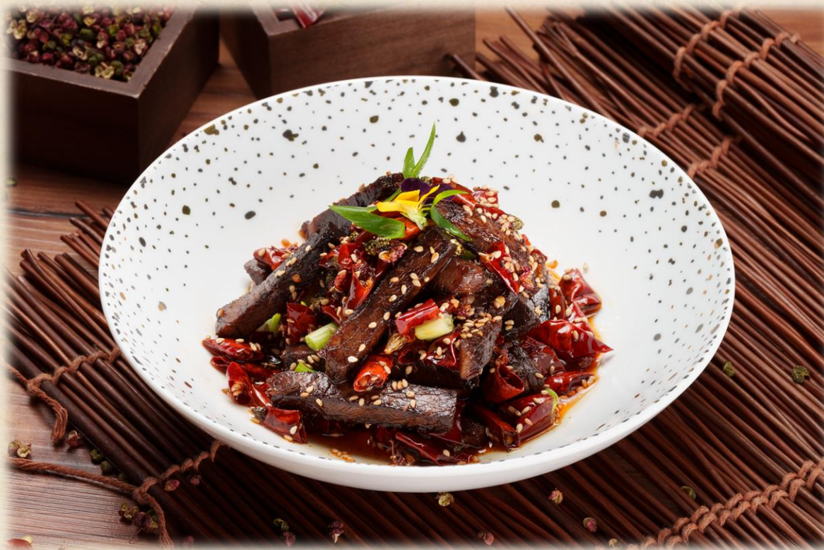
歌乐山麻辣牛肉干 Marinated Beef with Dried Chili