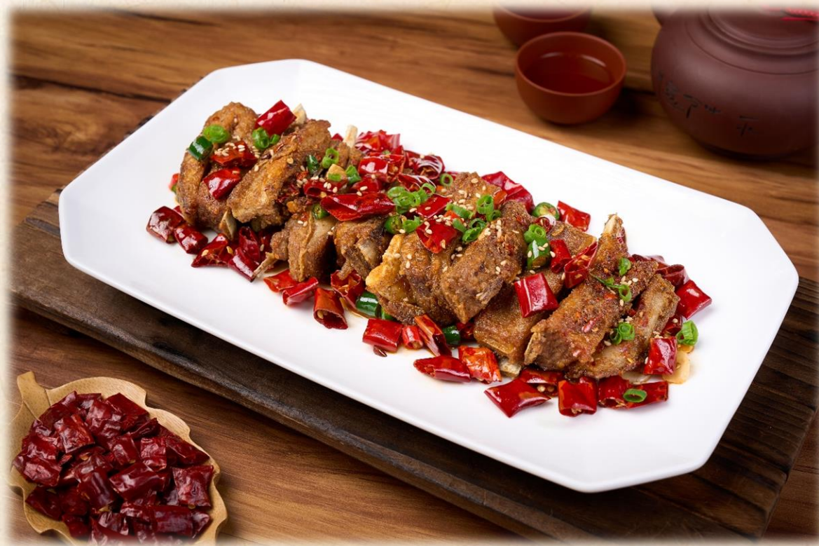
孜香麻辣羊小排 (四件) 澳门元 MOP 268 Stir-fried Lamb Short Ribs with Cumin and Chili (4pcs)