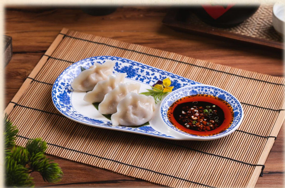
成都钟水饺 Boiled Pork Dumplings in Chili Broth