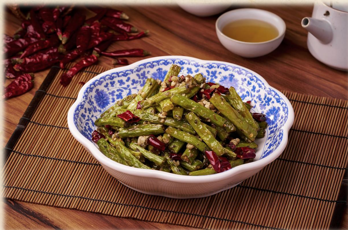
干煸四季豆 Wok-fried String Beans with Minced Pork and Chili 澳门元 88 MOP