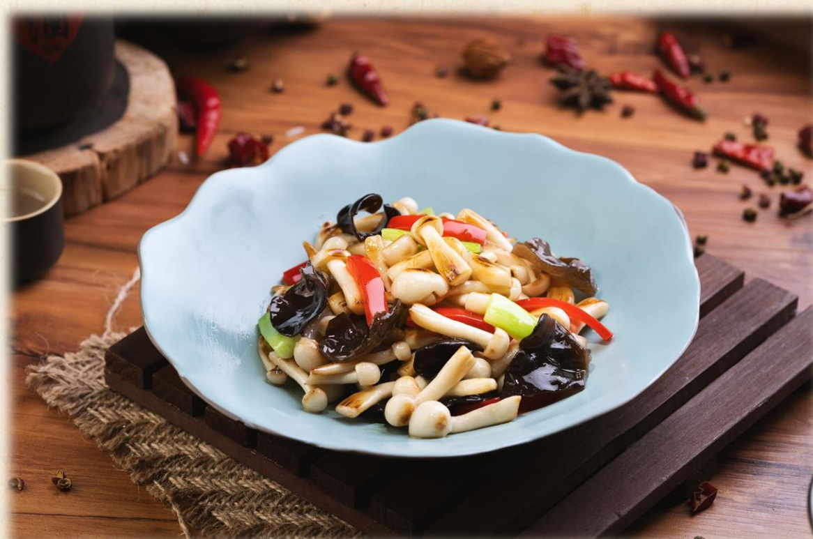
拍蒜炒白玉菇 Stir-fried White Beech Mushrooms with Garlic 澳门元 88 MOP