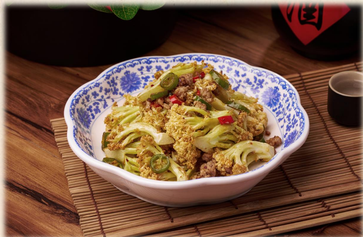
酱爆有机菜花 Stir-fried Organic Cauliflower with Pork and Chili Bean Paste 澳门元 88 MOP