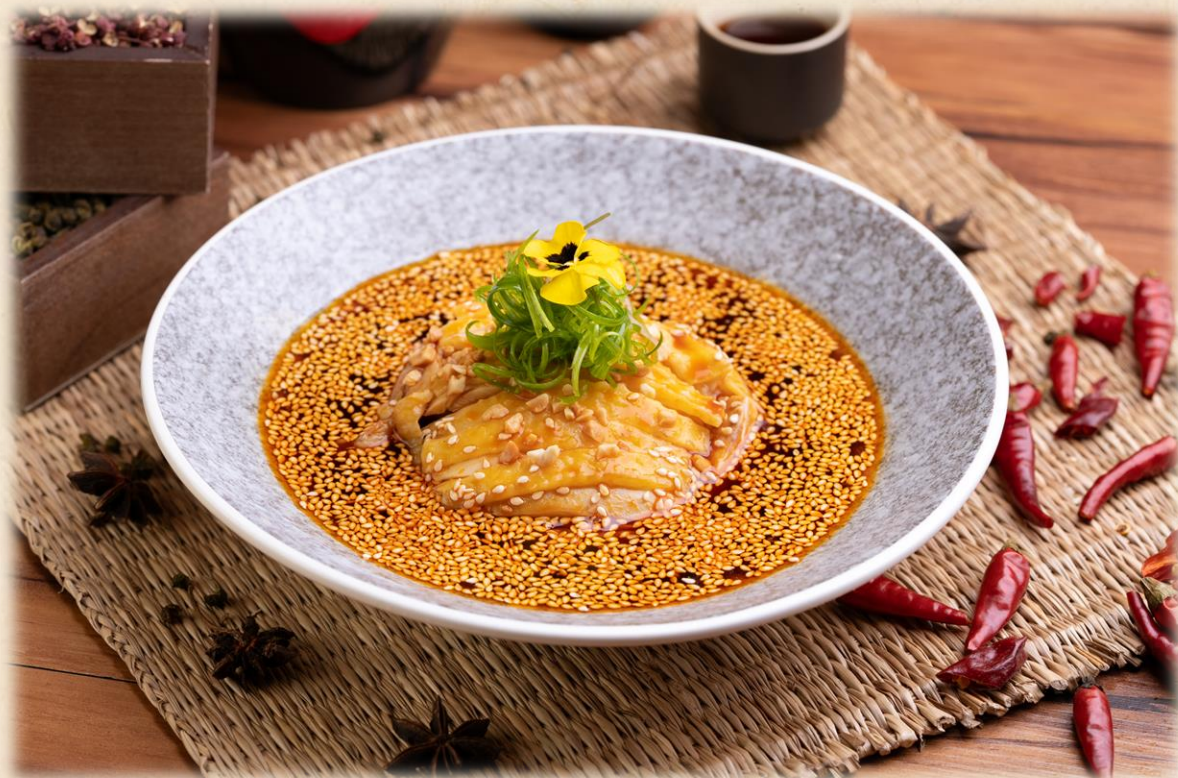
巴渝香辣口水鸡 Chilled Chicken Fillet with Sichuan Chili Oil