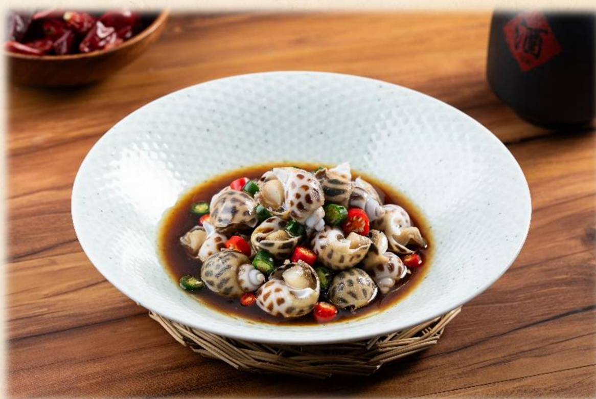
脆爽辣花螺 Marinated Sea Whelk in Homemade Chili Sauce