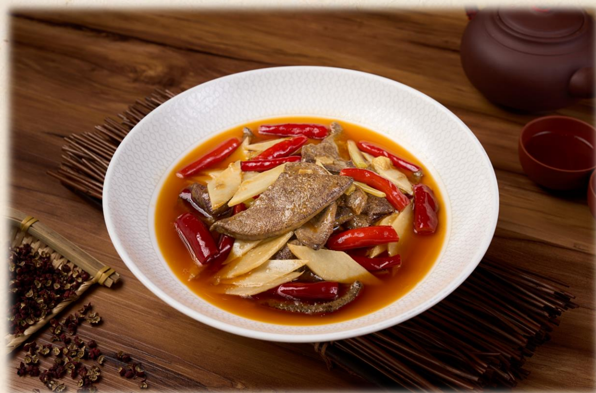
巴蜀火爆泡椒猪肝 澳门元 MOP 128 Stir-fried Pork Liver with Pickled Chili