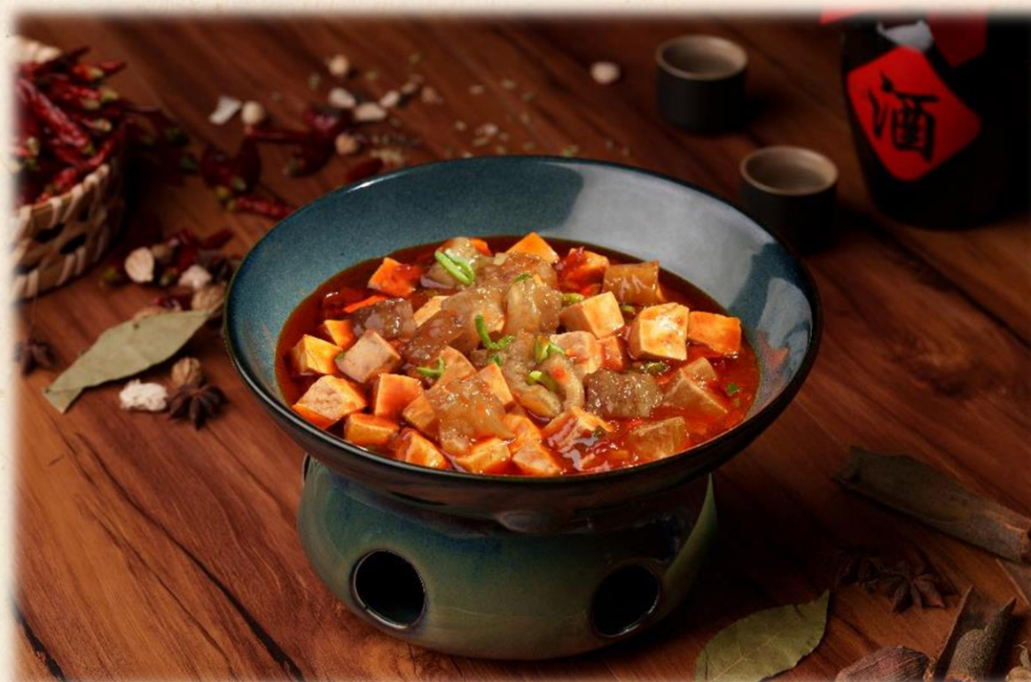
麻婆豆腐烧海参 Braised Mapo Tofu with Sea Cucumber 澳门元 158 MOP