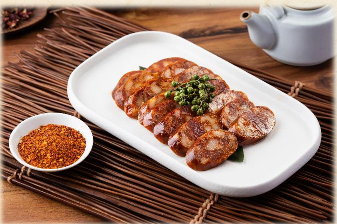
四川麻辣香肠 Sichuan Style Pork Sausage