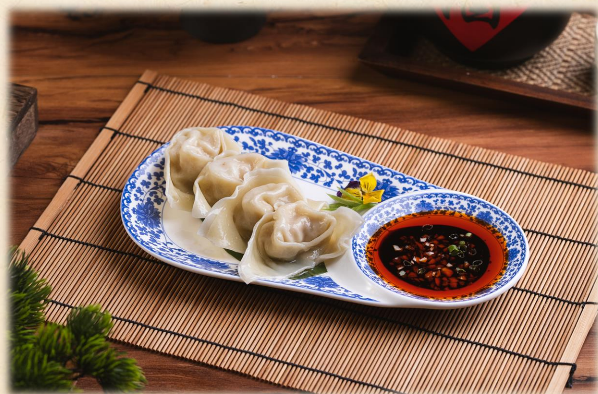
红油龙抄手 Boiled Wontons served with Chili Oil