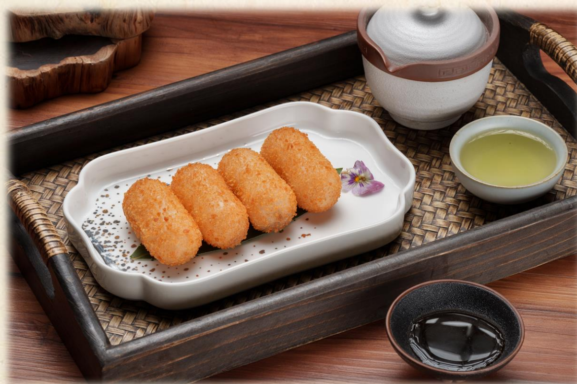
宽窄巷爆浆红糖糍粑 Deep-fried Glutinous Rice Cake with Brown Sugar