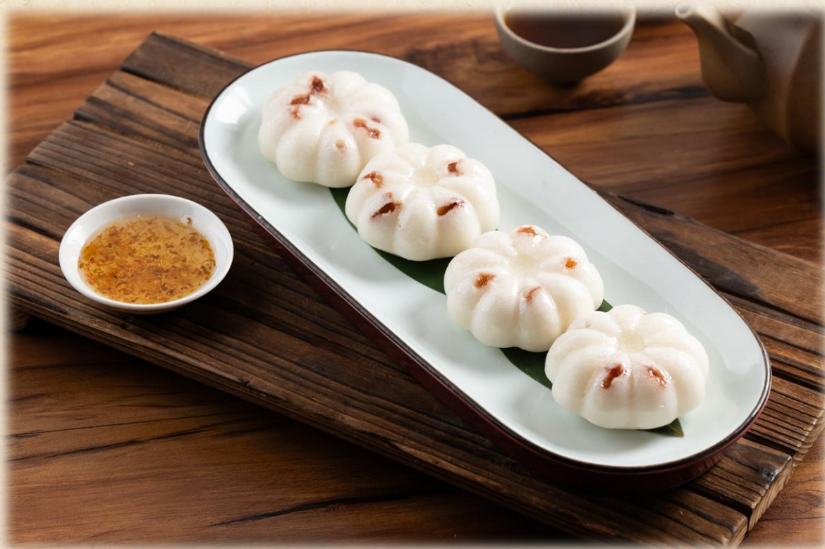
桂花白糖糕 Rice Cake with Osmanthus Syrup