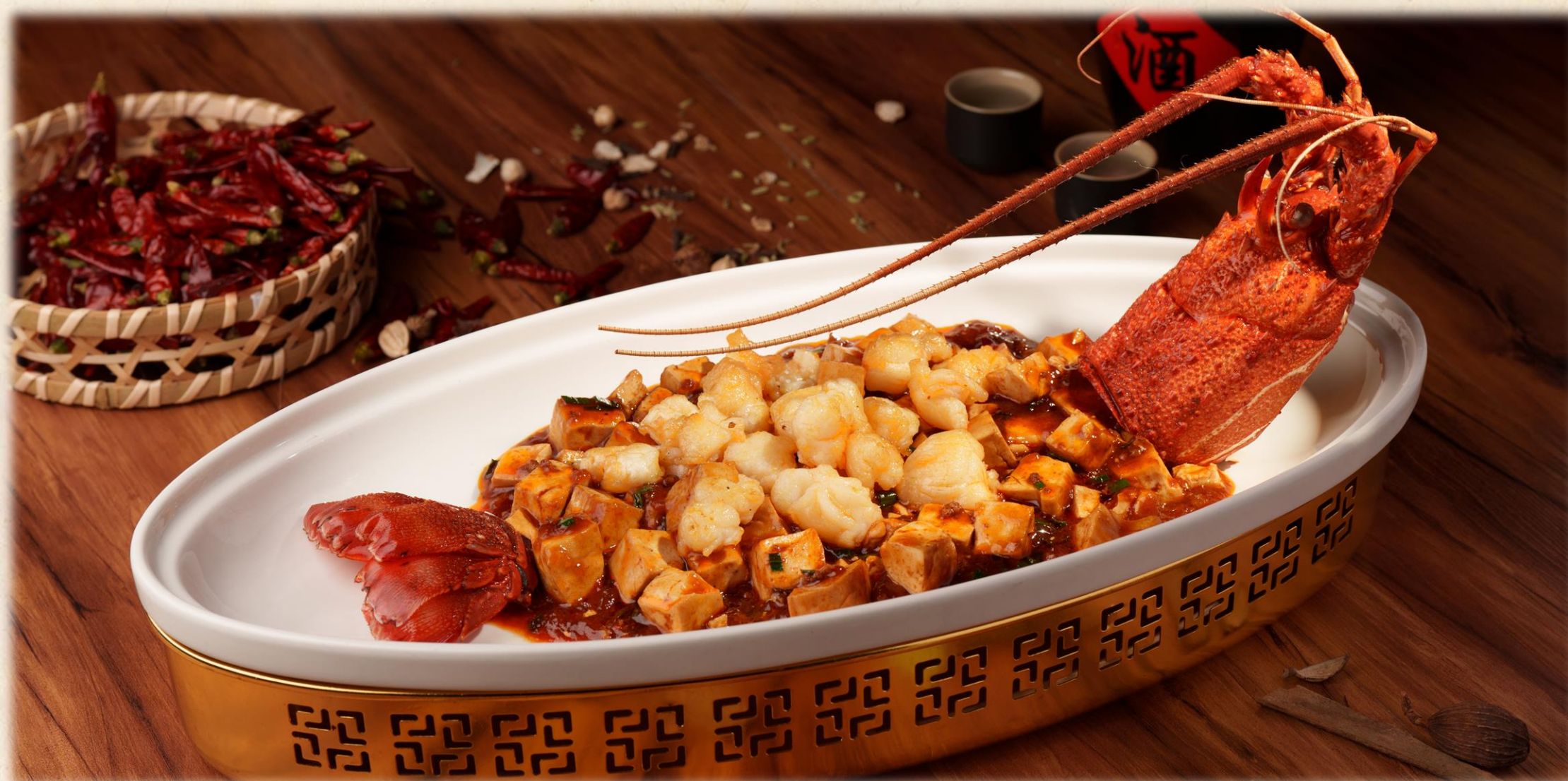
西澳大龙虾 Australian Lobster