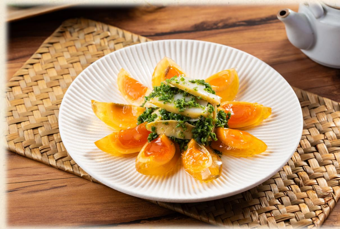
椒麻鲜鲍鱼拌黄金蛋 Fresh Abalone and Preserved Egg in Green Peppercorn Sauce