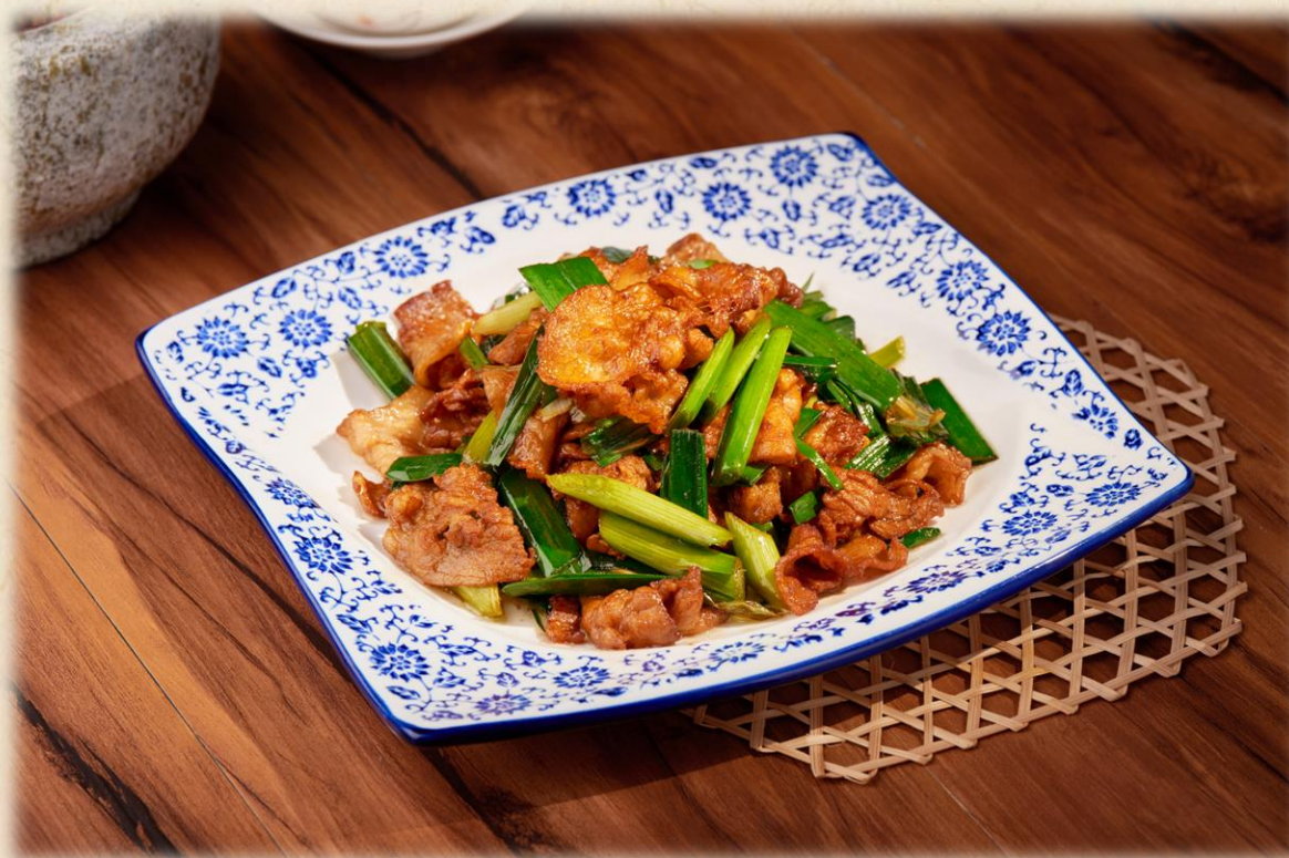
蒜苗小炒肉 澳门元 MOP 118 Wok-fried Pork Belly with Garlic Sprout