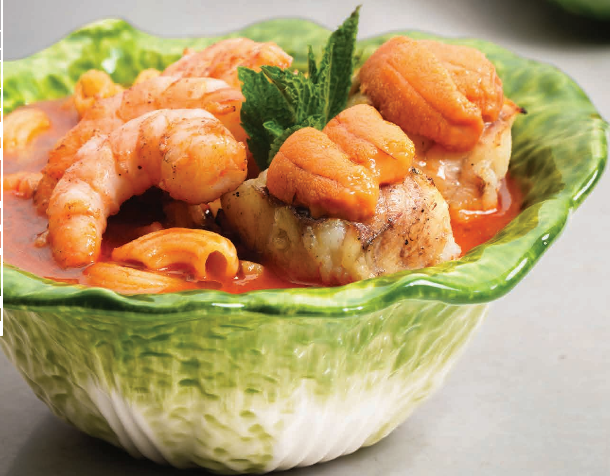
阿尔加维海鲜炖通心粉配安康鱼 “Massada de Peixe” Algarve seafood stew with pasta and monkfish