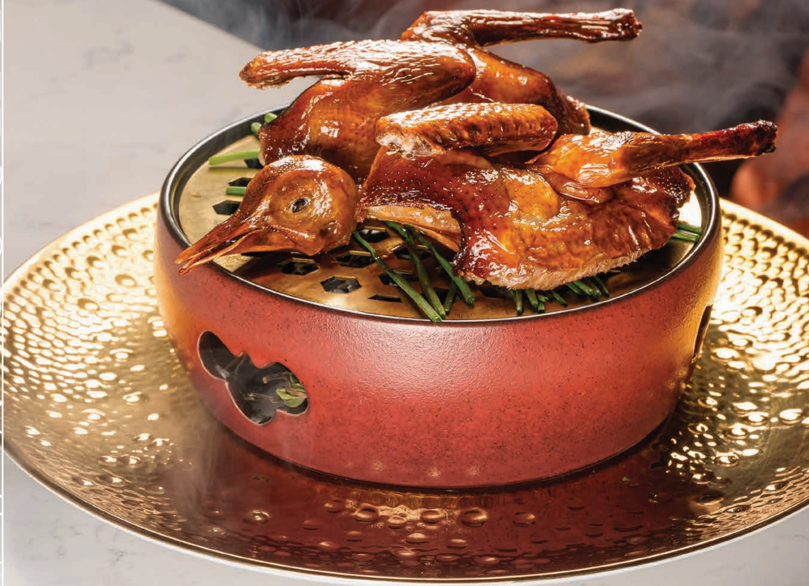
脆皮妙龄乳鸽 Crispy fried pigeon