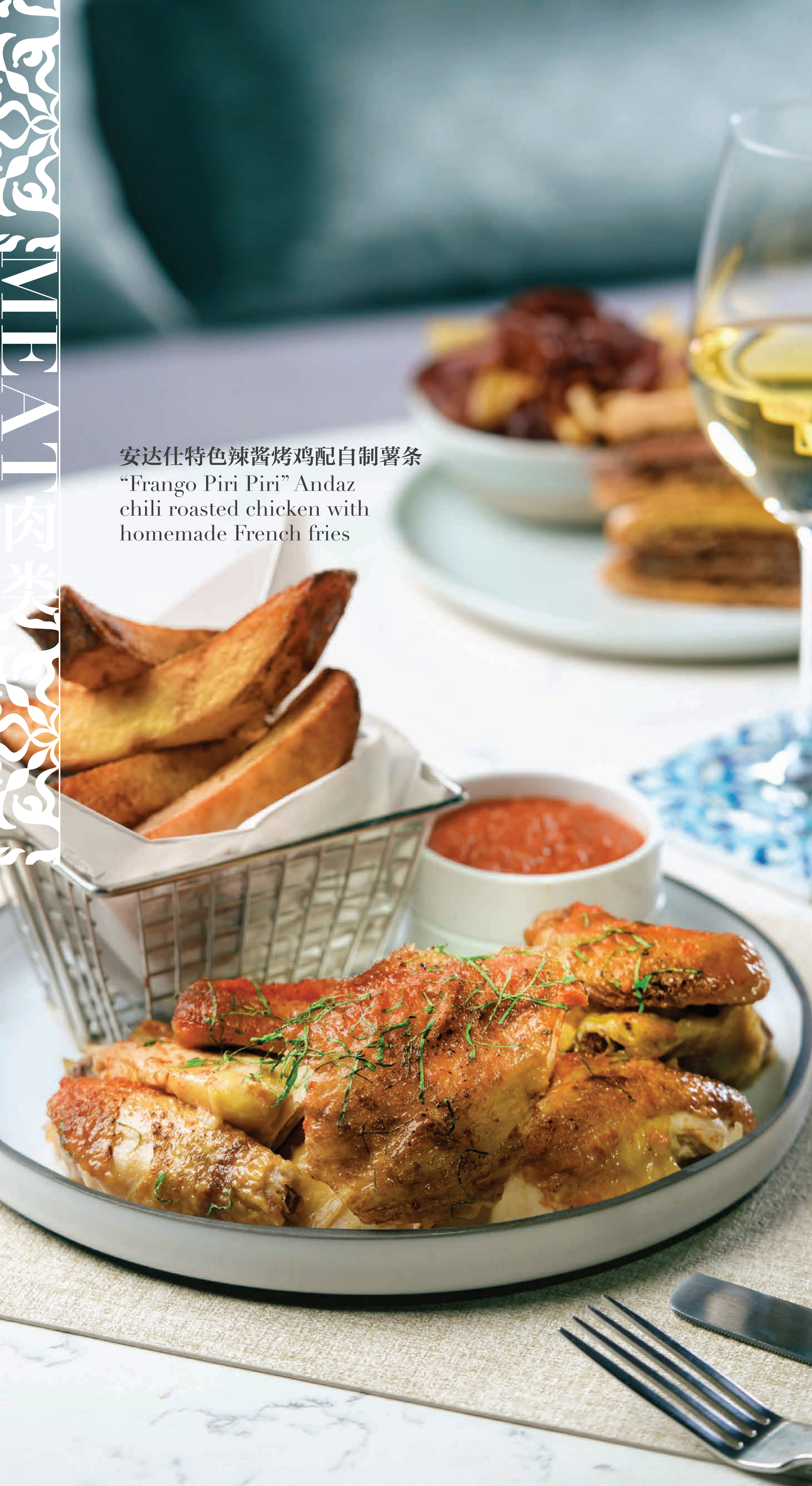
安达仕特色辣酱烤鸡配自制薯条 “Frango Piri Piri” Andaz chili roasted chicken with homemade French fries