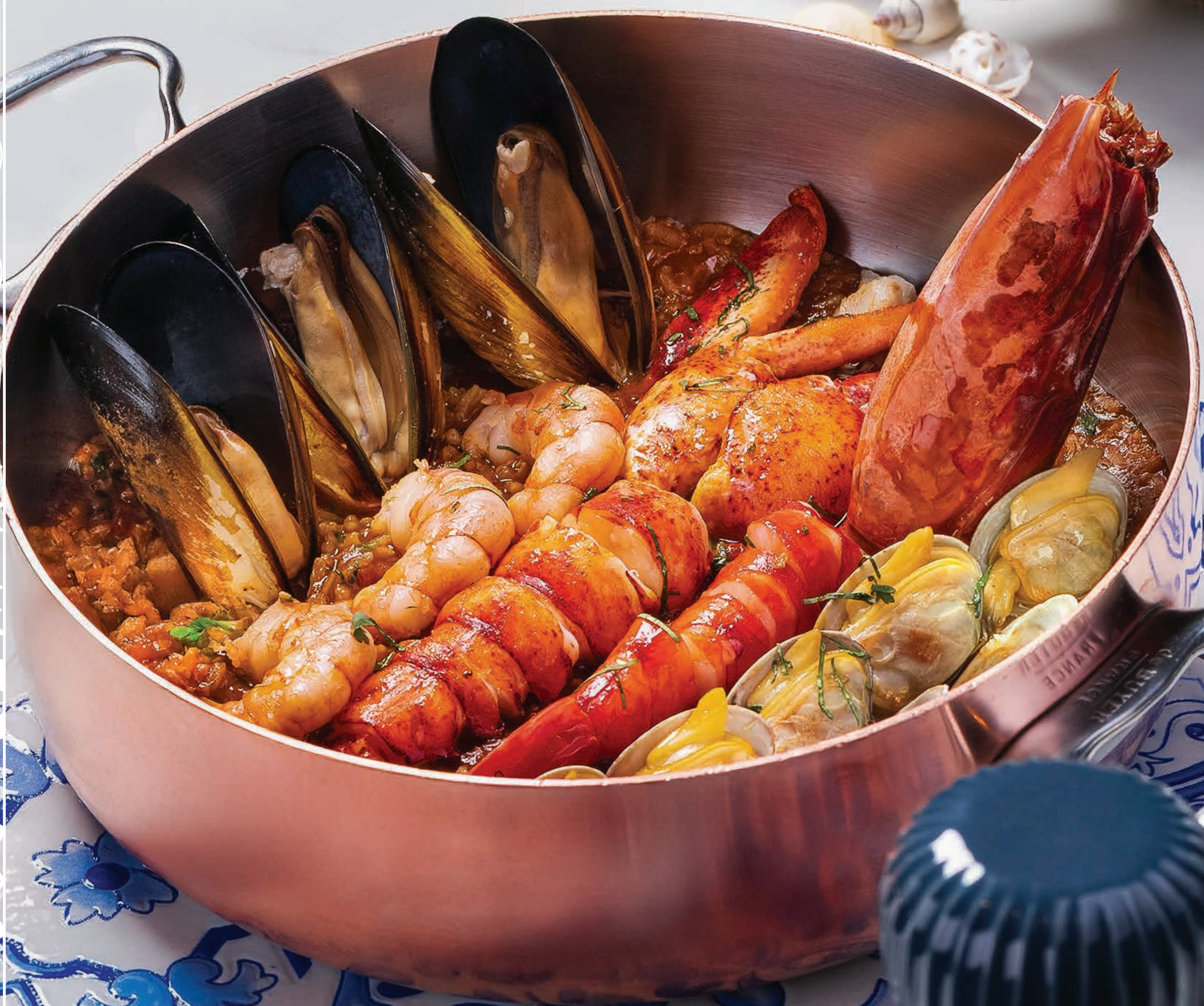
葡式龙虾海鲜饭 “Arroz de Marisco” Portuguese seafood rice with lobster, carabineiro, crab, mussels and clams