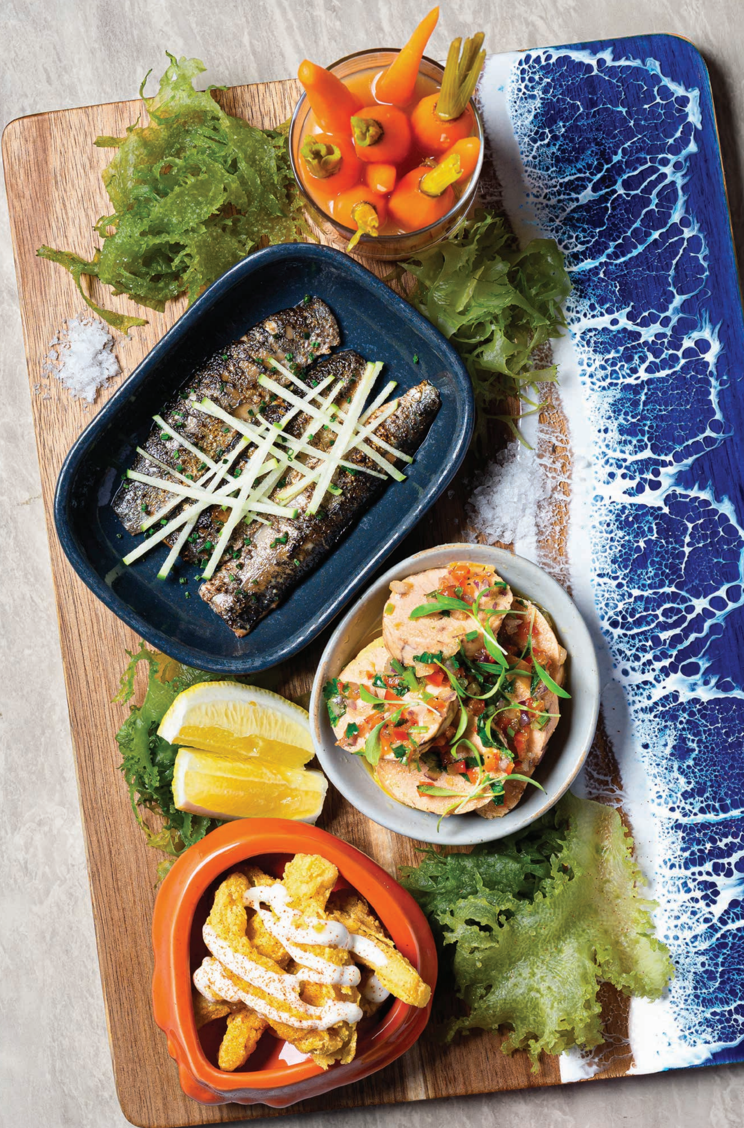
南部风味拼盘 - 腌沙丁鱼、 鱼子沙拉、醋浸胡萝卜及炸墨鱼 “Os Petiscos do Sul” Southern bites with marinated sardines, fish roe salad, pickled carrots and fried cuttlefish