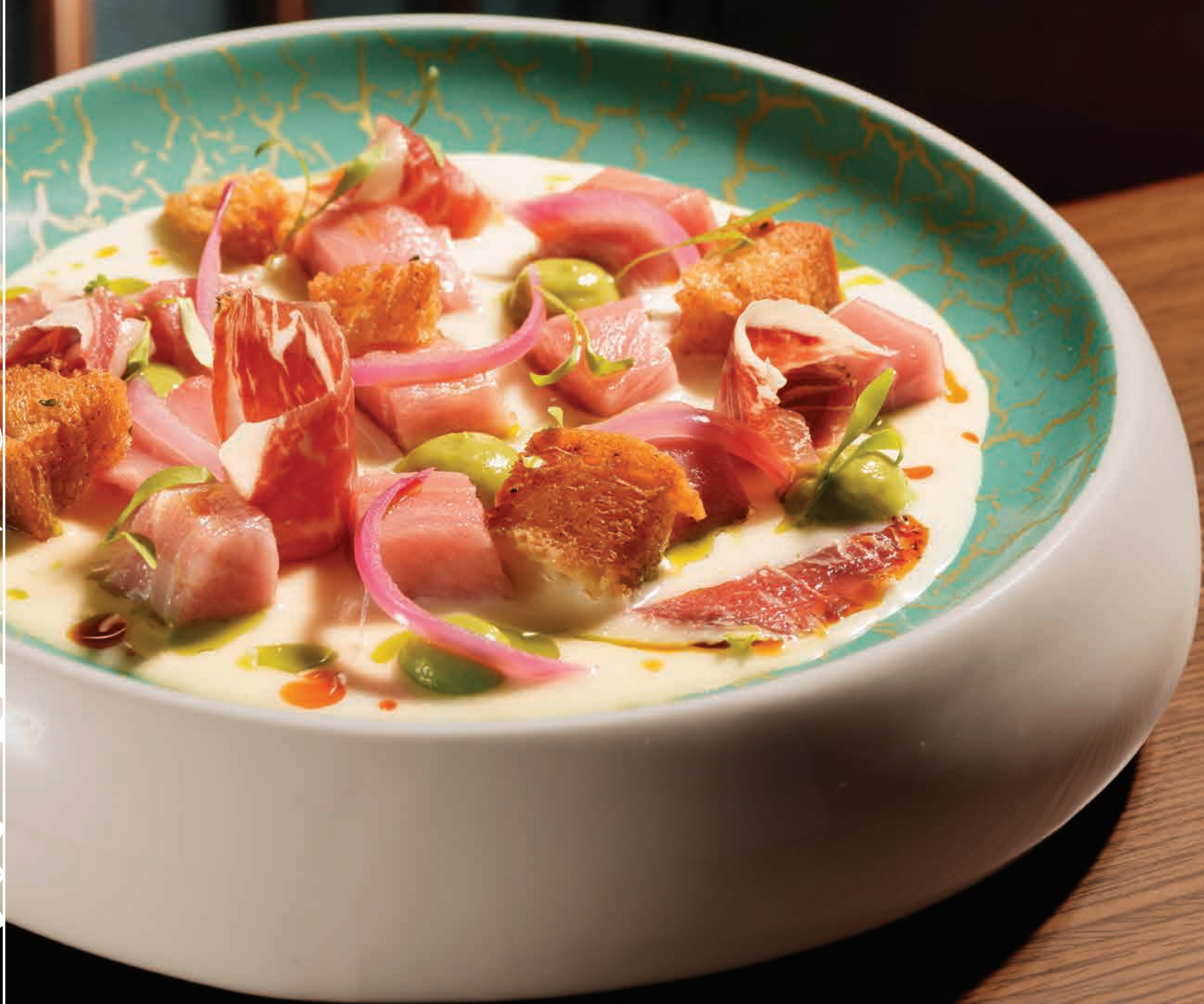
酸橘汁腌吞拿鱼配伊比利亚火腿及牛油果 “Ceviche de Atum” Tuna ceviche with Iberico ham and avocado