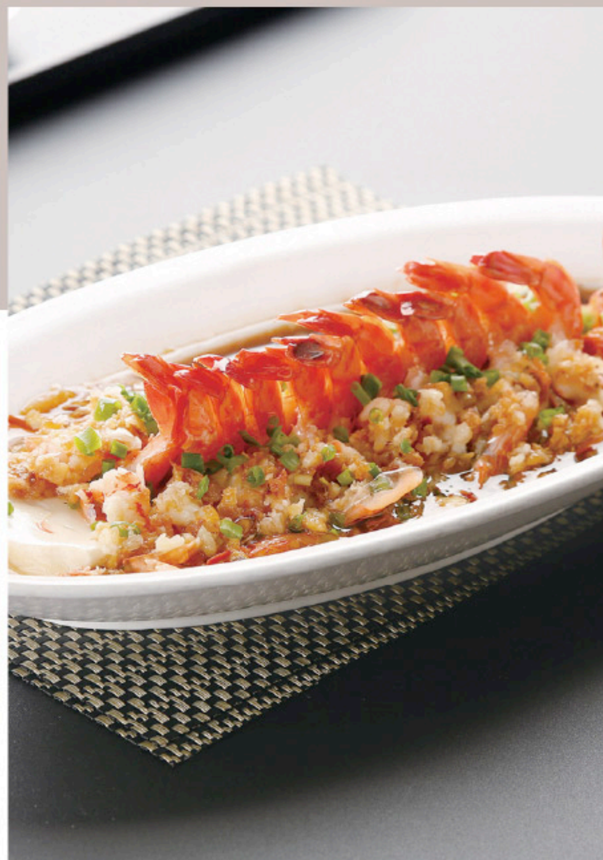
蒜蓉金银虾 Steamed Shrimp with Garlic