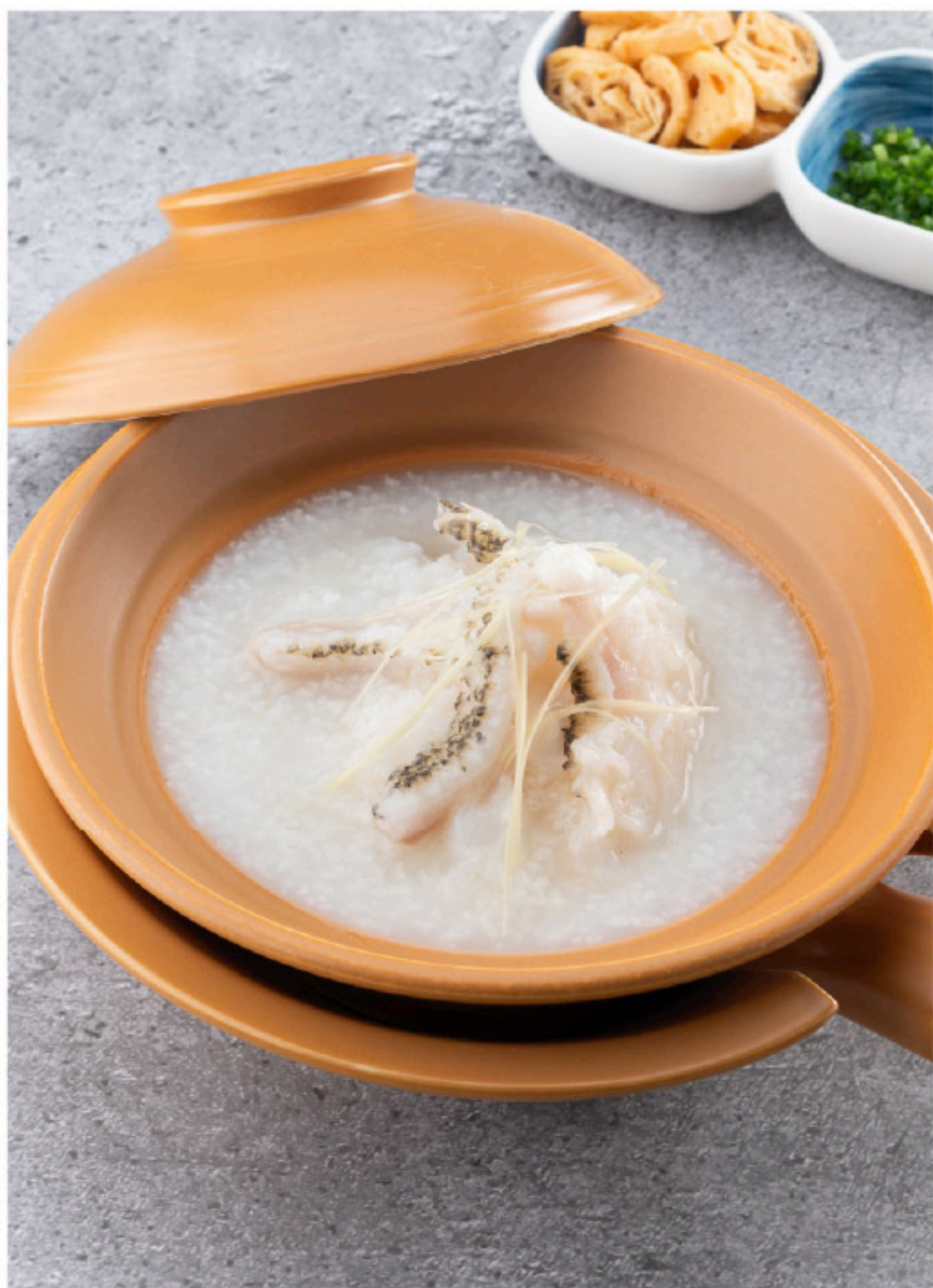
生滚龙趸鱼片粥 Congee with Tiger Grouper Fillets