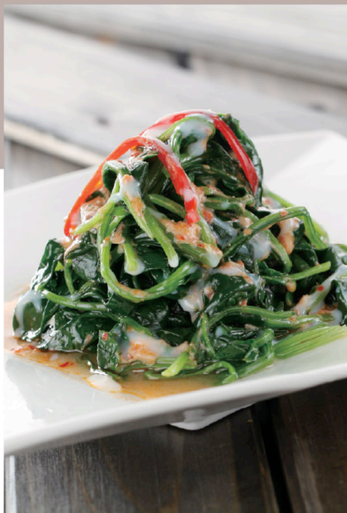
腐乳空心菜 Stir-fried Water Spinach with Preserved Bean Curd