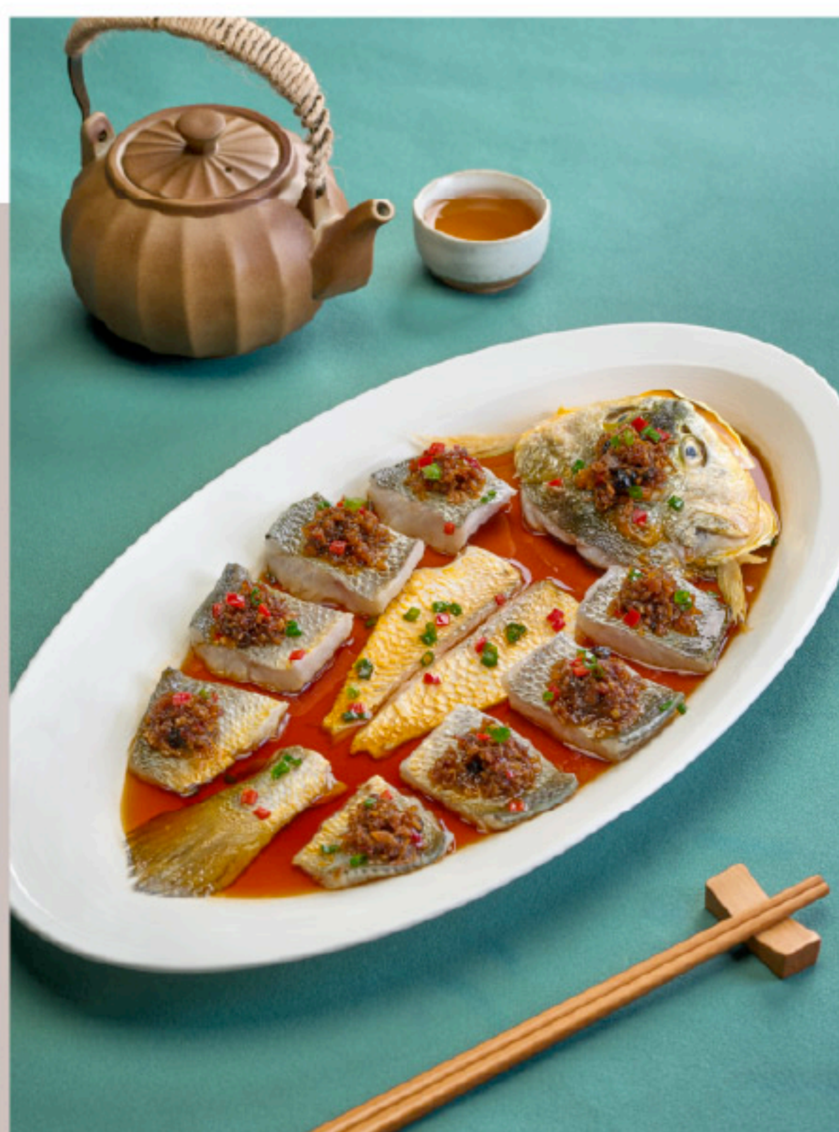
黄花鱼 (酱椒蒸 / 台式浸 / 树子清蒸) 澳门元 MOP 288

Baked Giant River Prawns with Basil and Premium Soy Sauce