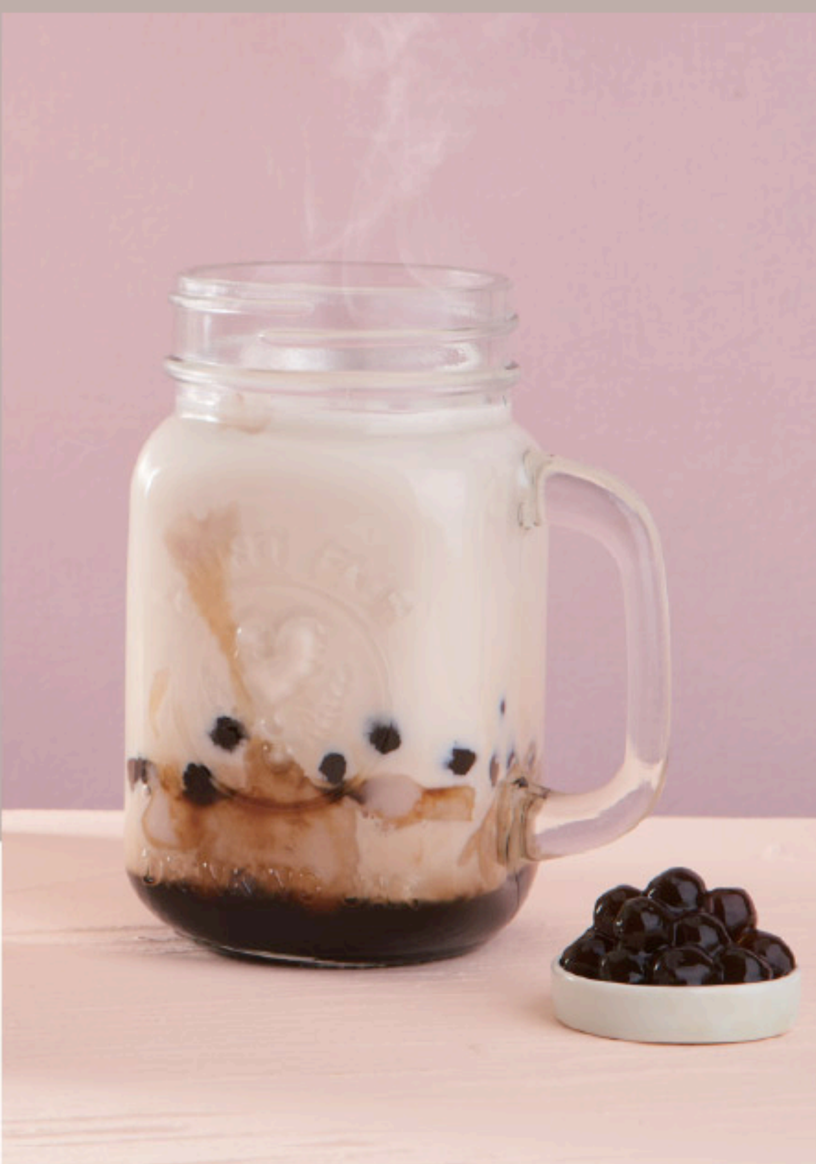
芋泥黑糖鲜奶 (冷 Cold / 热 Hot)