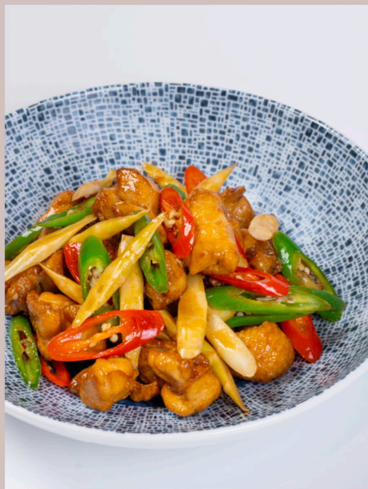
双椒小炒鸡球 澳门元 MOP 138 Stir-fried Chicken with Chilies