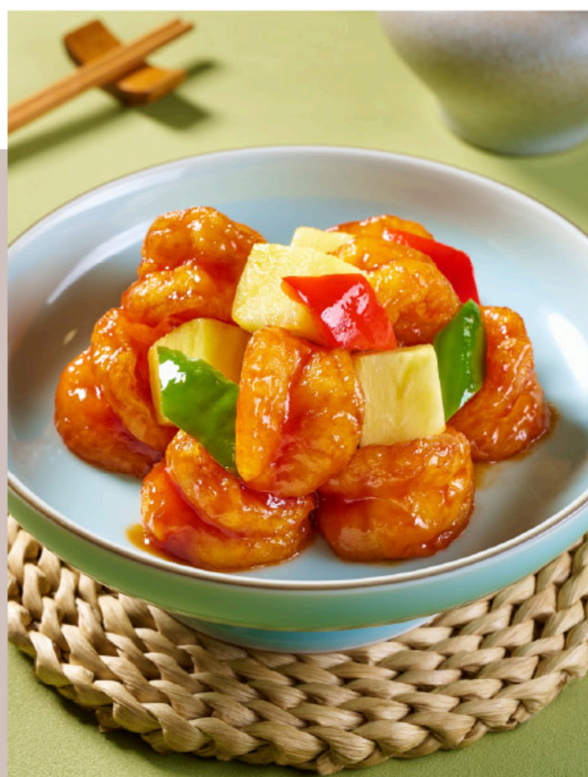
柚蜜凤梨酸甜虾球 澳门元 MOP 138 Deep-fried Shrimp with Honey Pomelo and Pineapple in Sweet and Sour Sauce

所有价格均以澳门元计算, 并附加10%服务费。图片只供参考。 如对所有食物有过敏反应, 请于点餐前通知服务团队。餐厅特色茶位每位澳门元12。 All prices are in MOP and subject to a 10% service charge. Photos for reference only. Please inform the service team of any food allergy or dietary requirements prior to ordering. Tea charge: MOP12 per person.