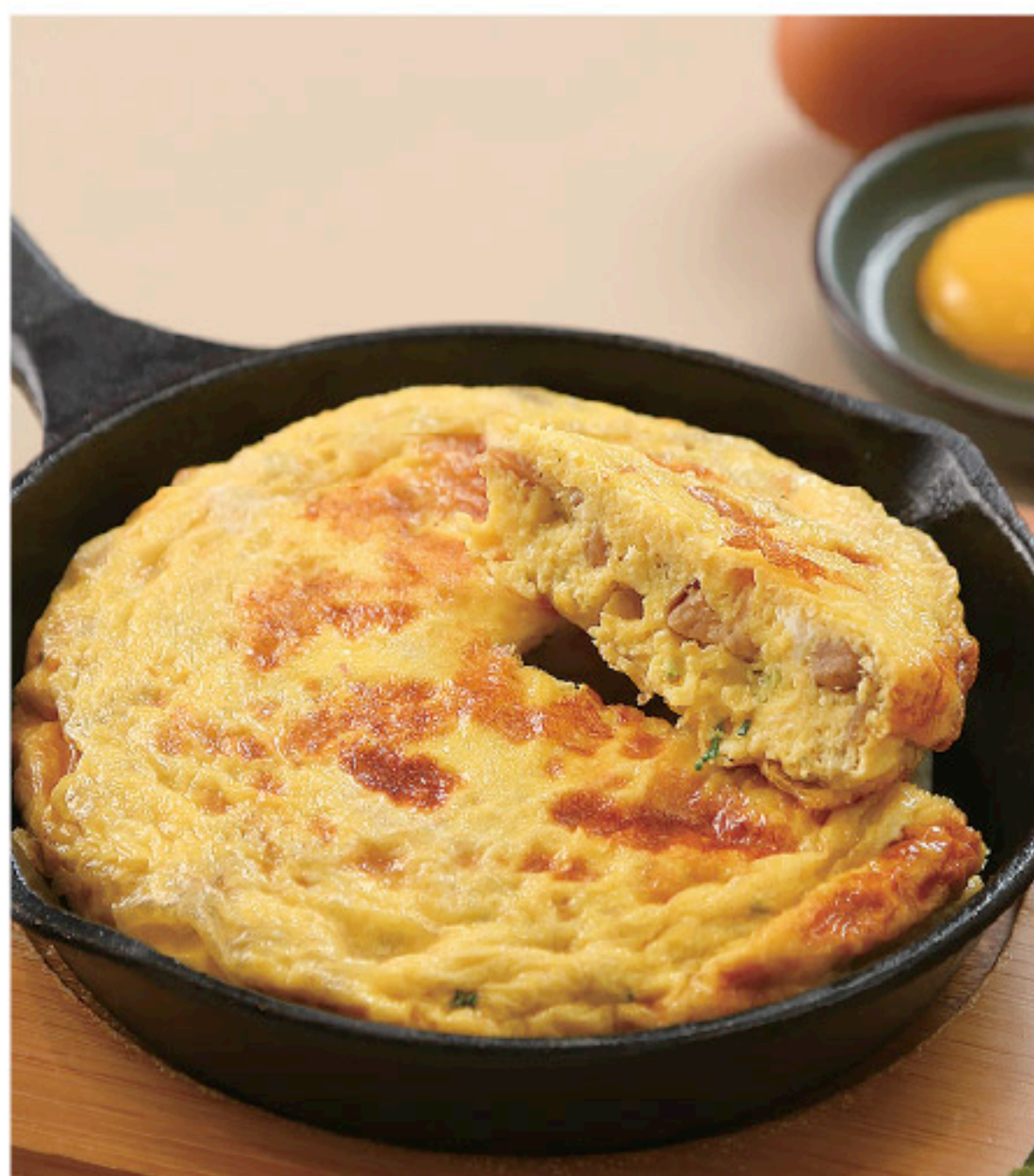
台式厚煎菜脯蛋 澳门元 88 Taiwanese Style Omelet with Preserved Turnip Bits

所有价格均以澳门元计算, 并附加10%服务费。图片只供参考。 如对所有食物有过敏反应, 请于点餐前通知服务团队。餐厅特色茶位每位澳门元12。 All prices are in MOP and subject to a 10% service charge. Photos for reference only. Please inform the service team of any food allergy or dietary requirements prior to ordering. Tea charge: MOP12 per person.