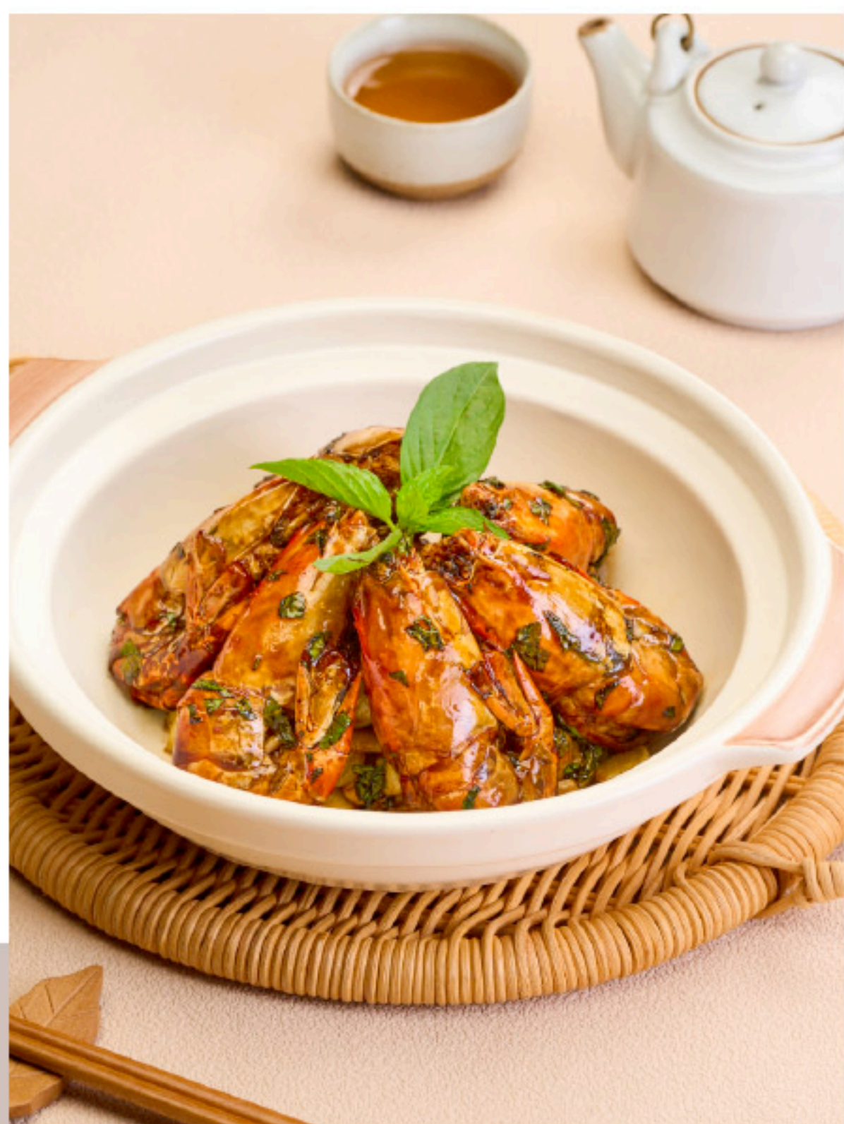
塔香头抽焗琥珀玉钳虾 澳门元 MOP 218

Baked Giant River Prawns with Basil and Premium Soy Sauce