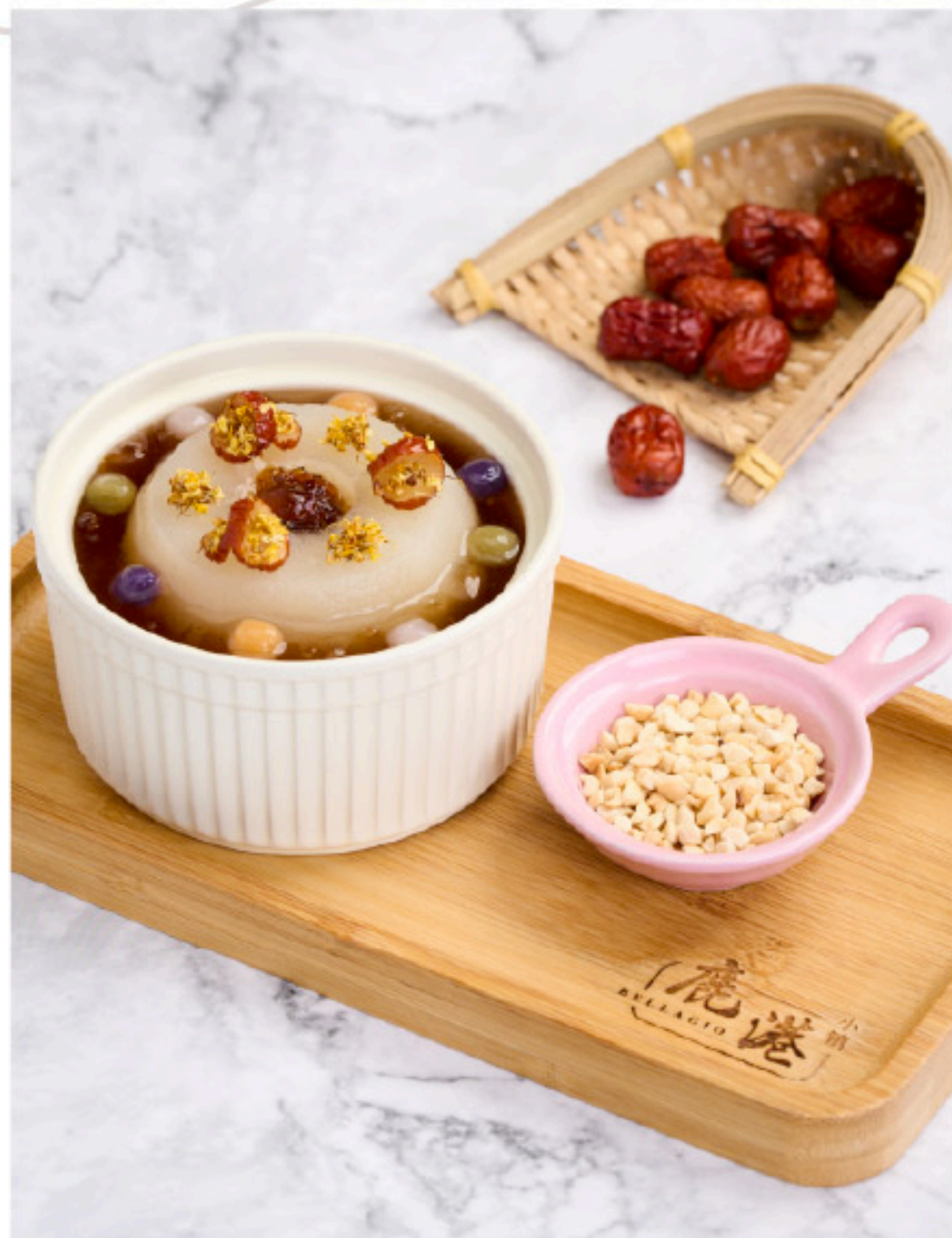
琥珀雪梨羹 (冷 Cold / 热 Hot)

Double-boiled Pear and Peach Gum Sweet Soup with Tapioca Pearls