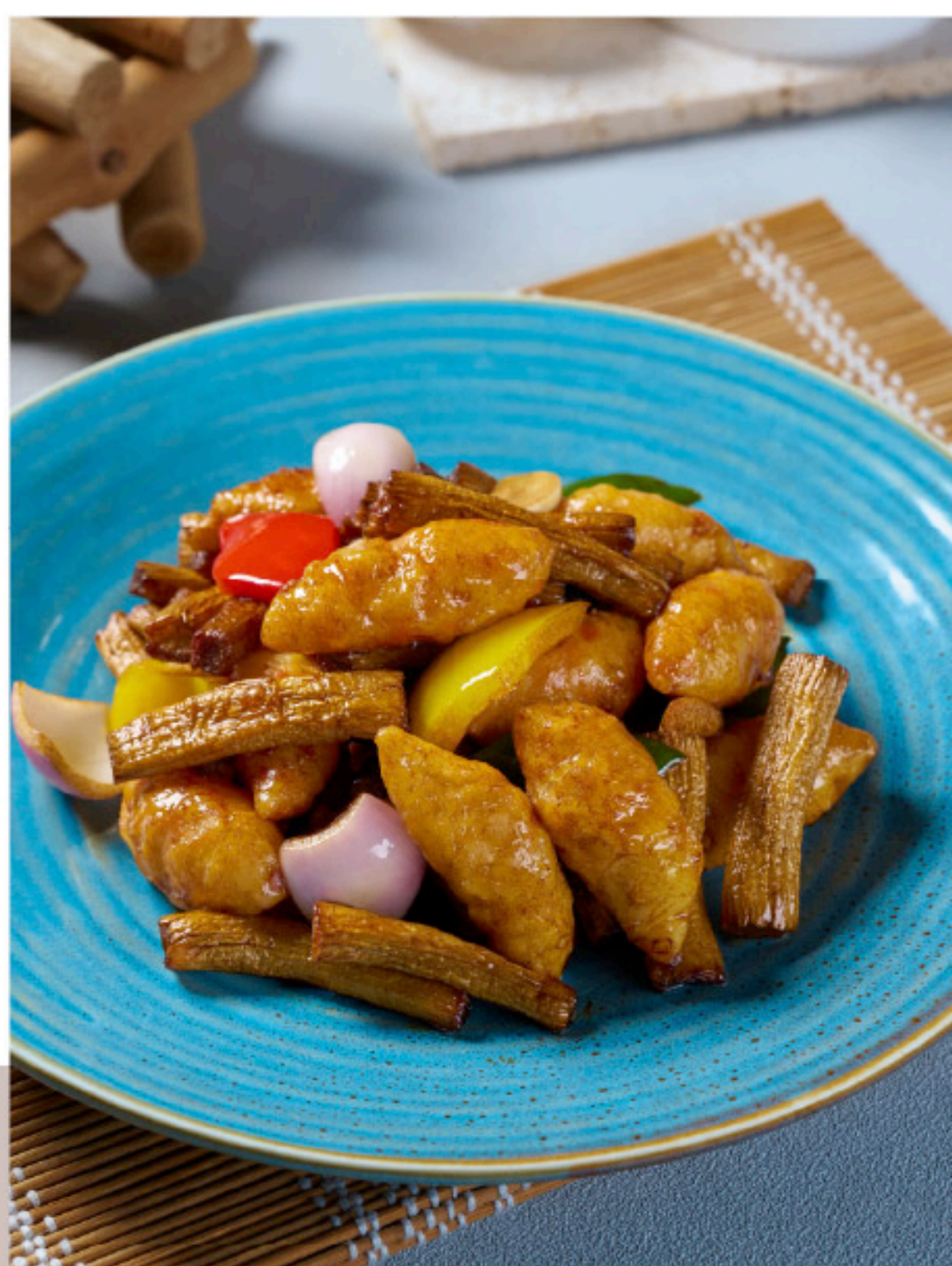
茶树菇爆炒花枝条 澳门元 MOP 108 Stir-fried Cuttlefish with Poplar Mushroom