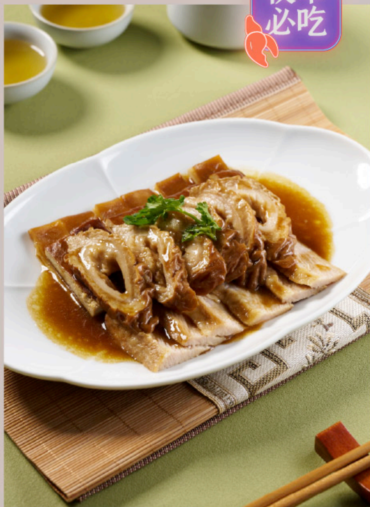
台南卤水拼盘 澳门元 118 MOP Soy-braised Platter with Pig's Ears, Pork Intestines and Bean Curd