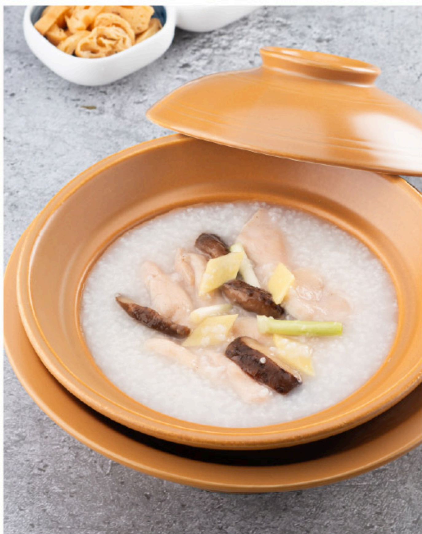
生滚香菇鸡球粥 Congee with Chicken and Mushroom