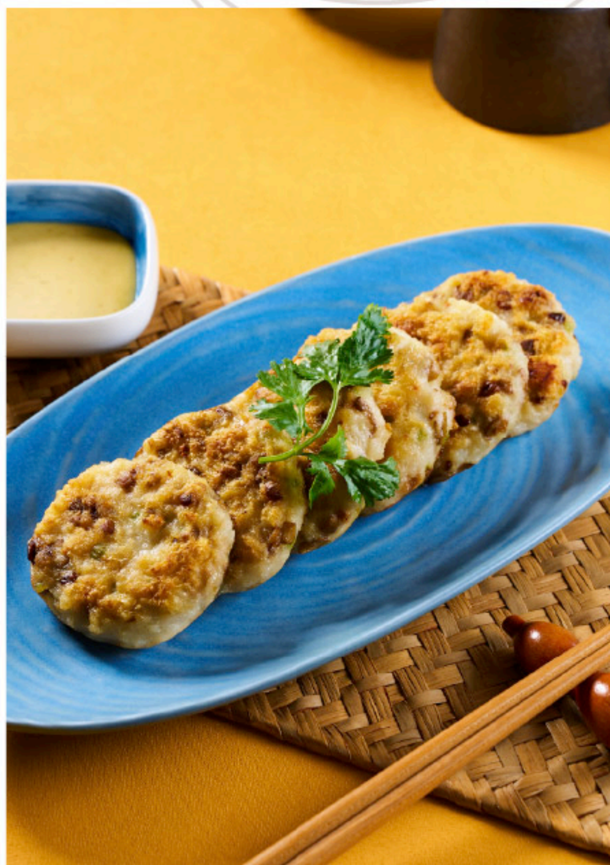
香煎珍菌芥末花枝饼 澳门元 MOP 118 Pan-fried Mushroom and Cuttlefish Cakes