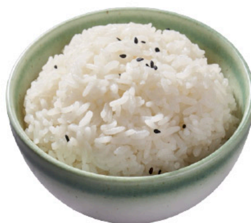
米饭 Steamed Rice