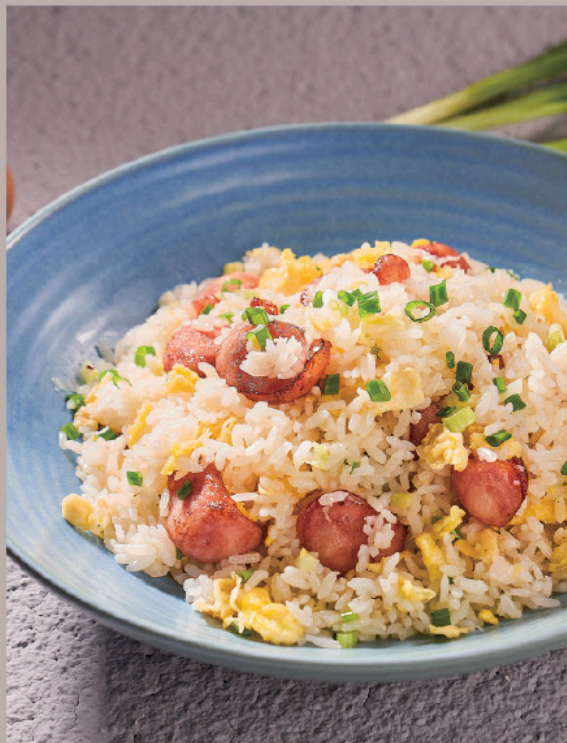
台式香肠炒饭 澳门元 92 MOP

Taiwanese Style Fried Rice with Pork and Turnip in Lard