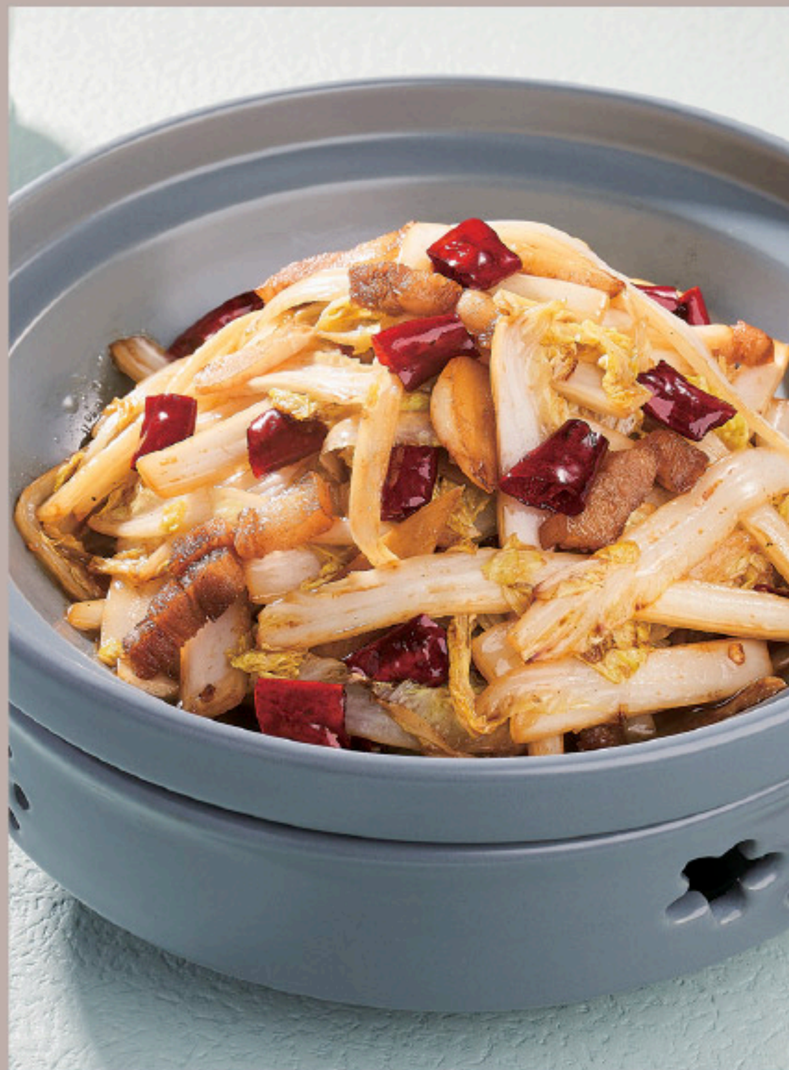
酸辣娃娃菜 Stir-fried Baby Cabbage with Pork and Chili