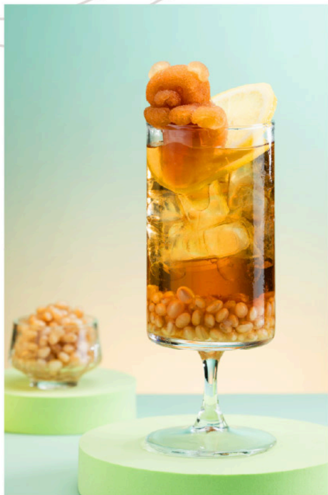
柠檬冬瓜茶 (冷 Cold) White Gourd Drink with Lemon