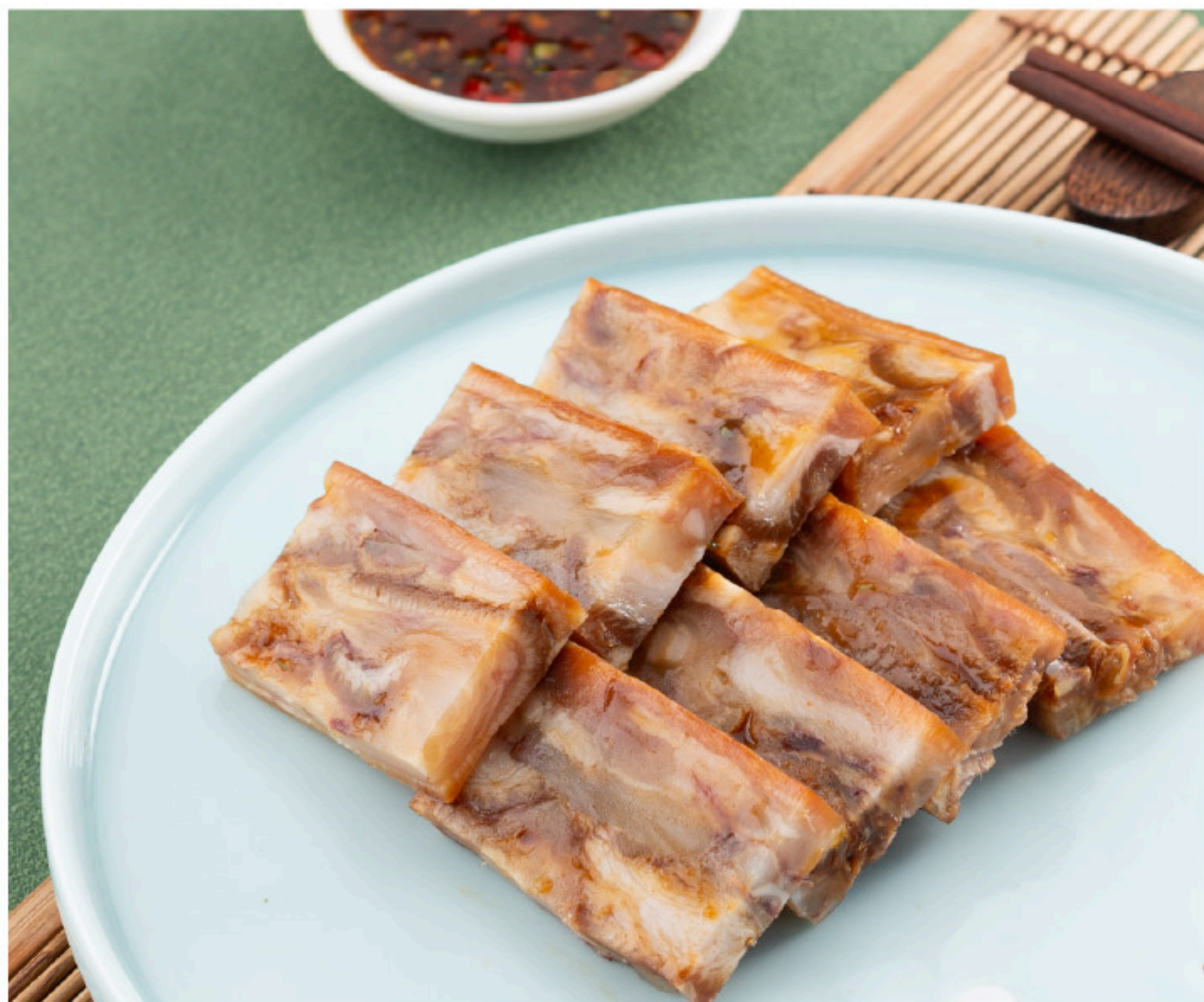
台式万峦猪手冻 澳门元 MOP 168

Marinated Pork Knuckle Jelly in Taiwanese Style