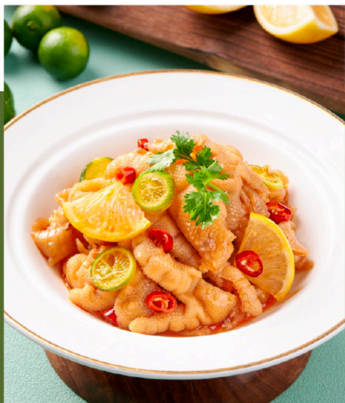
柠檬香辣无骨凤爪 澳门元 MOP 98

Marinated Pork Knuckle Jelly in Taiwanese Style