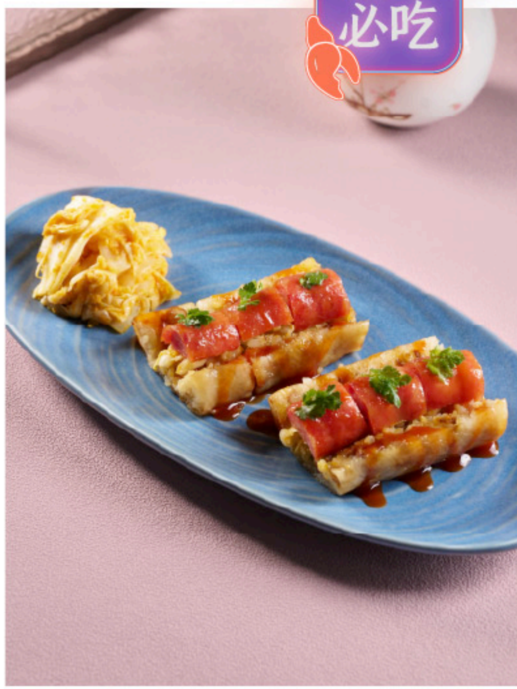
台湾士林特色大肠包小肠 澳门元 68 MOP Night Market-style Sausage in Sticky Rice Patty