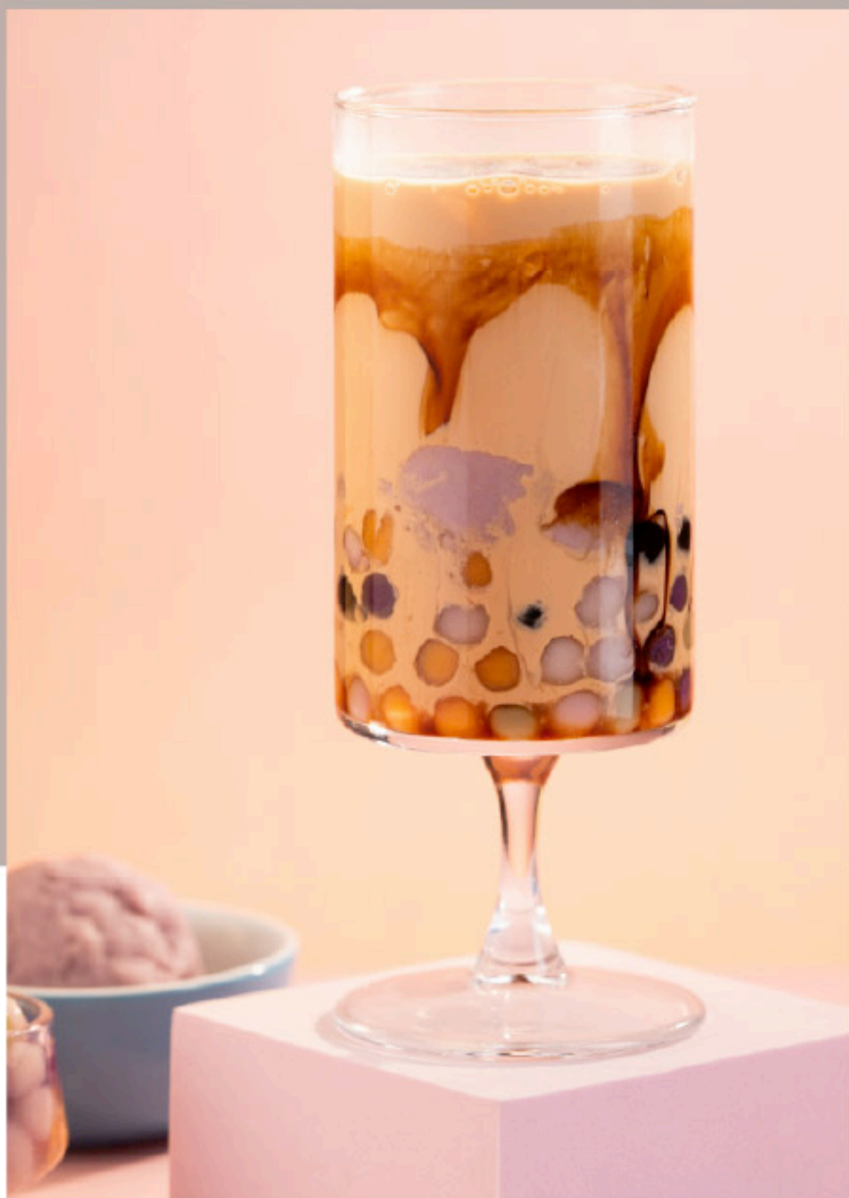
芋泥珍珠奶茶 (冷 Cold / 热 Hot)