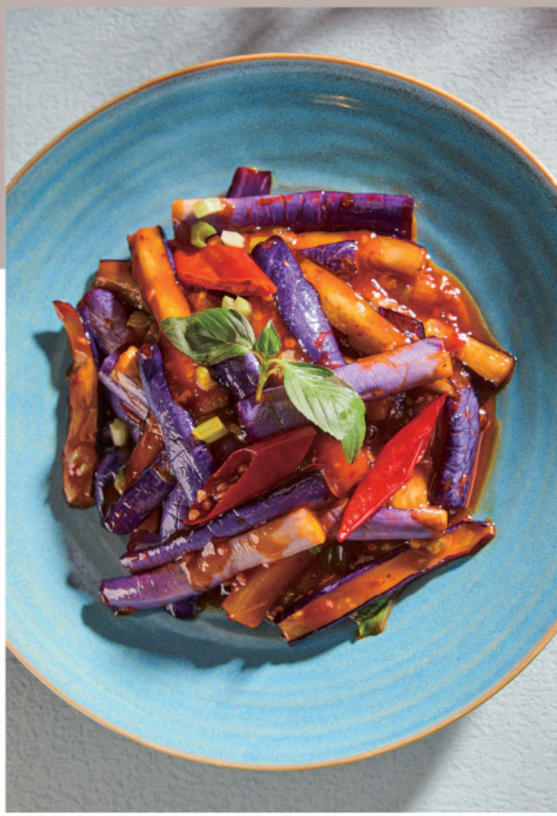
客家茄子 Braised Eggplant with Sweet Basil in Hakka Style