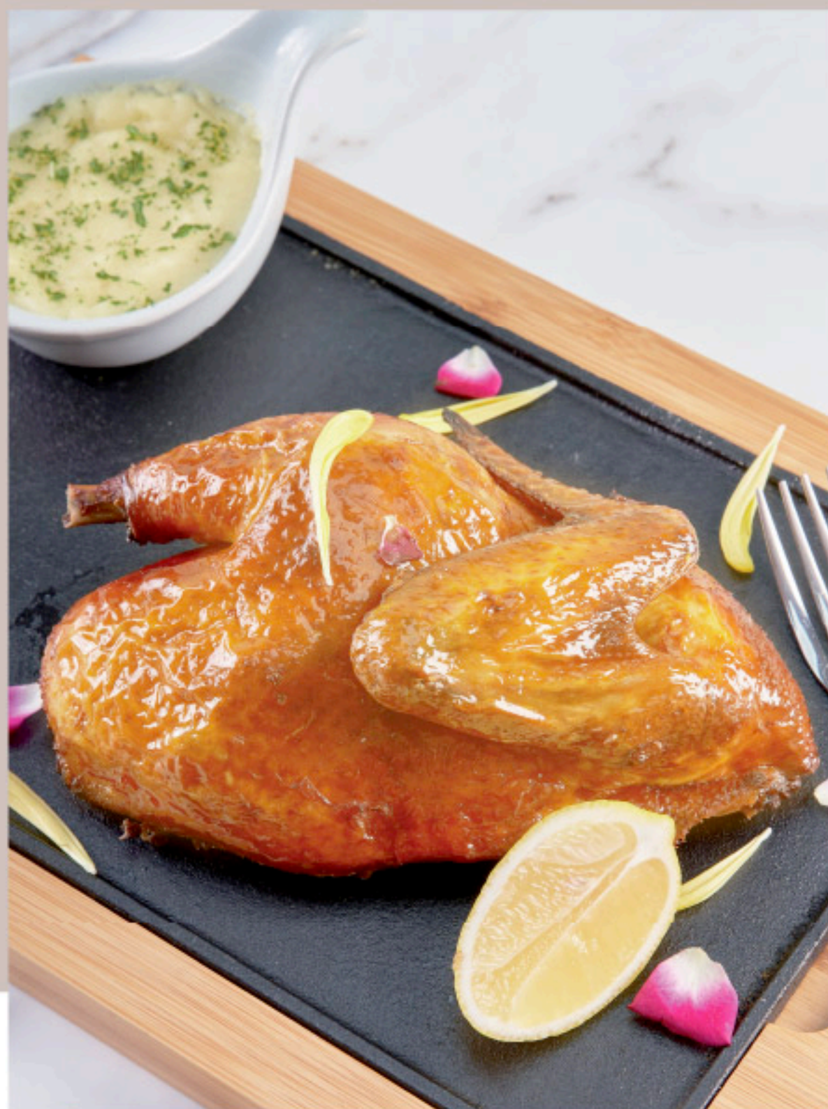
台中脆皮香烤鸡 澳门元 168 Taichung Baked Chicken