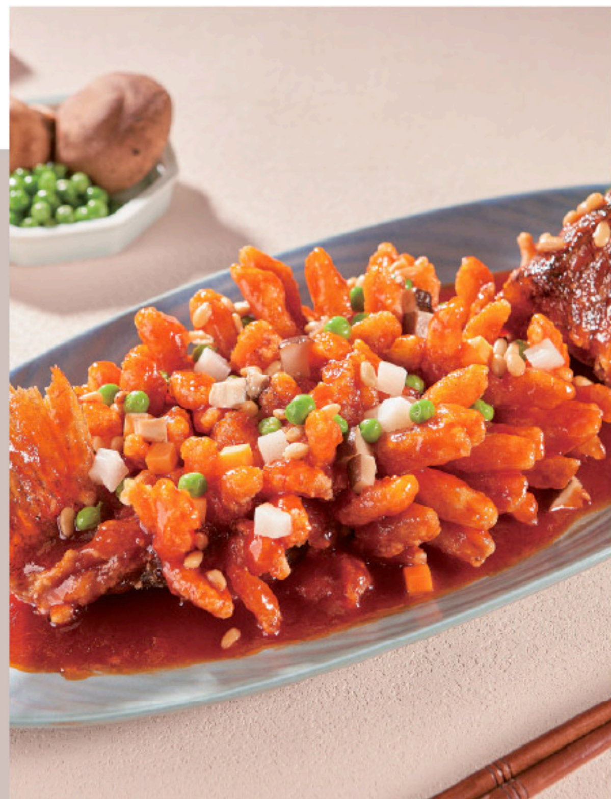
松子鲈鱼 Sweet and Sour Whole Sea Bass with Pine Nuts