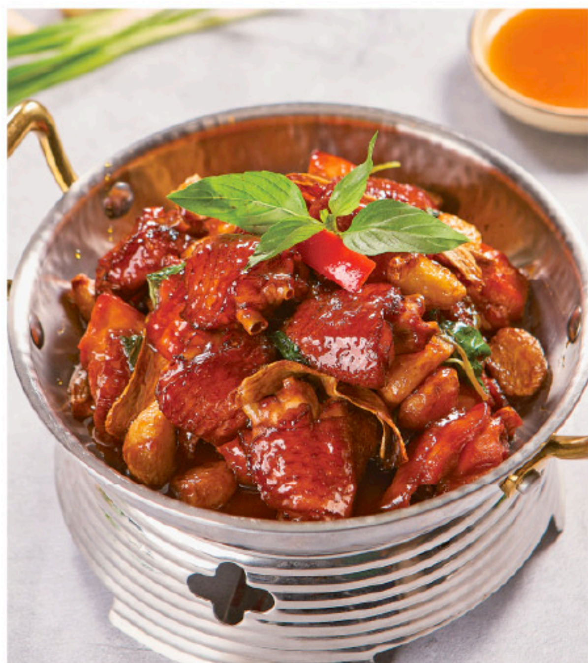
鹿港三杯鸡 澳门元 128 Three Cup Chicken