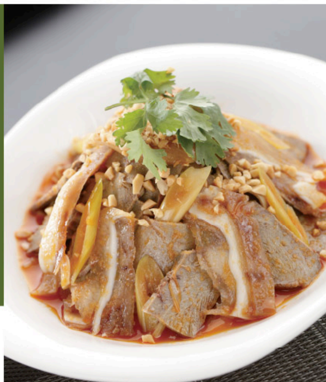
夫妻肺片 澳门元 MOP 88

Marinated Boneless Chicken Feet in Lemon Sauce