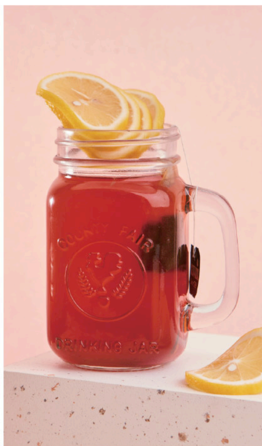
港式柠檬茶 (冷 Cold / 热 Hot) Hong Kong Style Lemon Tea