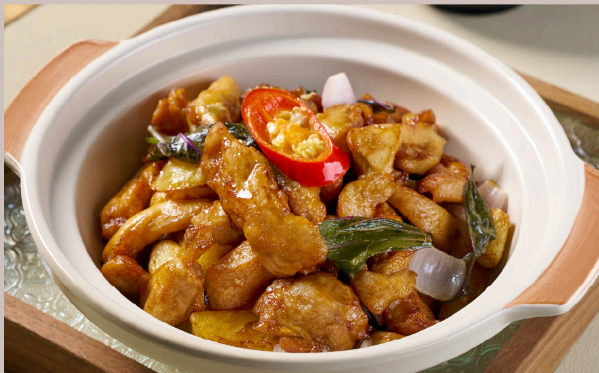
沙姜紫苏鸡煲 澳门元 MOP 138 Braised Chicken with Sand Ginger and Perilla in Clay Pot