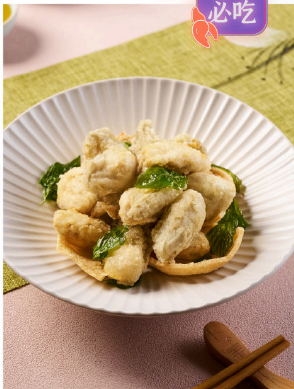
蚵仔酥 澳门元 92 MOP Deep-fried Baby Oysters