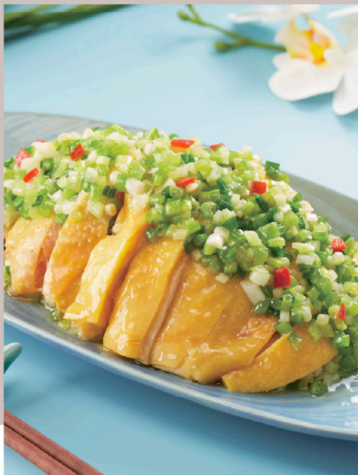
葱油嫩鸡 澳门元 138 Poached Chicken with Scallion and Ginger Oil