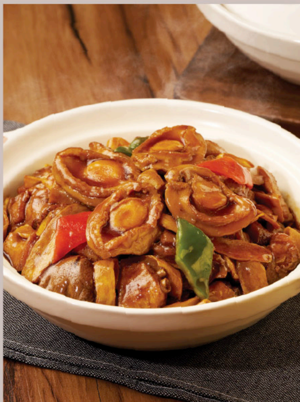
鲍鱼姜母鸭 澳门元 MOP 288 Braised Duck with Abalone and Ginger