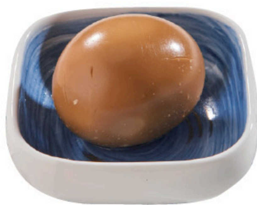
热卤蛋 Stewed Egg