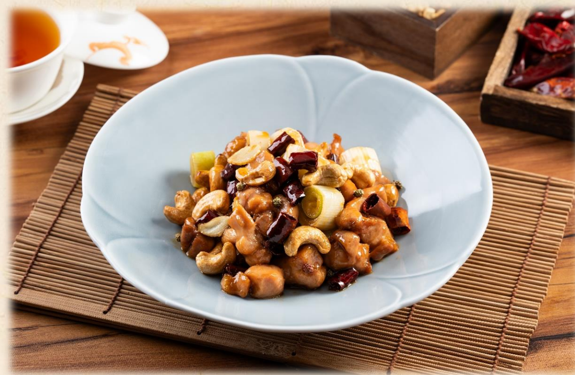
宫保腰果鸡丁 澳门元 MOP 158 Kong Po Chicken with Cashews