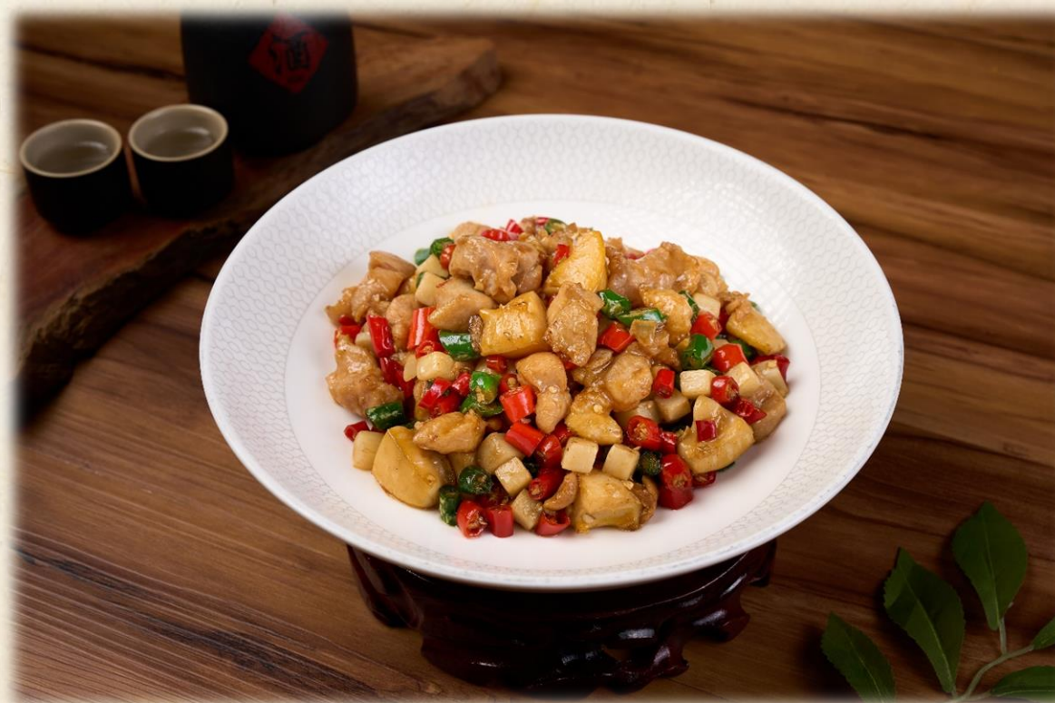
腌椒仔姜鲍鱼鸡 澳门元 MOP 168 Stir-fried Chicken with Abalone and Picked Chili