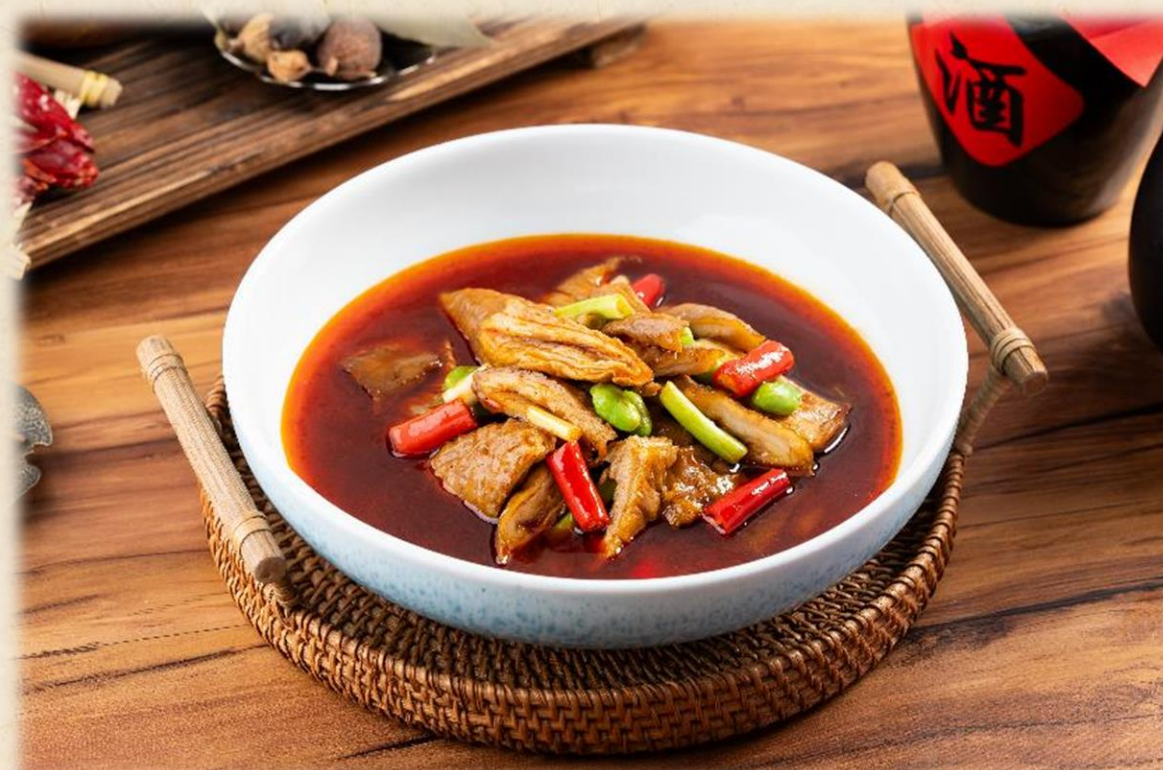
川式红烧肥肠 澳门元 MOP 158 Braised Pork Intestine in Sichuan Style