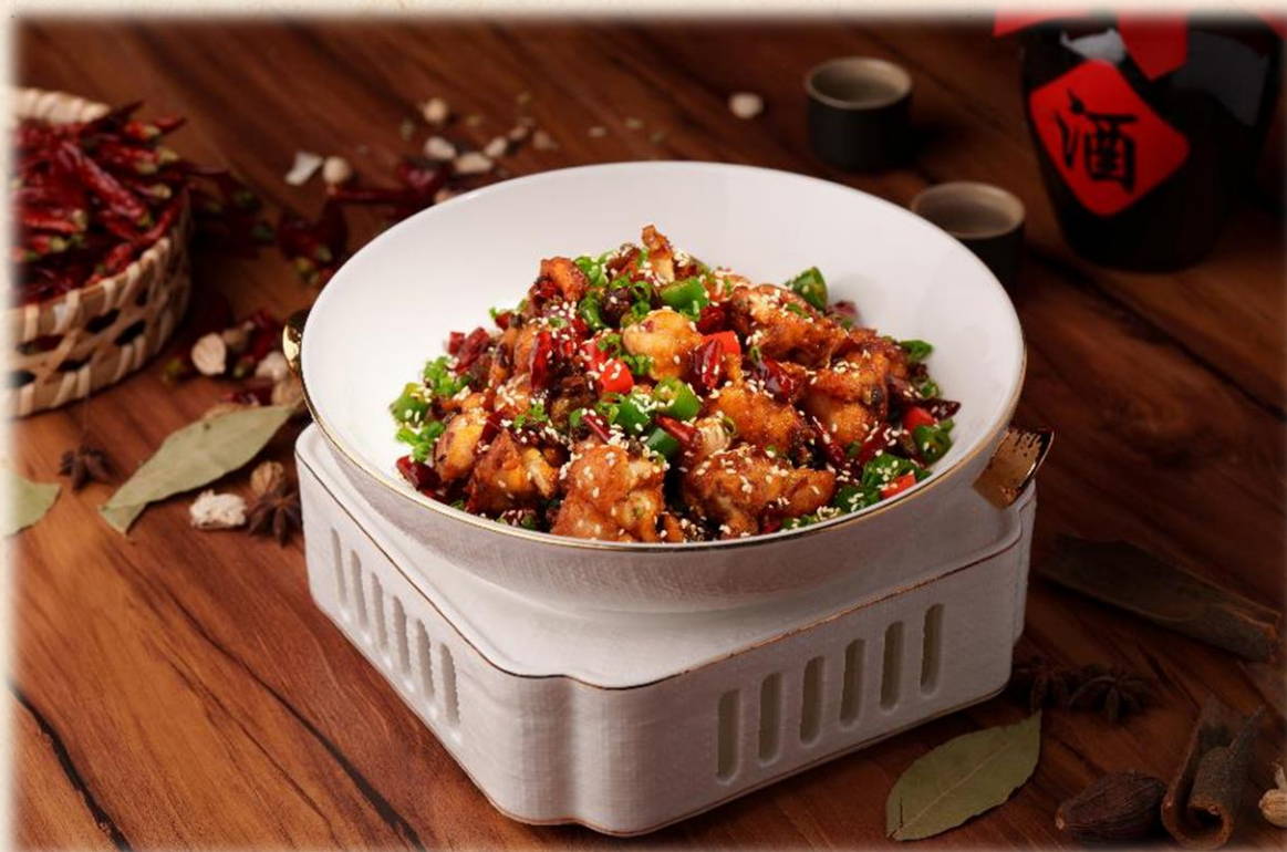
干锅牛蛙 澳门元 MOP 198 Braised Bullfrog with Chili Sauce