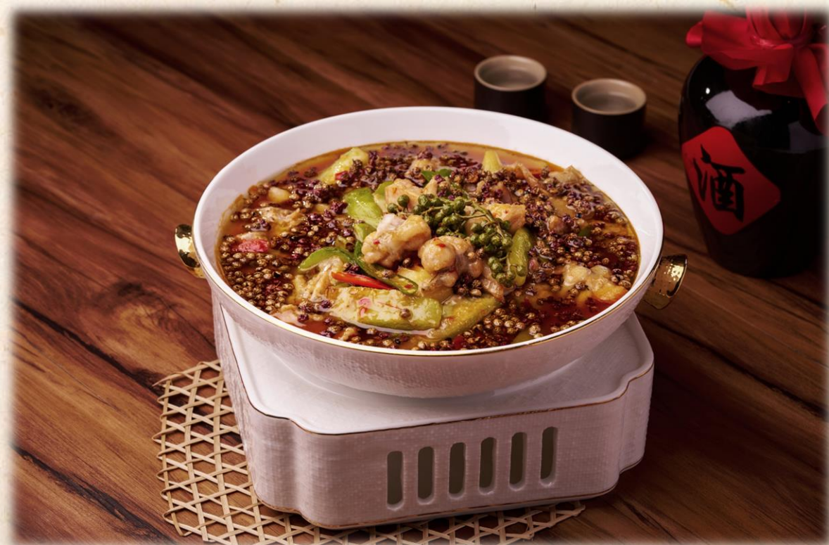
仔姜泡椒跳跳蛙 澳门元 MOP 178 Braised Bullfrog with Pickled Chili and Ginger