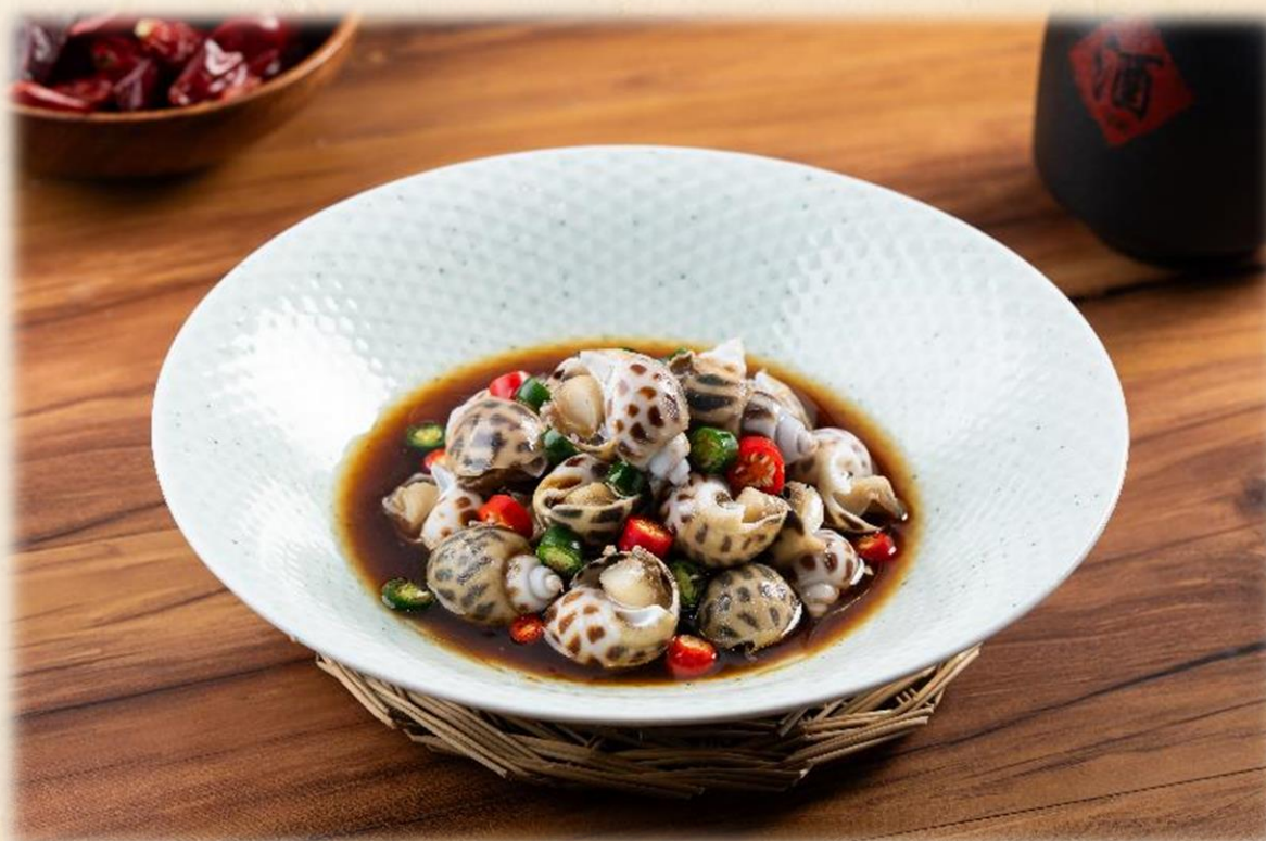
脆爽辣花螺 Marinated Sea Whelk in Homemade Chili Sauce