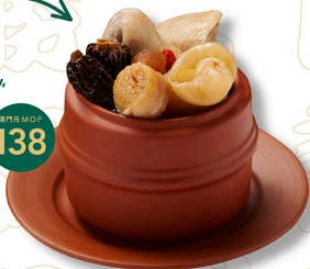
花膠羊肚菌燉乳鴿 Double-boiled Soup with Fish Maw, Morels and Pigeon