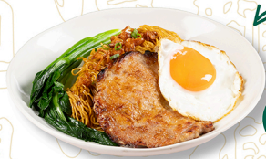
招牌豬扒煎蛋蔥油撈麵 Tossed Noodles with Pork Chop and Egg in Spring Onion Dressing