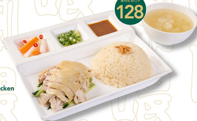
泰式無骨雞飯 Thai Style Boneless Chicken with Rice