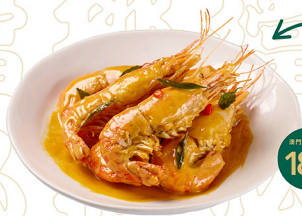
富貴金沙蝦 Fried Prawns in Egg Yolk Sauce