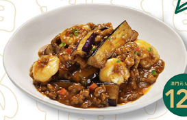
魚香蝦仁燒茄子 Braised Eggplant with Minced Pork and Salted Fish