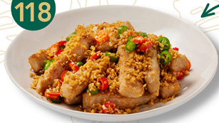
椒鹽無骨豬扒 Deep-fried Pork Chop with Spicy Salt and Pepper