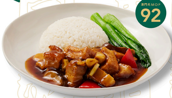
豆腐火腩飯 (男人的浪漫) Rice with Braised Roasted Pork Belly and Tofu