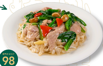
濕炒菜遠肉片河 Fried Flat Rice Noodles with Pork and Vegetables