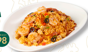
西洋炒飯 Fried Rice in Tomato Sauce