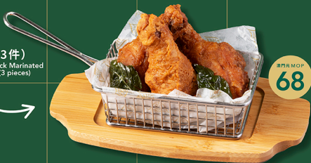
路環蝦醬炸雞鎚 (3件) Deep-fried Chicken Drumstick Marinated with Coloane Shrimp Paste (3 pieces)