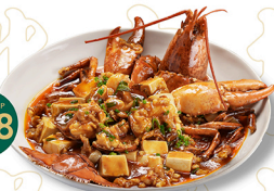
麻婆豆腐燒 波士頓龍蝦 Mapo Tofu with Boston Lobster