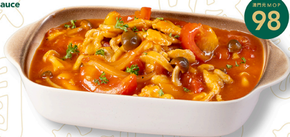
茄汁雞球/牛肉 Chicken / Beef in Tomato Sauce (意粉/白飯) (Spaghetti / Rice)