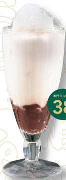
懷舊紅豆冰 Iced Red Bean Drink 雪糕一球加澳門元12 Add MOP12 for one scoop of ice cream