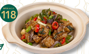
紫蘇煎焗排骨仔 Pan-fried Pork Rib with Perilla Leaves