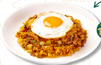
泡菜肥牛炒飯 Fried Rice with Beef and Korean Kimchi