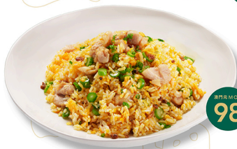
鹹魚雞粒炒飯 Fried Rice with Chicken and Salted Fish