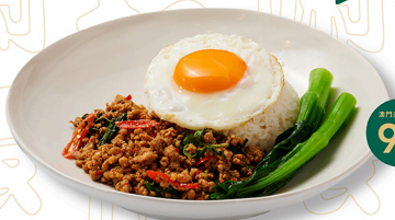
泰式打拋肉碎飯 Rice with Stir-fired Thai Basil and Minced Pork