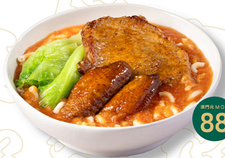
👍 豬扒雞翼番茄湯通粉 Macaroni in Tomato Soup with Pork Chop and Chicken Wings