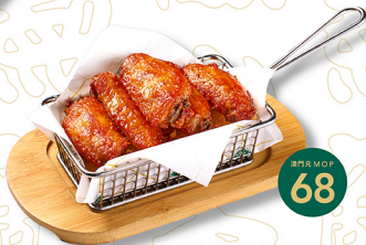
南乳炸鷄翼 (5件) Fried Chicken Wings Marinated in Red Fermented Bean Curd (5 pieces)