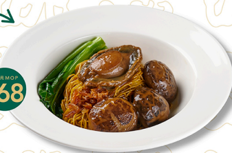
冬菇豬手湯面/撈麵 Tossed/ Soup Noodles with Pork knuckle and mushroom