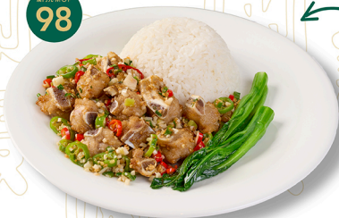
椒鹽排骨飯 Deep-fried Pork Ribs in Spicy Salt with Rice