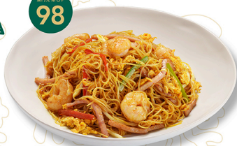
星洲炒米 Singaporean Style Fried Rice Vermicelli