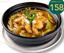
青一色水煮牛蛙 Sichuan Style Braised Frog in Chili Broth