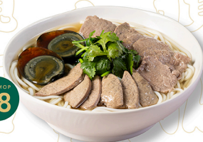
👍 豬潤牛肉皮蛋芫茜米線 Pork Liver and Beef with Rice Noodles in Century Egg and Coriander Soup