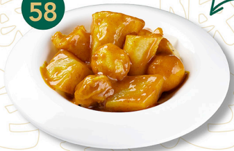
港式咖喱四寶 (魚蛋、魚腐、豬皮、白蘿蔔) Hong Kong Style Curry Treasures (Fish Balls, Fish Tofu, Pork Skin, Turnip)