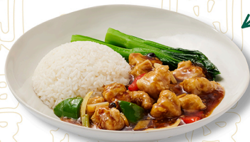
豉汁排骨飯 Rice with Pork Ribs in Black Bean Sauce