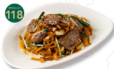
鑊氣乾炒牛河 Fried Flat Rice Noodles with Beef