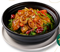
鮑魚辣雞煲 Spicy Chicken and Abalone Casserole