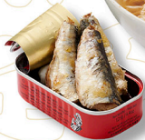
辣魚煎蛋公仔麵 Instant Noodles with Spicy Sardine and Fried Egg