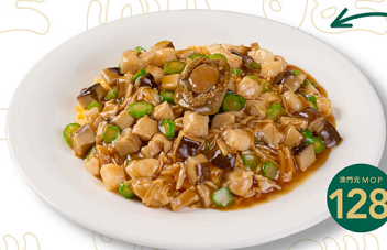
鮑魚福建燴飯 Fujian Fried Rice with Abalone