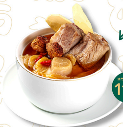
姬松茸明目魚燉赤肉 Double-boiled Pork Rib Soup with Sun Mushroom and Asian Moon Scallop