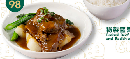
秘製蘿蔔牛筋腩飯 Braised Beef Brisket, Tendon and Radish with Rice